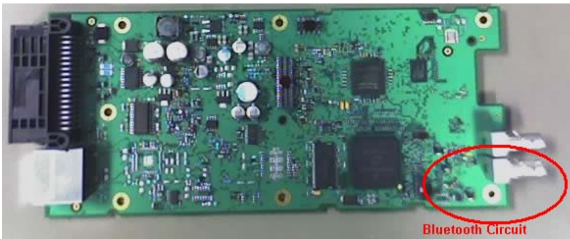
Figure 5: Internal rear view with the Bluetooth circuit circled.