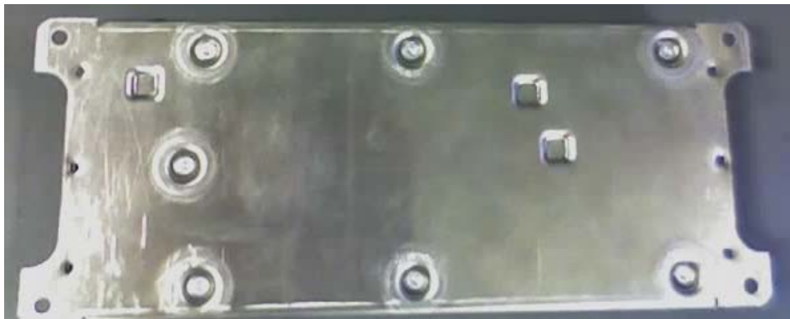
Figure 2: External back view.