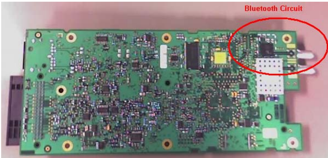
Figure 4: Internal front view with the Bluetooth circuit circled.