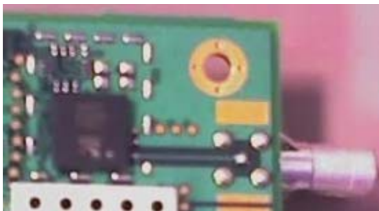
Figure 6: Internal front view, close-up of Bluetooth circuit.