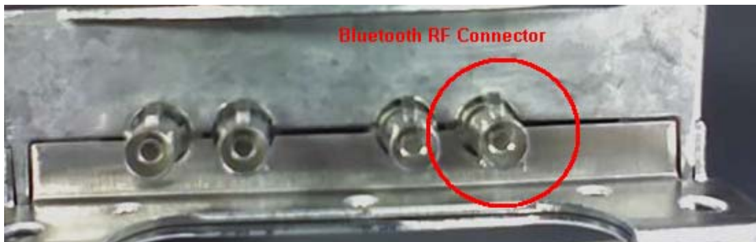
Figure 3: External side view showing the location of the Bluetooth RF connector. A Bluetooth antenna will be attached to the connector during the factory assembly process.