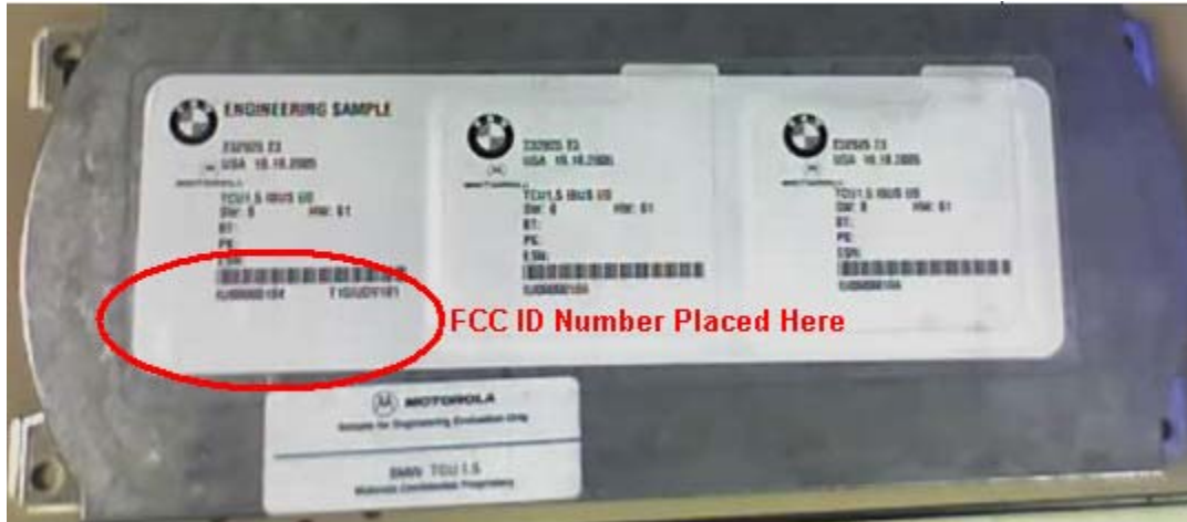
Figure 1: External front view. FCC label location circled.