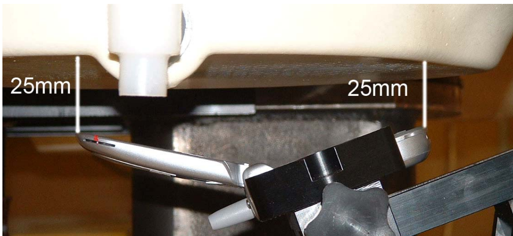
Figure 2. Phone under a flat phantom in PTT mode