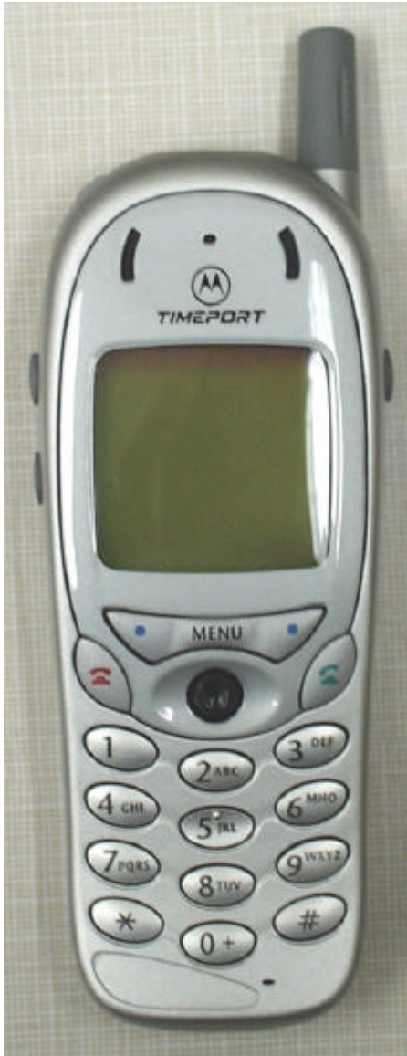
Figure 6. Front of Phone