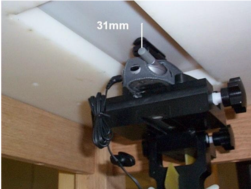
Figure 12. Phone Against the Flat Phantom with Antenna 31mm away from the base (Holster with Belt Clip)