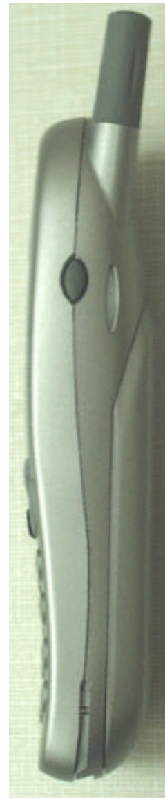
Figure 7. Side of Phone