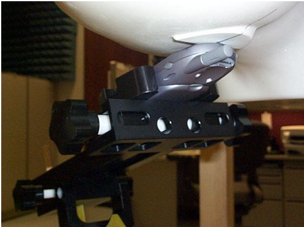
Figure 11. Phone Against the Head Phantom Back View (Tilt Position)