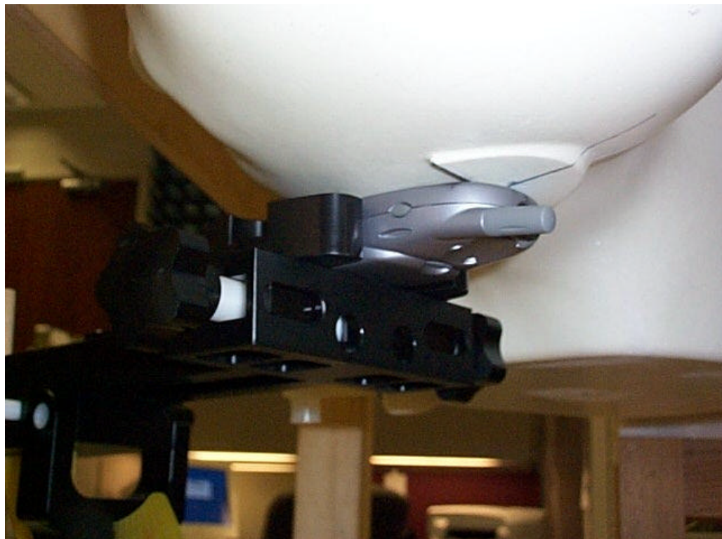
Figure 9. Phone Against the Head Phantom Back View (Cheek Touch)