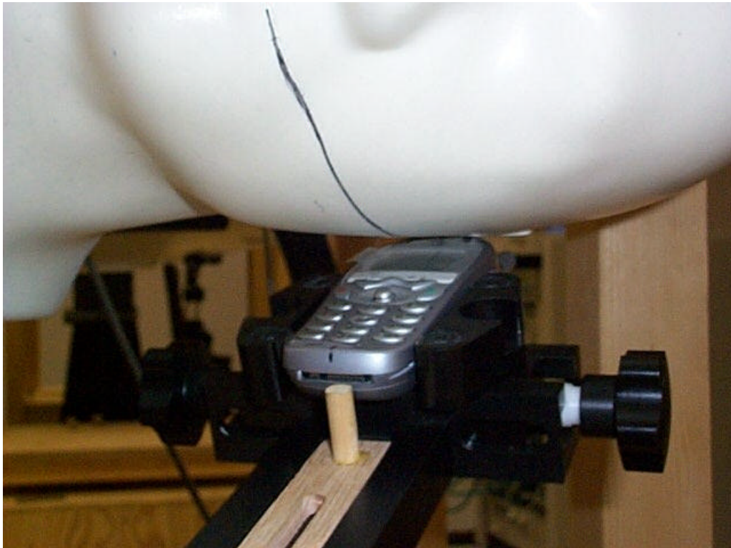
Figure 10. Phone Against the Head Phantom Front View (Tilt Position)