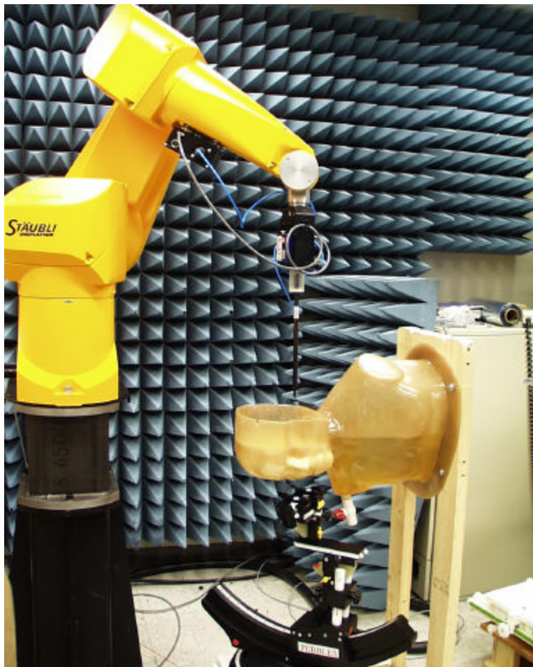
Figure 2. DASY™ Measurement System

The measurement methodology is described in IEEE Transactions on Vehicular Technology, vol. 44, no. 3, August 1995, titled Electromagnetic Energy Exposure of Simulated users of Portable Cellular Telephones. The Dasy™ system is operated per the instructions in the Dasy™ Users Manual. The entire manual is available directly from SPEAG™.