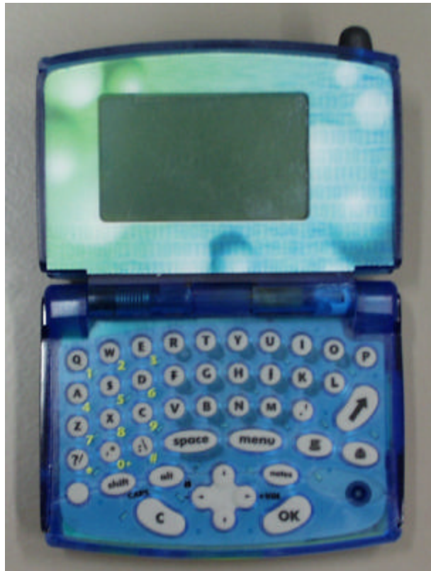
Figure 1. Front of Phone.

A prototype unit serial number 062000B was measured. This unit is identical in physical construction, maximum radiated power levels and antenna structure to units that will be in production. It transmits in the frequency range of 1850 to 1910 MHz using GSM mode. The unit was tested at its maximum transmitter power. The unit is equipped with a fixed antenna that serves as both a receive and transmit antenna. The antenna has a single operating position as shown in figure 1.