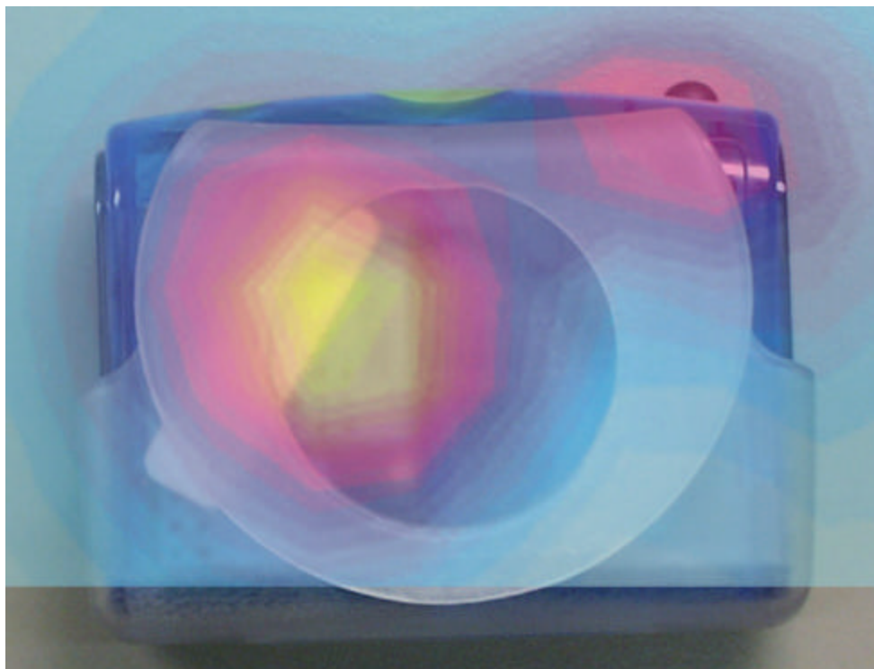
Figure 4. Typical Contour Plot Overlaid on top of Back of Phone