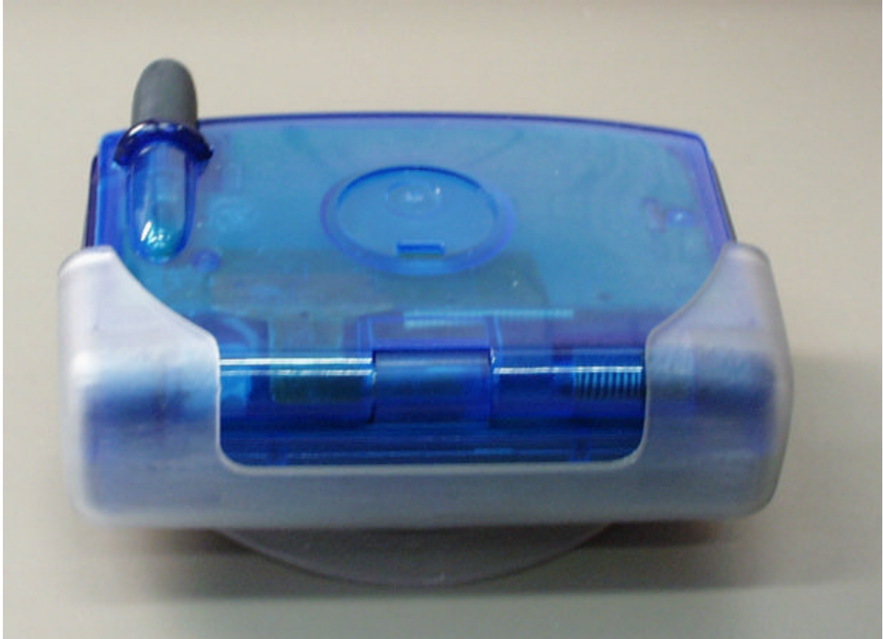
Figure 3. Test Unit inside of Body Worn Holster

The cellular phone (FCC ID IHDT6AW1) can be used in a body-worn configuration using the supplied belt clip. We have performed an evaluation to show RF exposure compliance when used with the belt clip. Figure 3 shows the test unit as it is placed into the body worn holster