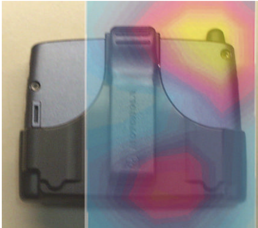
Figure 3. Contour Plot overlaid on Phone and Belt-clip