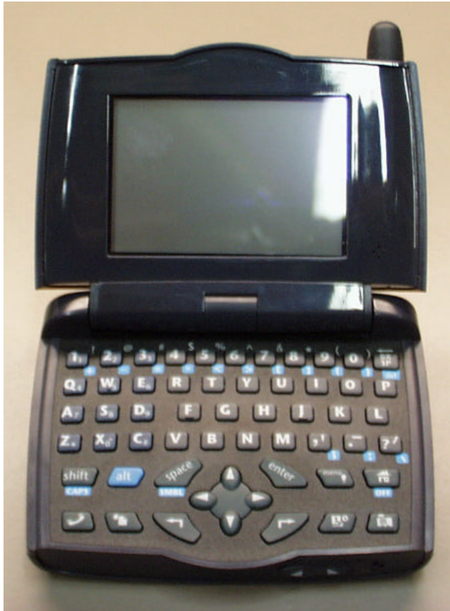
Figure 1. Face of Motorola portable cellular phone FCC ID IHDT6AF1