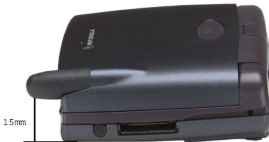
Figure 4. Picture of Phone showing Distance Provided by Belt-clip