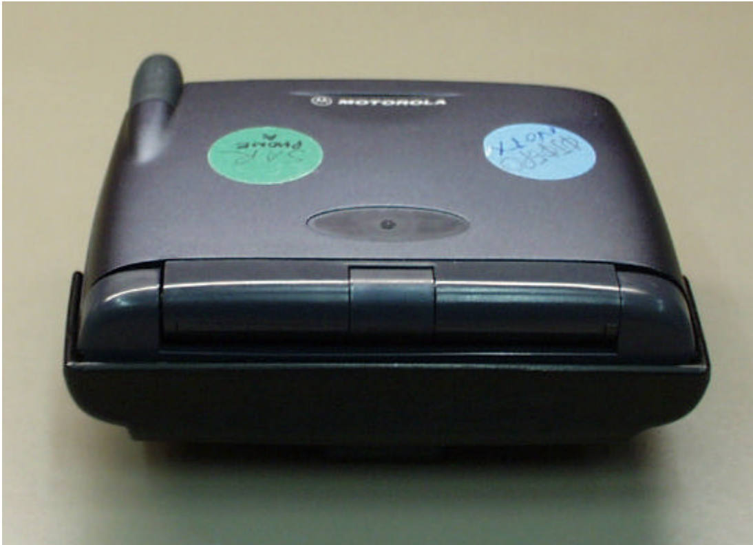
Figure 2. Motorola portable cellular phone FCC ID IHDT6AF1 in Belt-clip