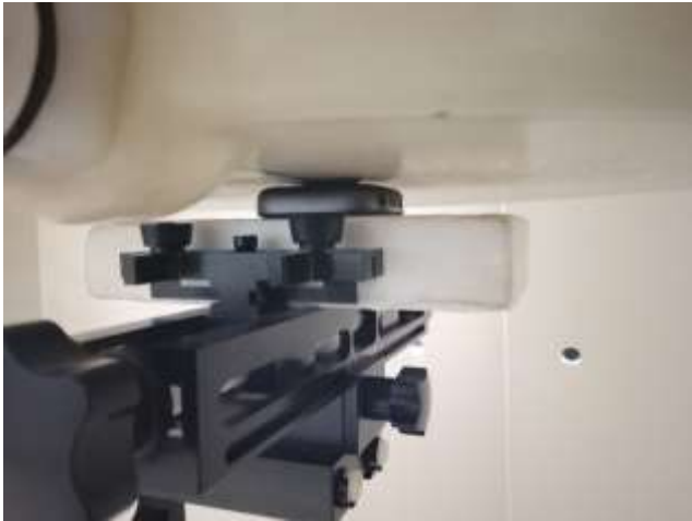
Wrist -Worn(Back), Test Separation 0 mm