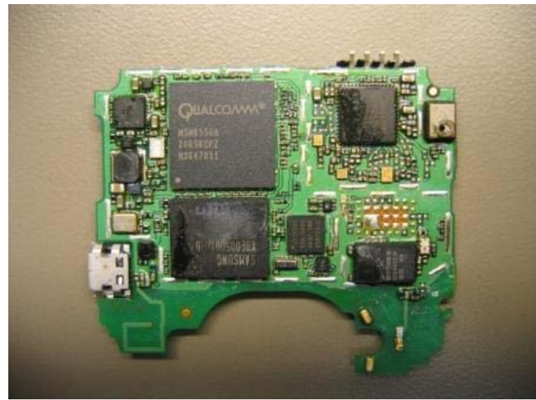
Main Board Top Without Shields