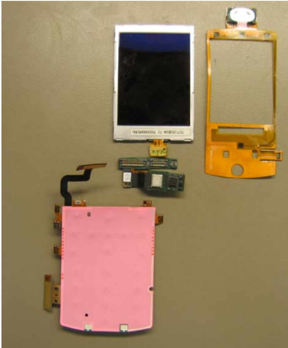
LCD, Keypad & Flex