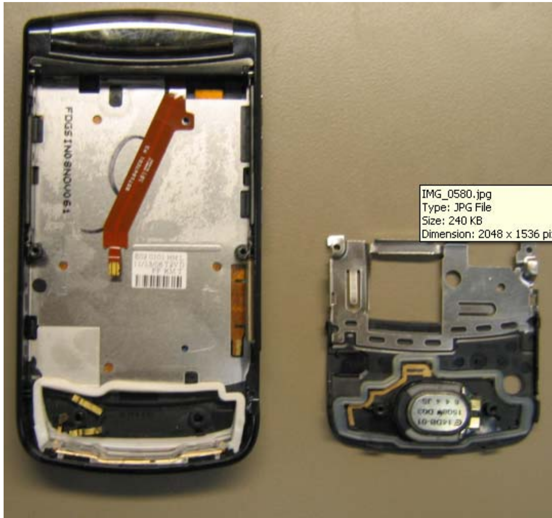
Inside Front Housing