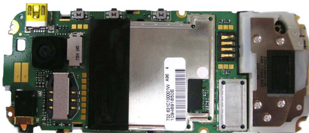
Main board back with Shields