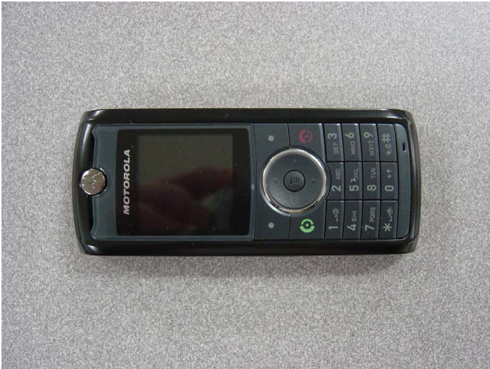
Figure 1. Front of Phone

MOTOROLA, INC. Portable Cellular Phone SAR Test Report Number: 20179-1F