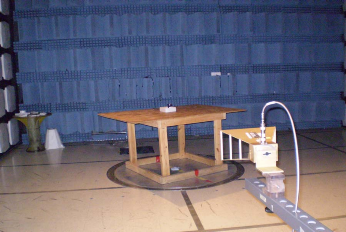
EMC Report #20183-1, Tx Radiated