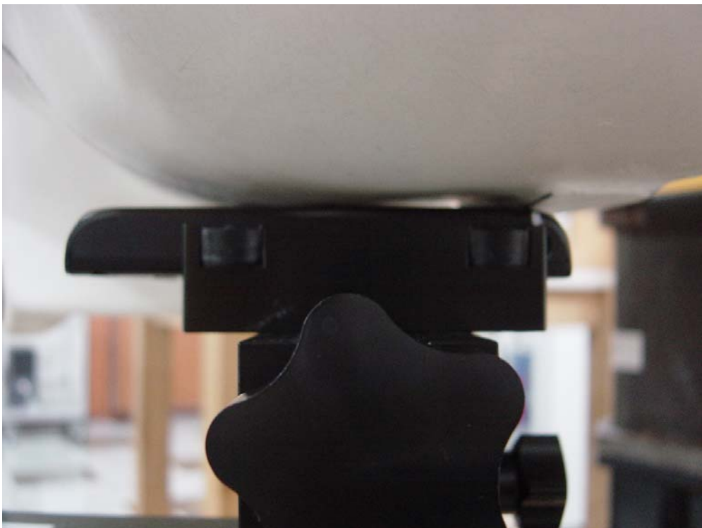
Figure 4. Phone Against the Head Phantom (Cheek Touch)