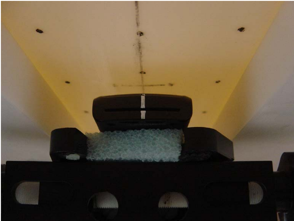
Figure 3. Phone Against the Flat Phantom

MOTOROLA, INC. Portable Cellular Phone SAR Test Report Number: 20179-1F