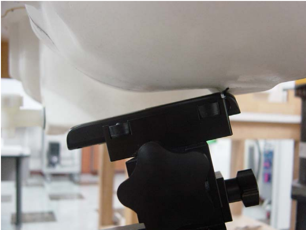
Figure 5. Phone Against the Head Phantom (15°Tilt)

MOTOROLA, INC. Portable Cellular Phone SAR Test Report Number: 20179-1F