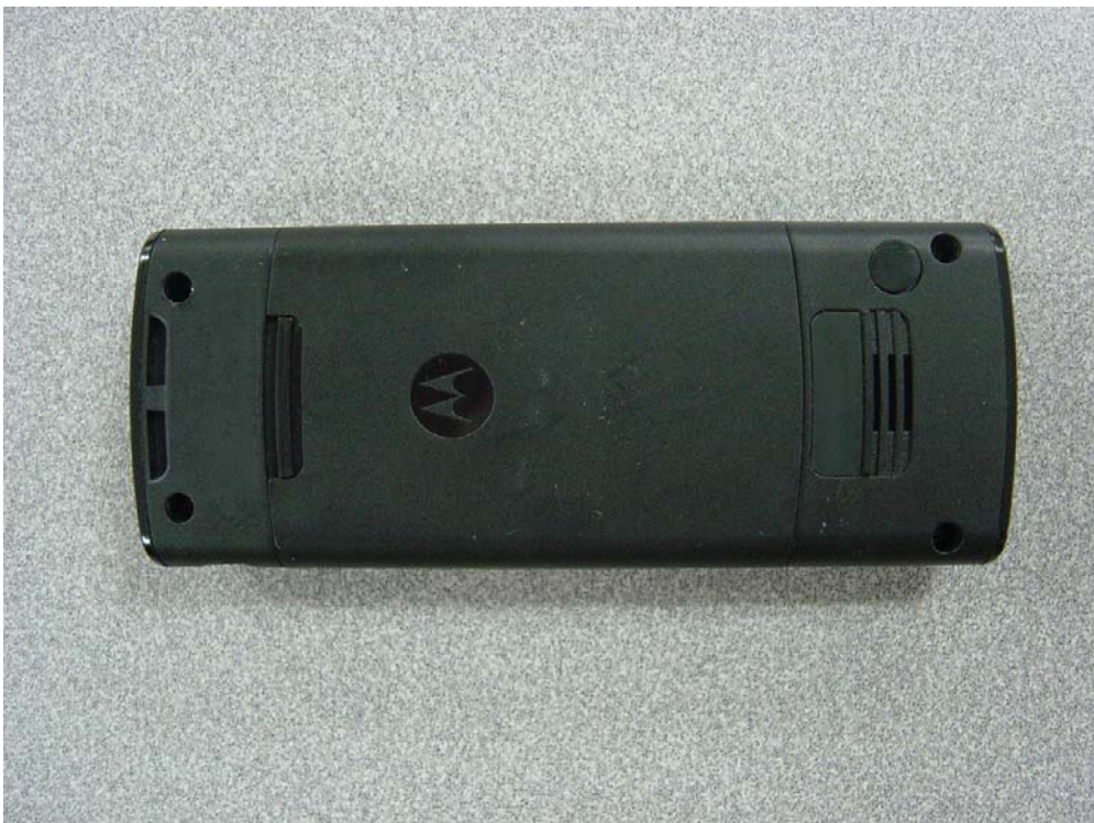
Figure 2. Back of Phone