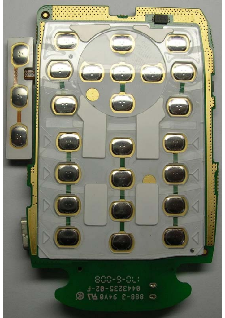
Main Board(keypad installed)