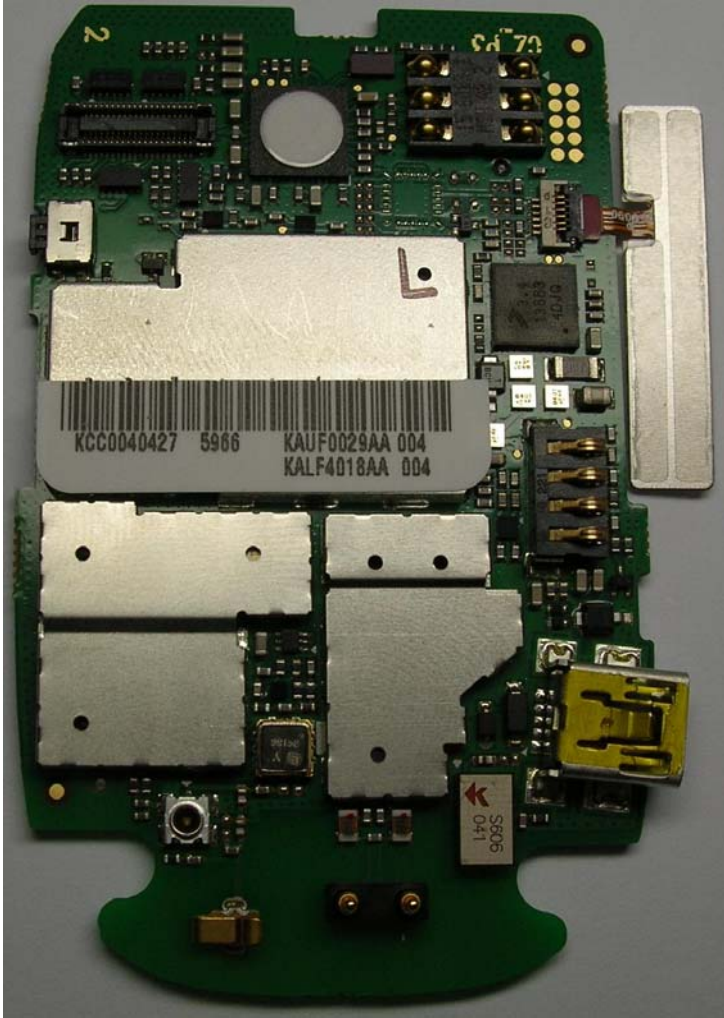
Main Board(shield on)