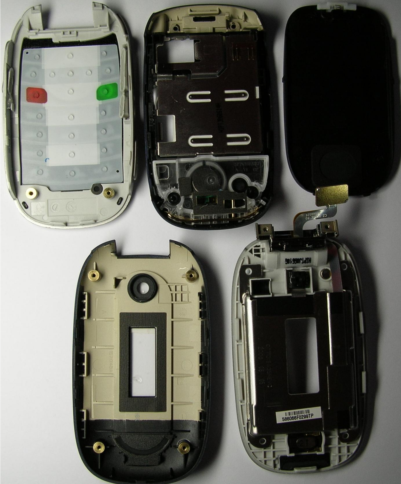
Housing internal views