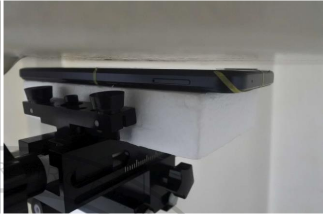
Back, Test Separation 5 mm