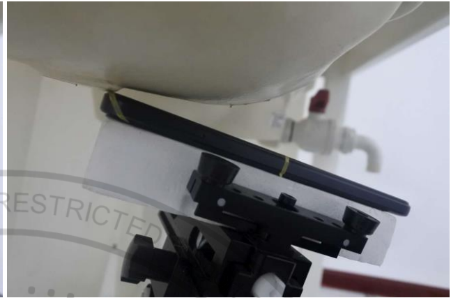
Right Tilted, Test Separation 0 mm