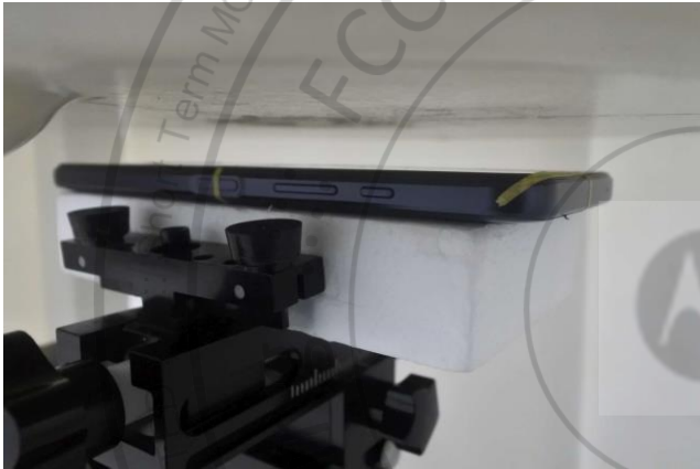
Front, Test Separation 13 mm(sensor off)