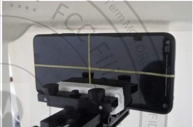
Right Side, Test Separation 5 mm