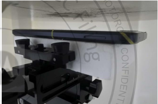
Back, Test Separation 19 mm(sensor off)