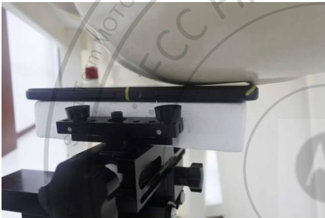
Left Cheek, Test Separation 0 mm