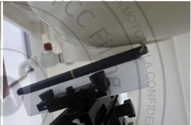
Left Tilted, Test Separation 0 mm