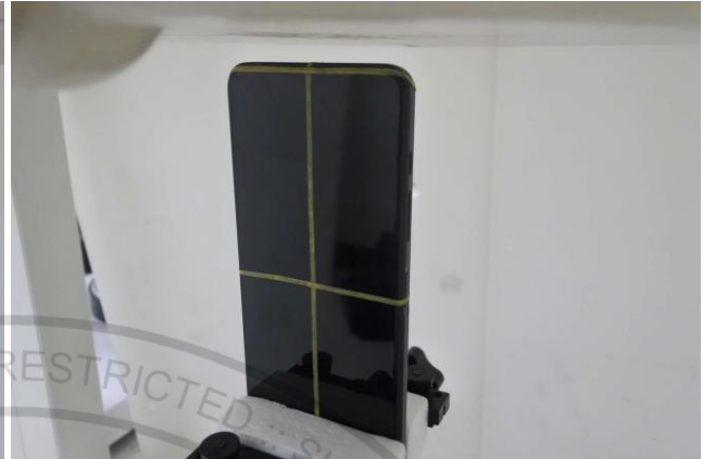
Top side, Test Separation 7 mm(sensor off)