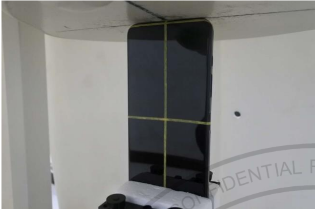
Top Side, Test Separation 0 mm