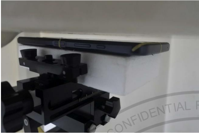
Front, Test Separation 5 mm