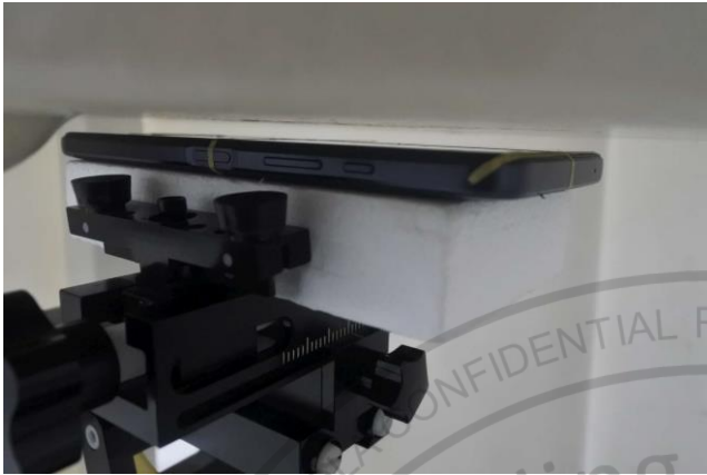
Front, Test Separation 5 mm