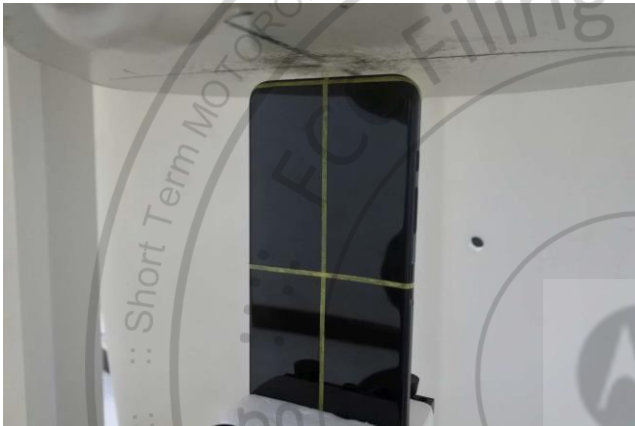
Top Side, Test Separation 5 mm