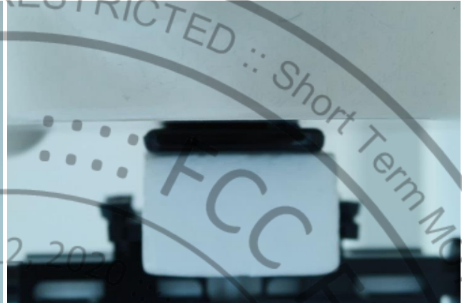
Back, Test Separation 0 mm