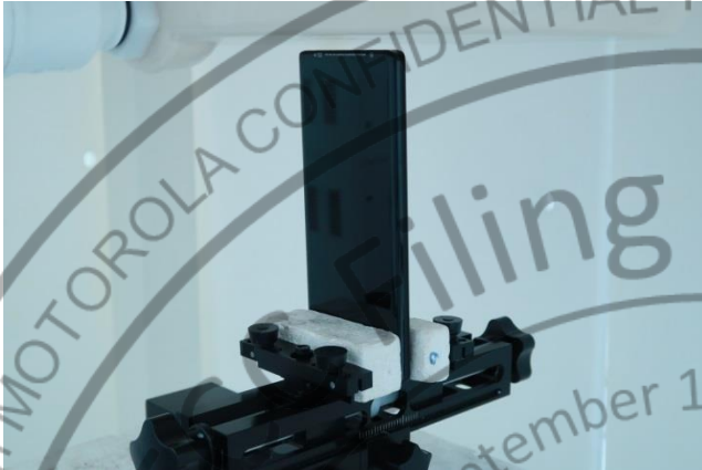
Bottom Side, Test Separation 5 mm