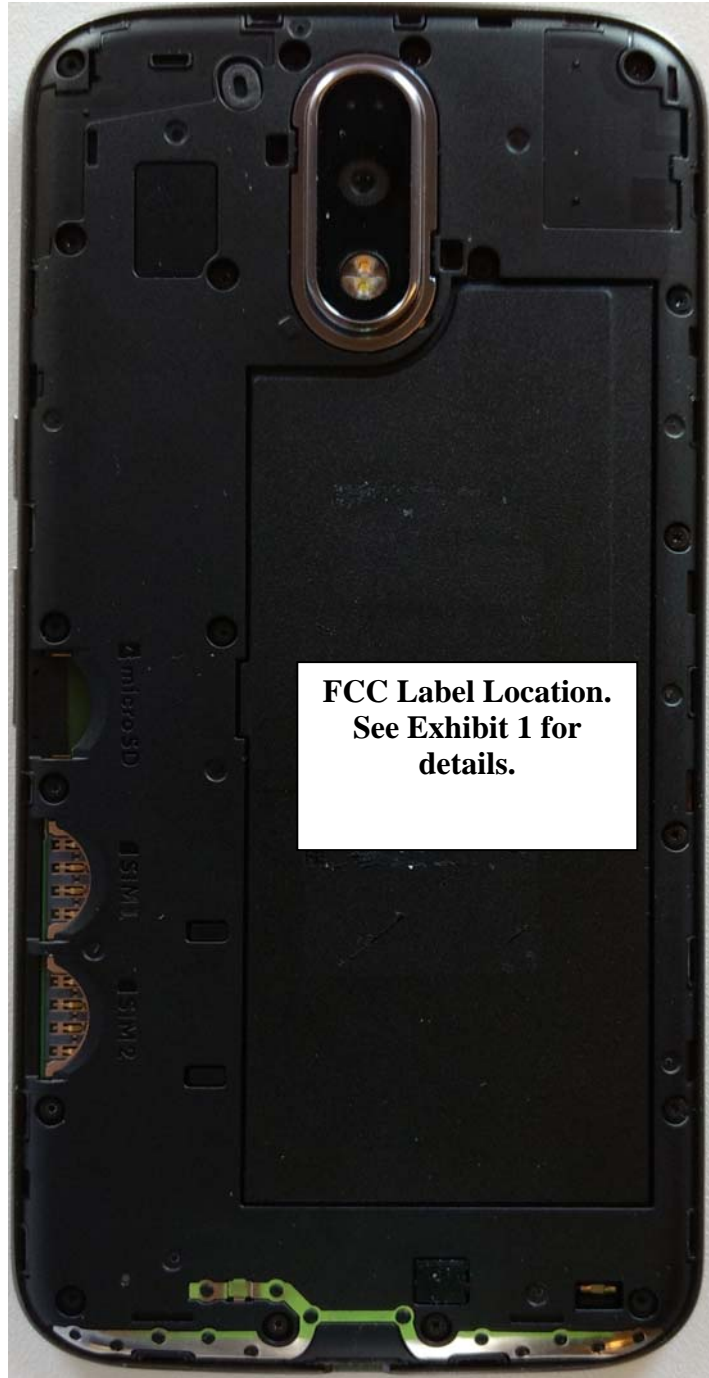
Figure 3-3. Back of device (Opened)