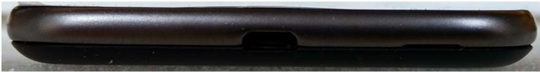
Figure 3-6. Bottom of radio