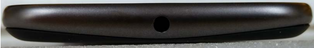
Figure 3-5. Top of radio