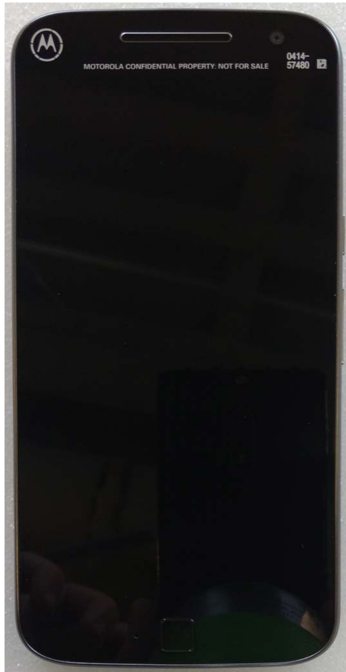
Figure 3-1. Front of device

The radio product colors, housings/bezels may vary, but only consistent with the requirements of FCC Class I Permissive Change rules and guidance (47 CFR 2.1043 and KDB 178919 D01).