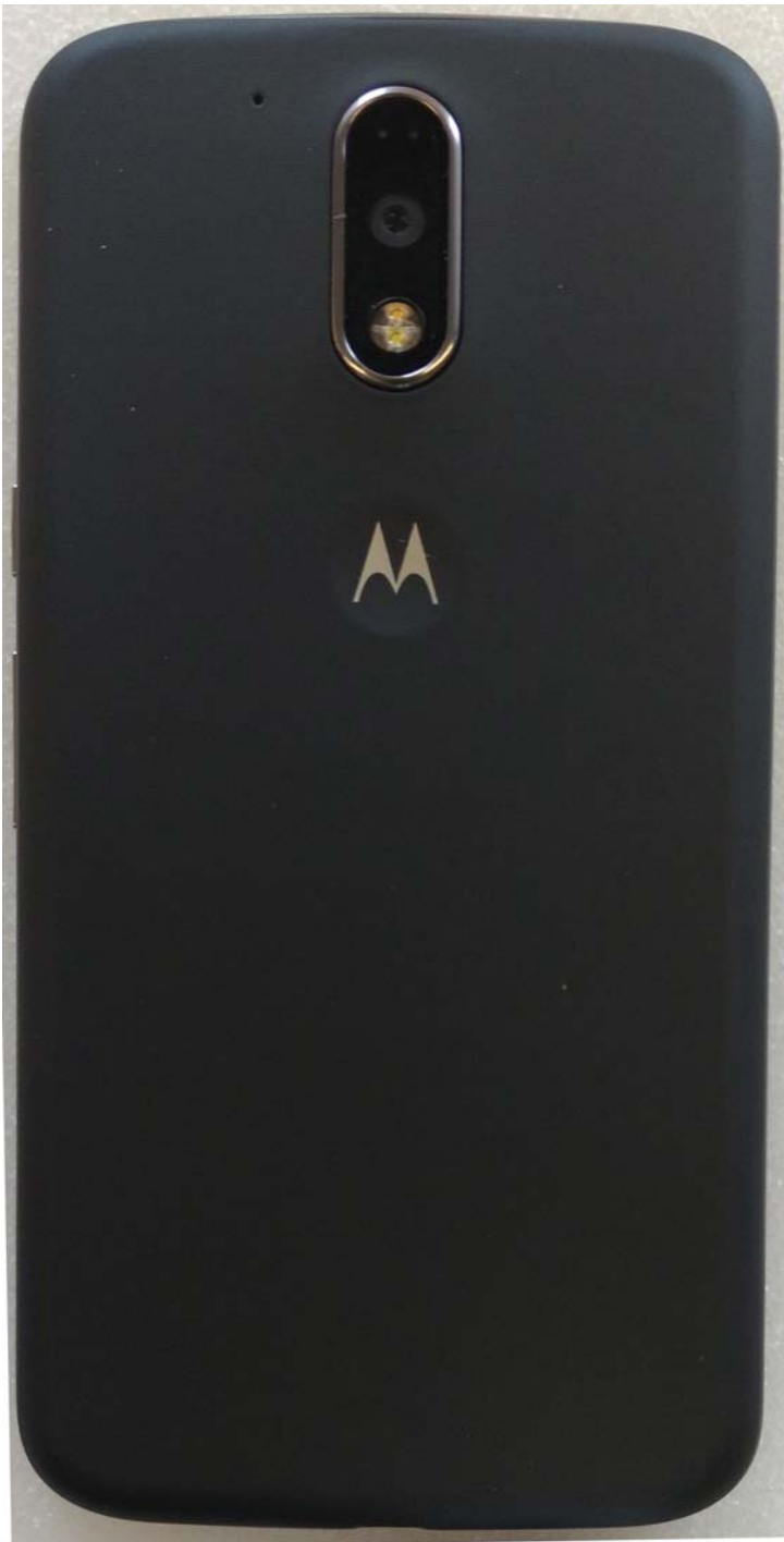
Figure 3-2. Back of device