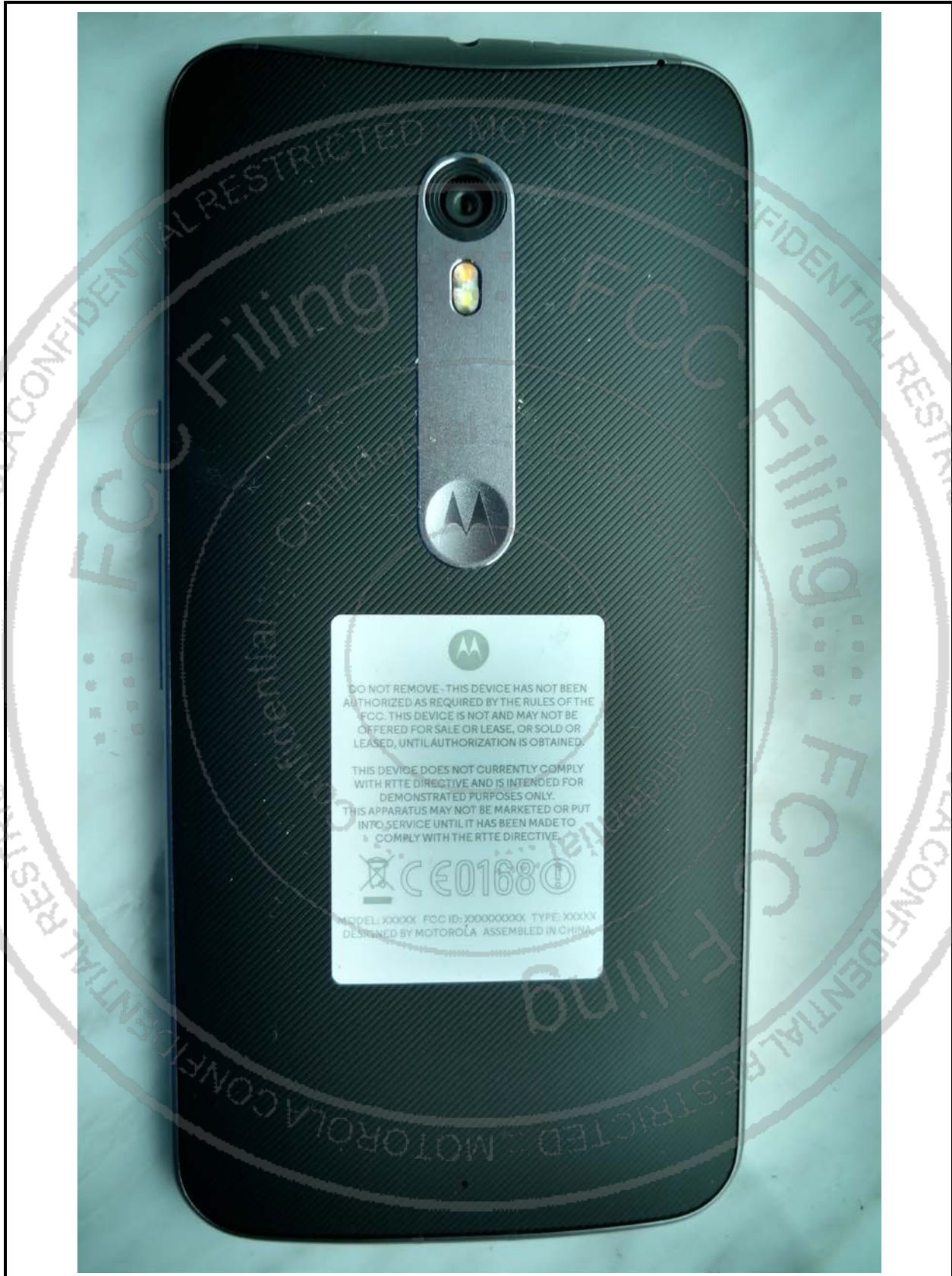
Figure 3-2. Back of device