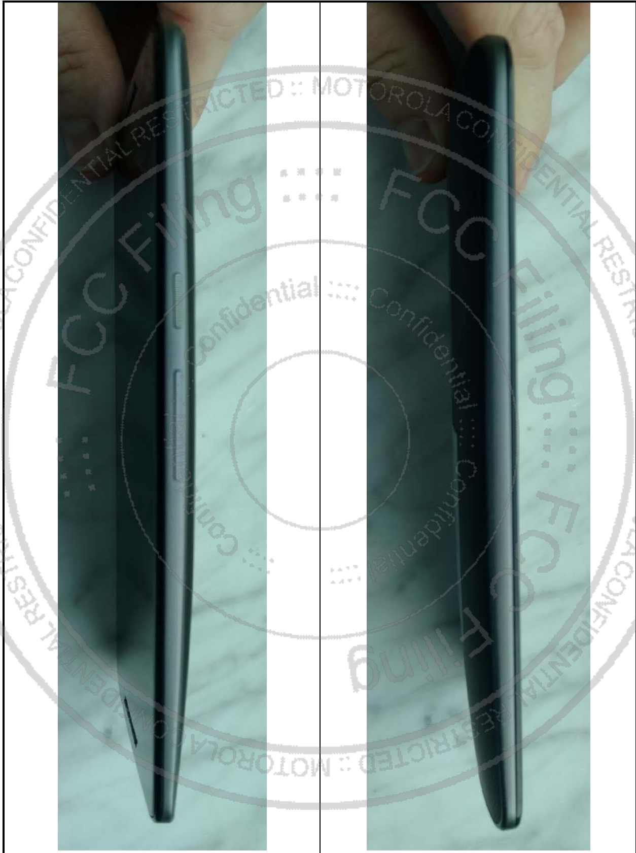
Figure 3-3. Button Side of device