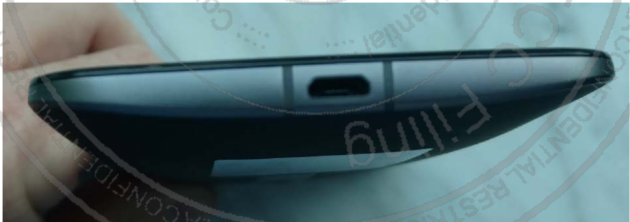
Figure 3-6. Bottom of radio