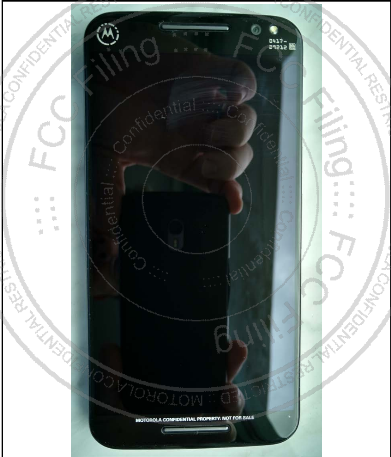
Figure 3-1. Front of device

The radio product colors, housings/bezels may vary, but only consistent with the requirements of FCC Class I Permissive Change rules and guidance (47 CFR 2.1043 and KDB 178919 D01).