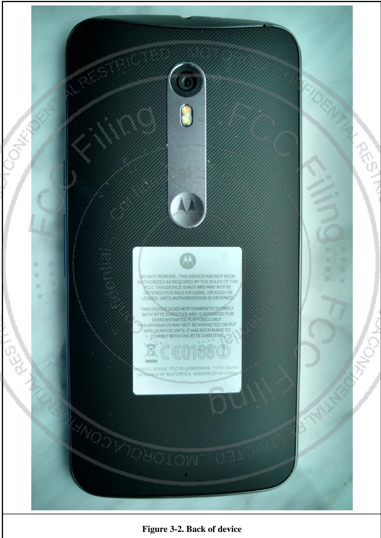
Figure 3-2. Back of device