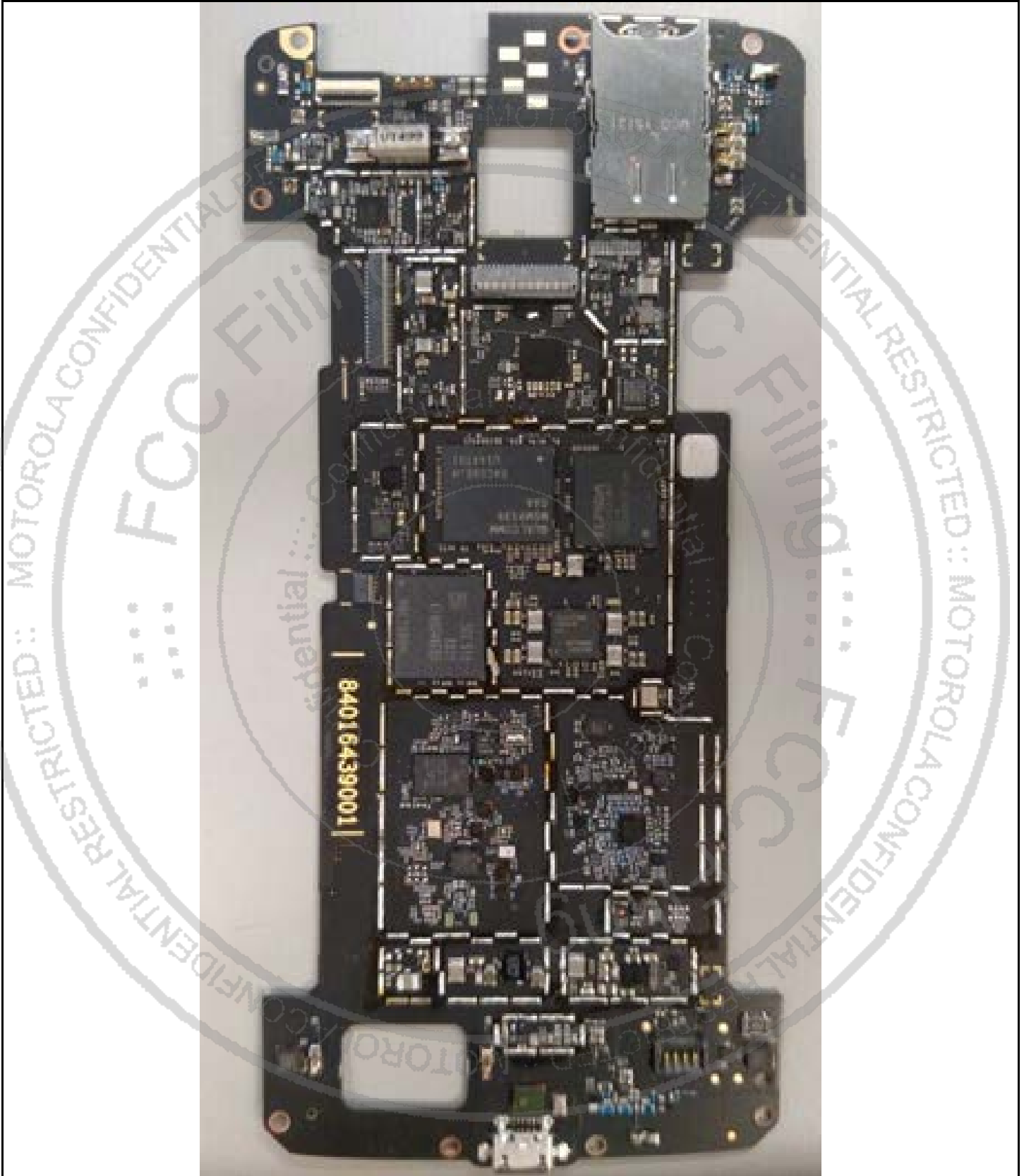
Photograph 9-3: Front side view of the device's PC Board, Shields Removed.