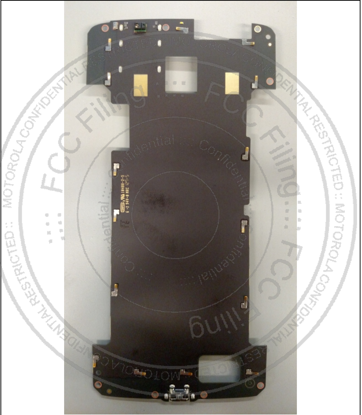
Photograph 9-2: Back side view of the device's PC Board, Shields in place.