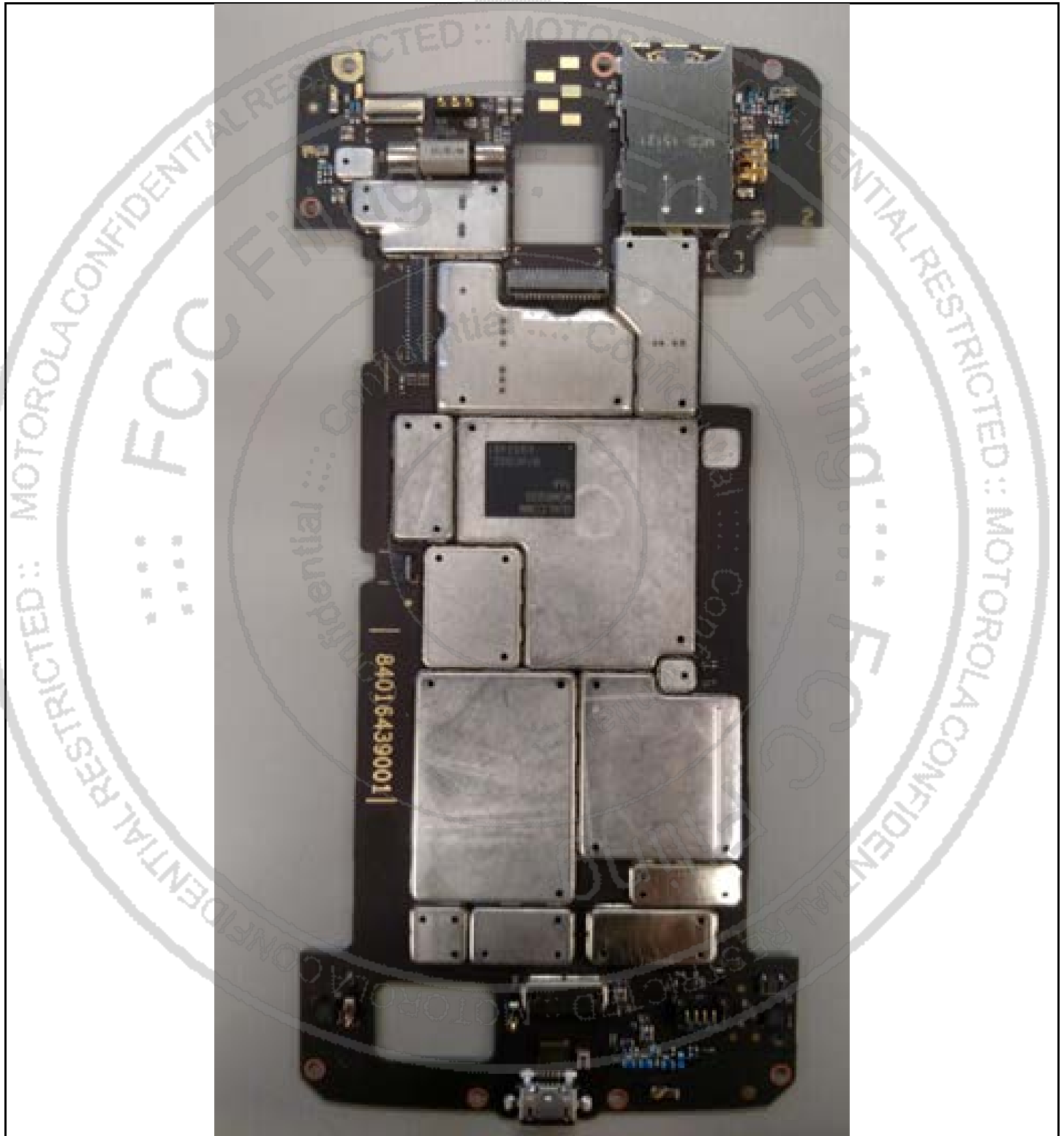
Photograph 9-1: Front side view of the device's PC Board, Shields in place.