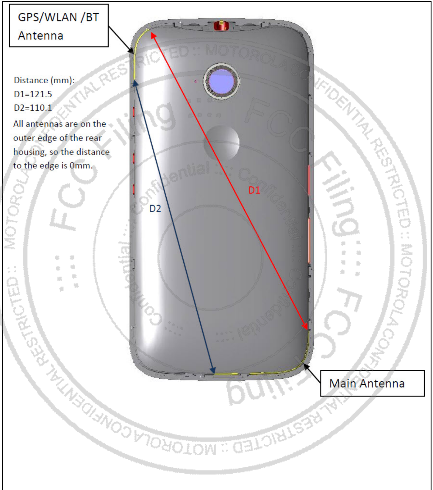
Photograph 9-4: Transmitter Antennas and Spacing.