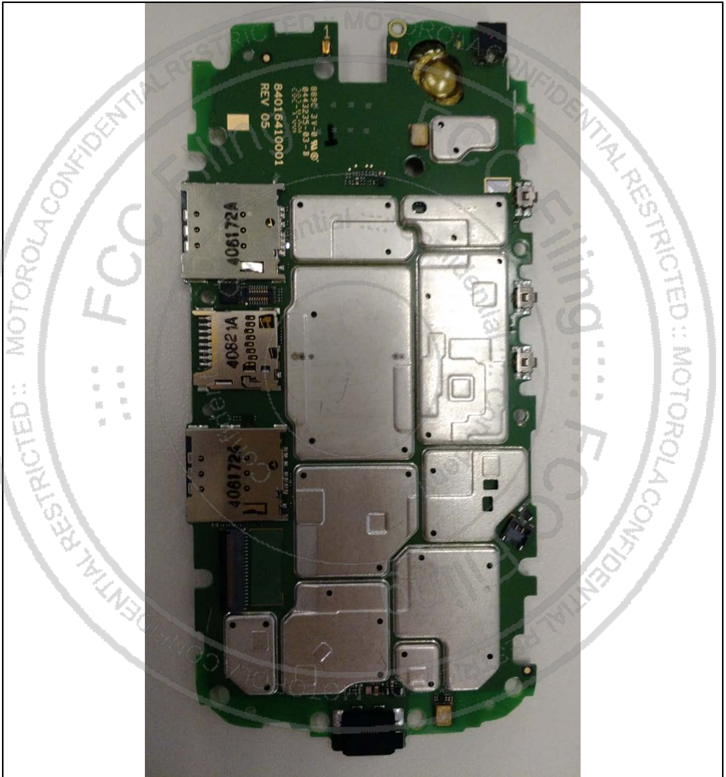
Photograph 9-1: Front side view of the device's PC Board, Shields in place.