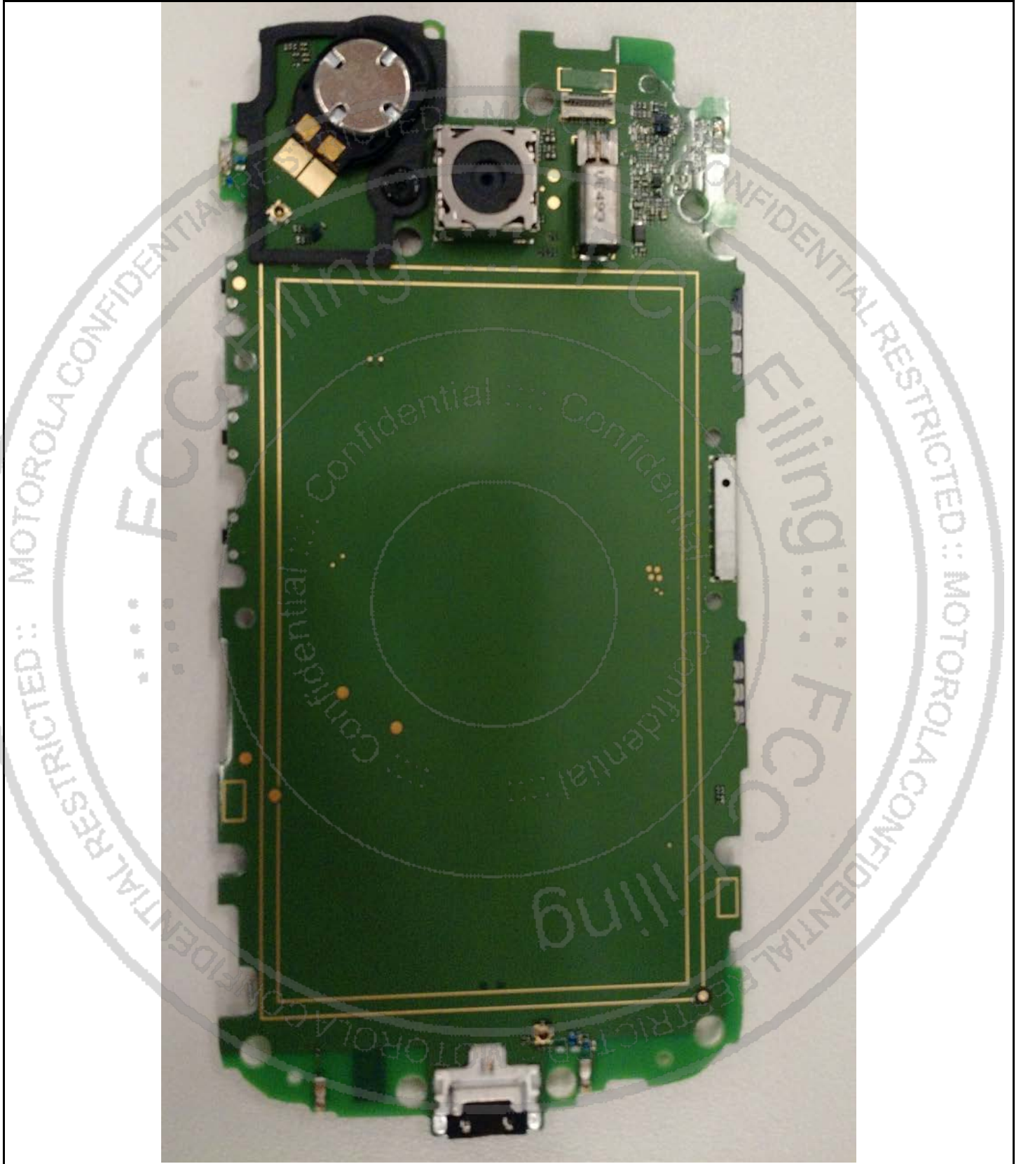
Photograph 9-2: Back side view of the device's PC Board, Shields in place.