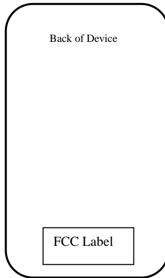
Figure 1.3.2. Location of FCC Label, beneath rear cover (position, orientation, and other information shown may vary).

Please note that this label and its placement complies with the requirement of FCC Rule 47 CFR 2.925(d) that the label be permanently affixed to the product, and be readily visible to the purchaser at the time of purchase. Further, at the time of purchase, rear covers are shipped in a separate section or compartment of the radio packaging, and are not attached to the radio. In some instances they may be shipped in separate boxes. So, the end user needs to physically install the rear cover by removing the battery cover, if any, or attach the battery before using the radio. The FCC ID is also shown on the packaging itself.