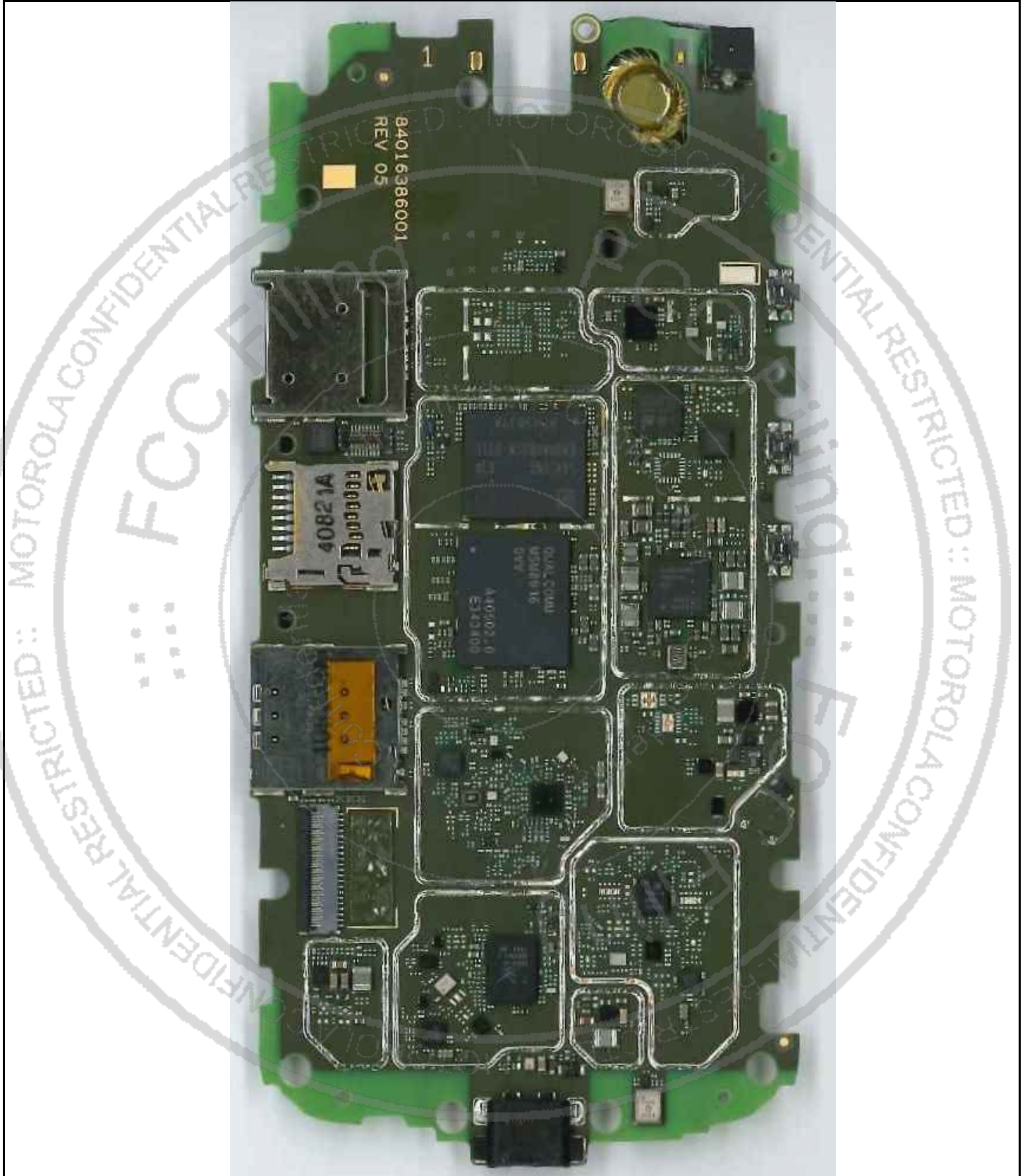
Photograph 9-3: Front side view of the device's PC Board, Shields Removed.