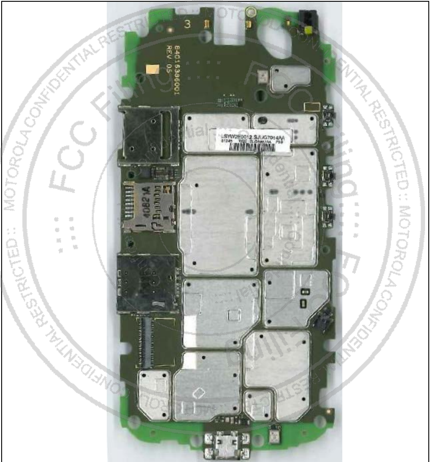
Photograph 9-1: Front side view of the device's PC Board, Shields in place.