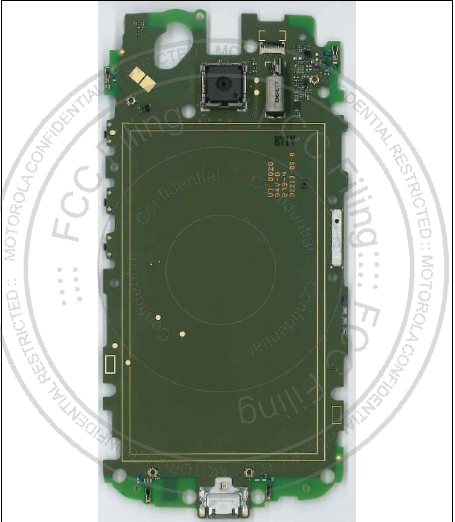
Photograph 9-2: Back side view of the device's PC Board, Shields in place.