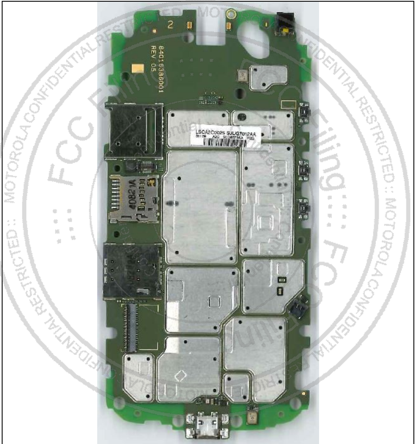
Photograph 9-1: Front side view of the device's PC Board, Shields in place.