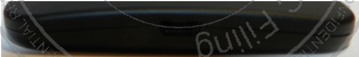
Figure 3-6. Bottom of radio