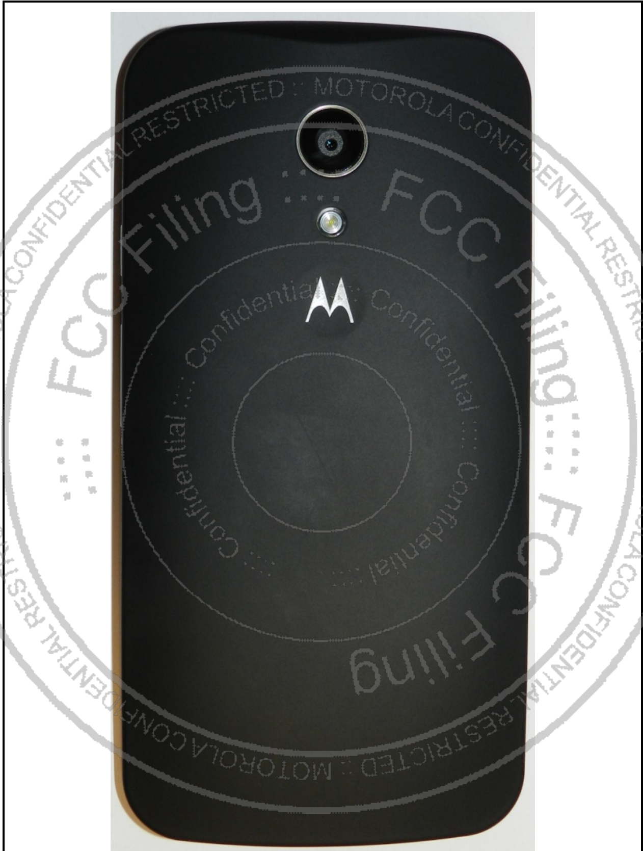
Figure 3-2. Back of device