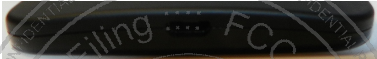
Figure 3-5. Top of radio