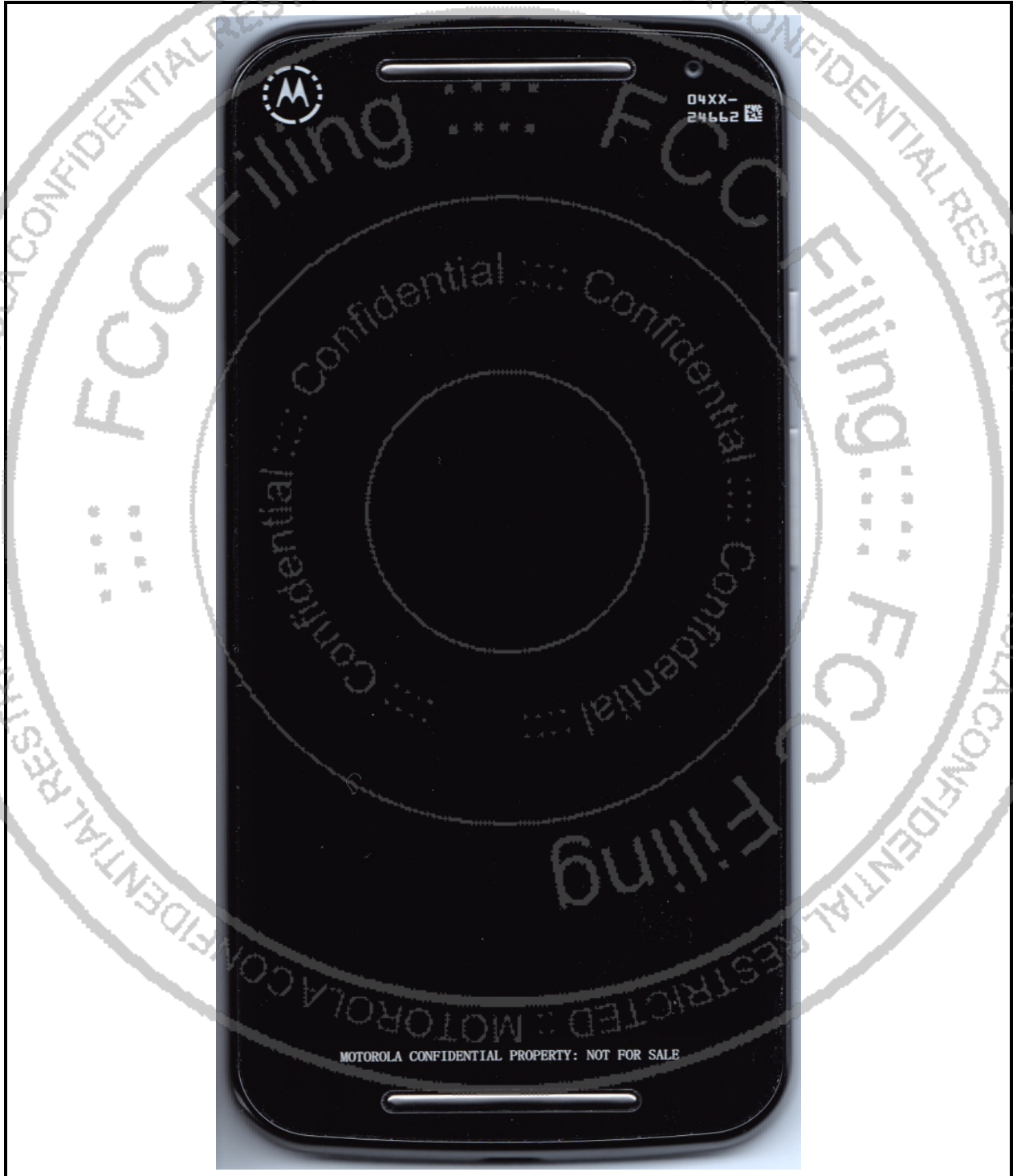
Figure 3-1. Front of device

The radio product colors, housings/bezels may vary, but only consistent with the requirements of FCC Class I Permissive Change rules and guidance (47 CFR 2.1043 and KDB 178919 D01).