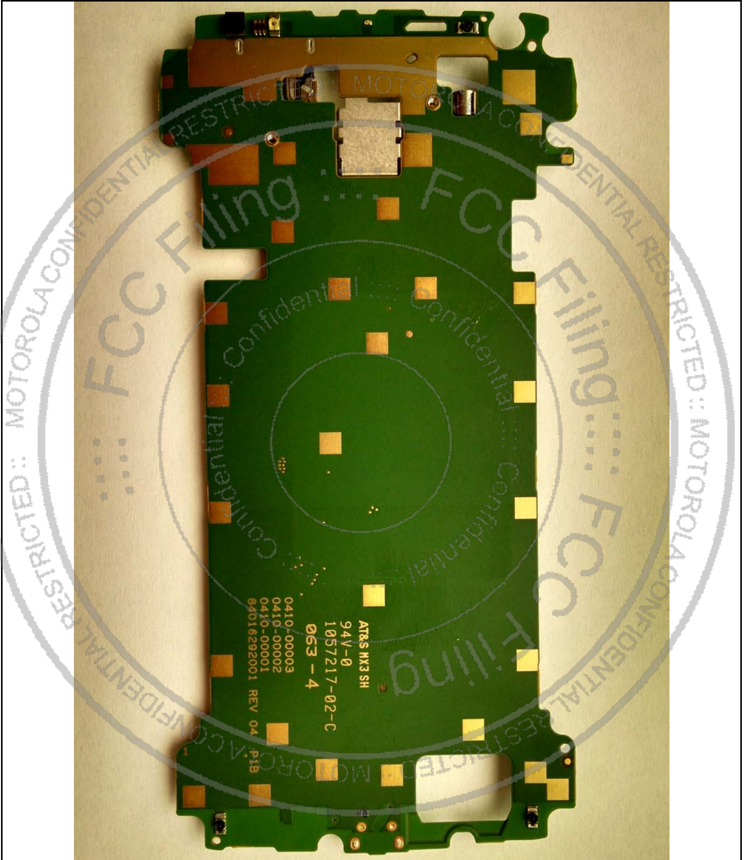
Photograph 9-3: Back side view of the device's PC Board.