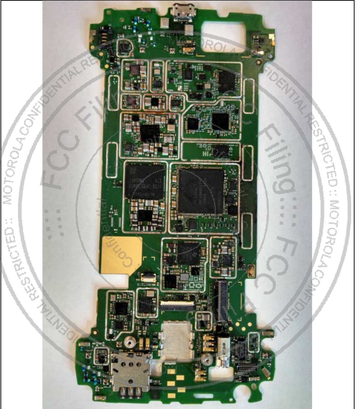
Photograph 9-2: Front side view of the device's PC Board, Shields Removed.