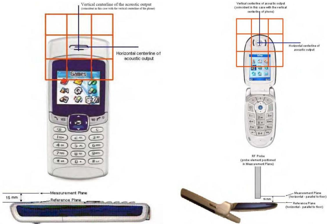
Fig 8.2 EUT reference and plane for HAC RF emission measurements