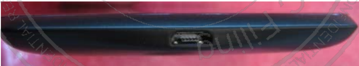
Figure 3-6. Bottom of radio