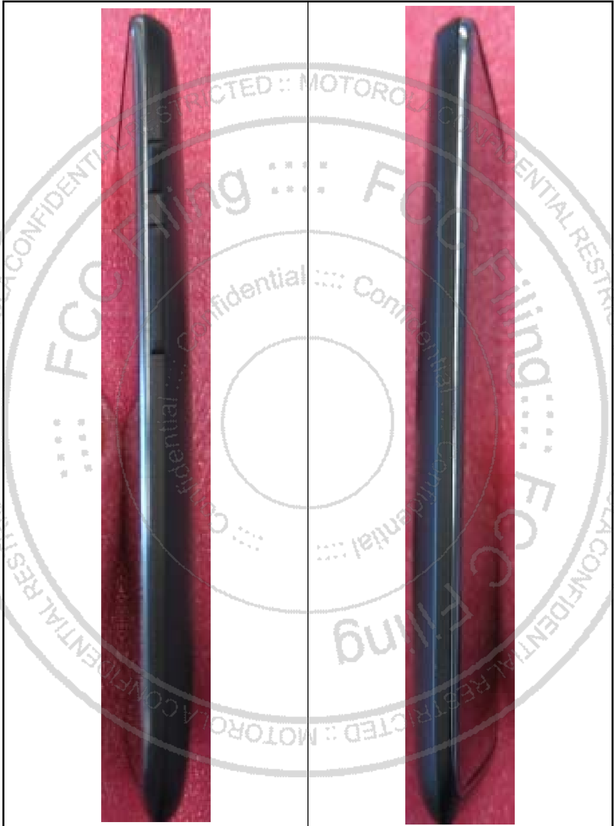
Figure 3-3. Button Side of device