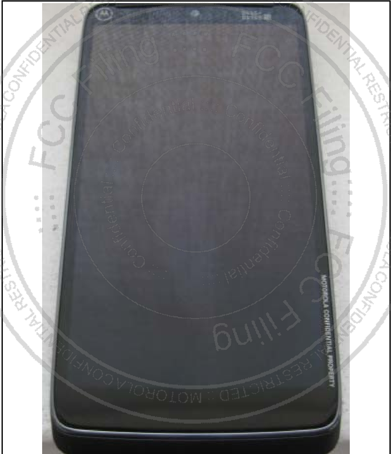
Figure 3-1. Front of device

The radio product colors, housings/bezels may vary, but only consistent with the requirements of FCC Class I Permissive Change rules and guidance (47 CFR 2.1043 and KDB 178919 D01).