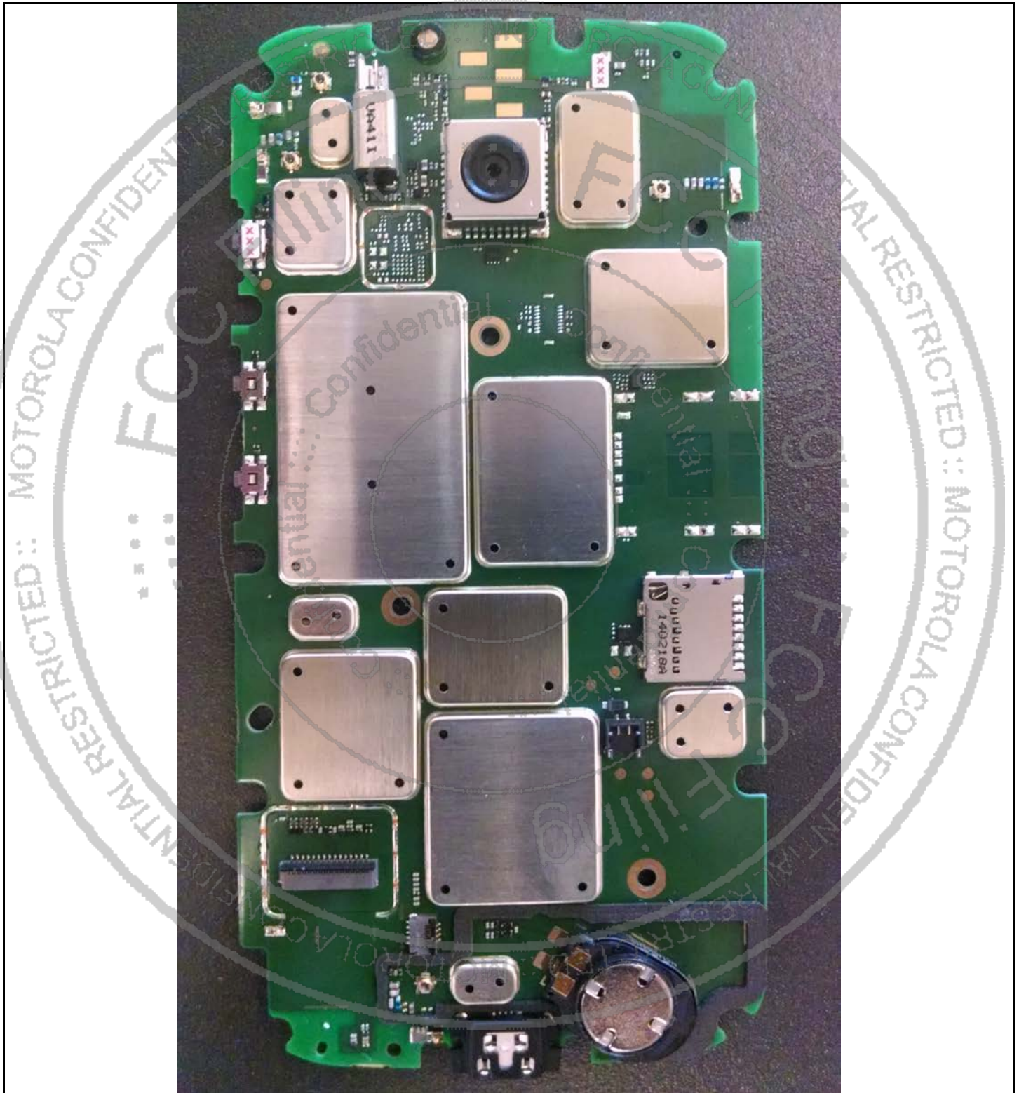
Photograph 9-1: Front side view of the device's PC Board, Shields in place.