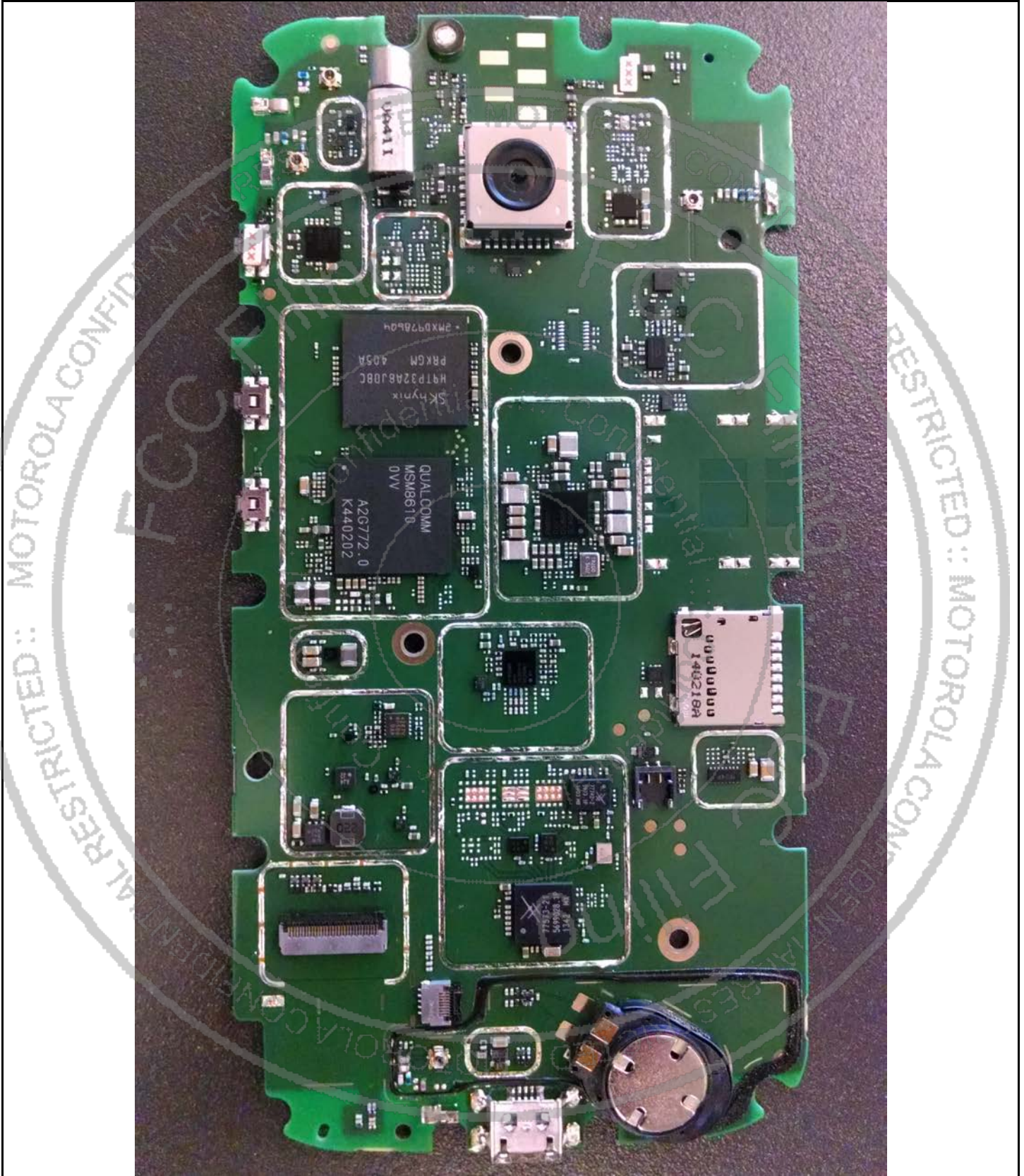
Photograph 9-3: Front side view of the device's PC Board, Shields Removed.