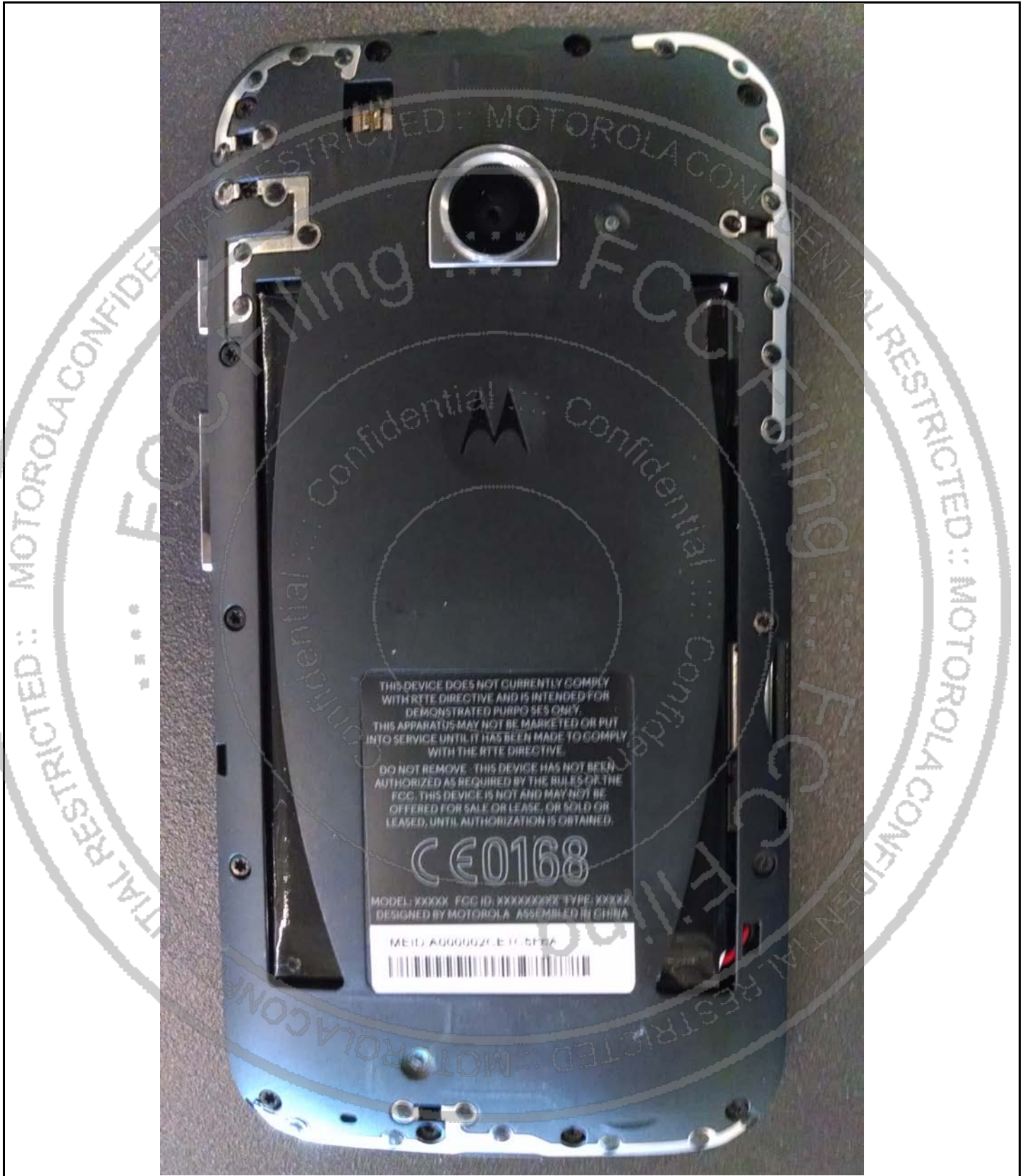
Photograph 9-4: Interior Housing View.