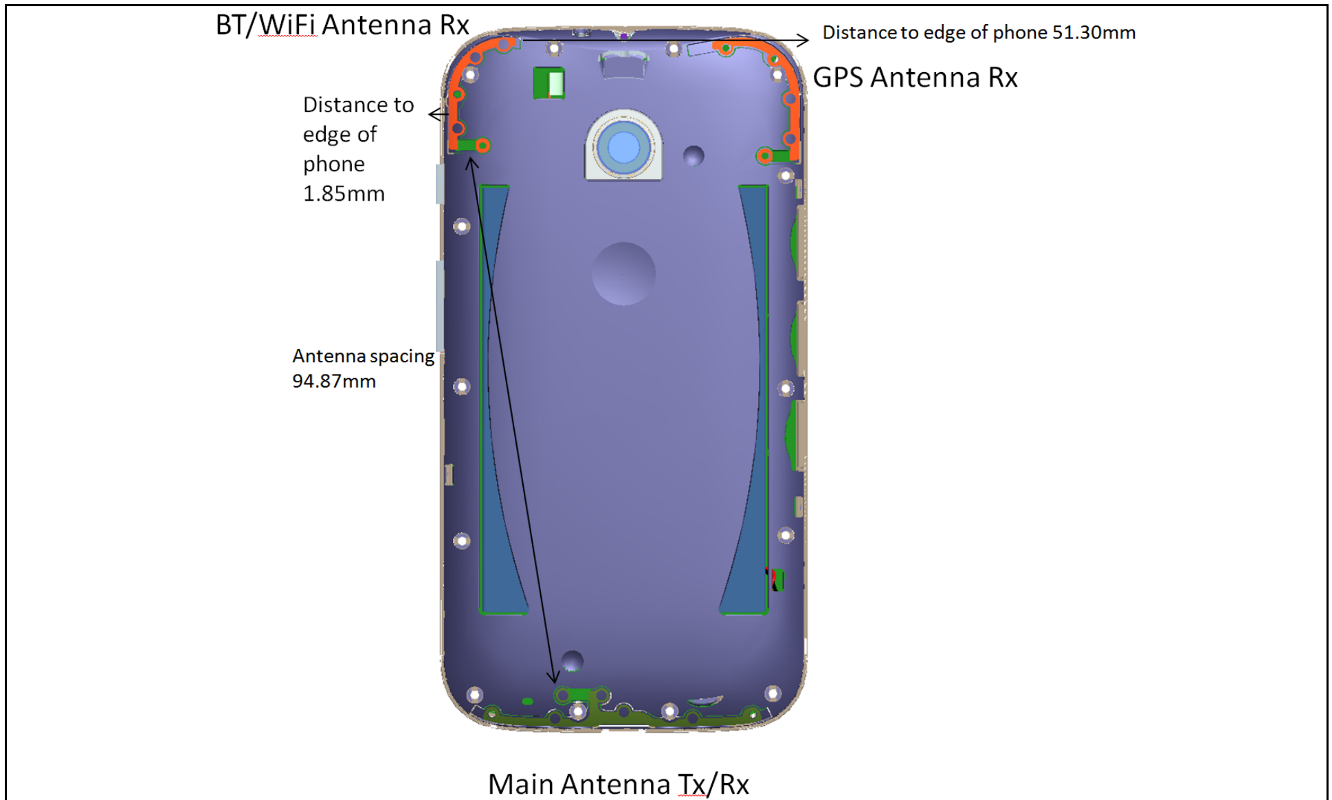
Photograph 9-4: Antenna Locations and Spacings.