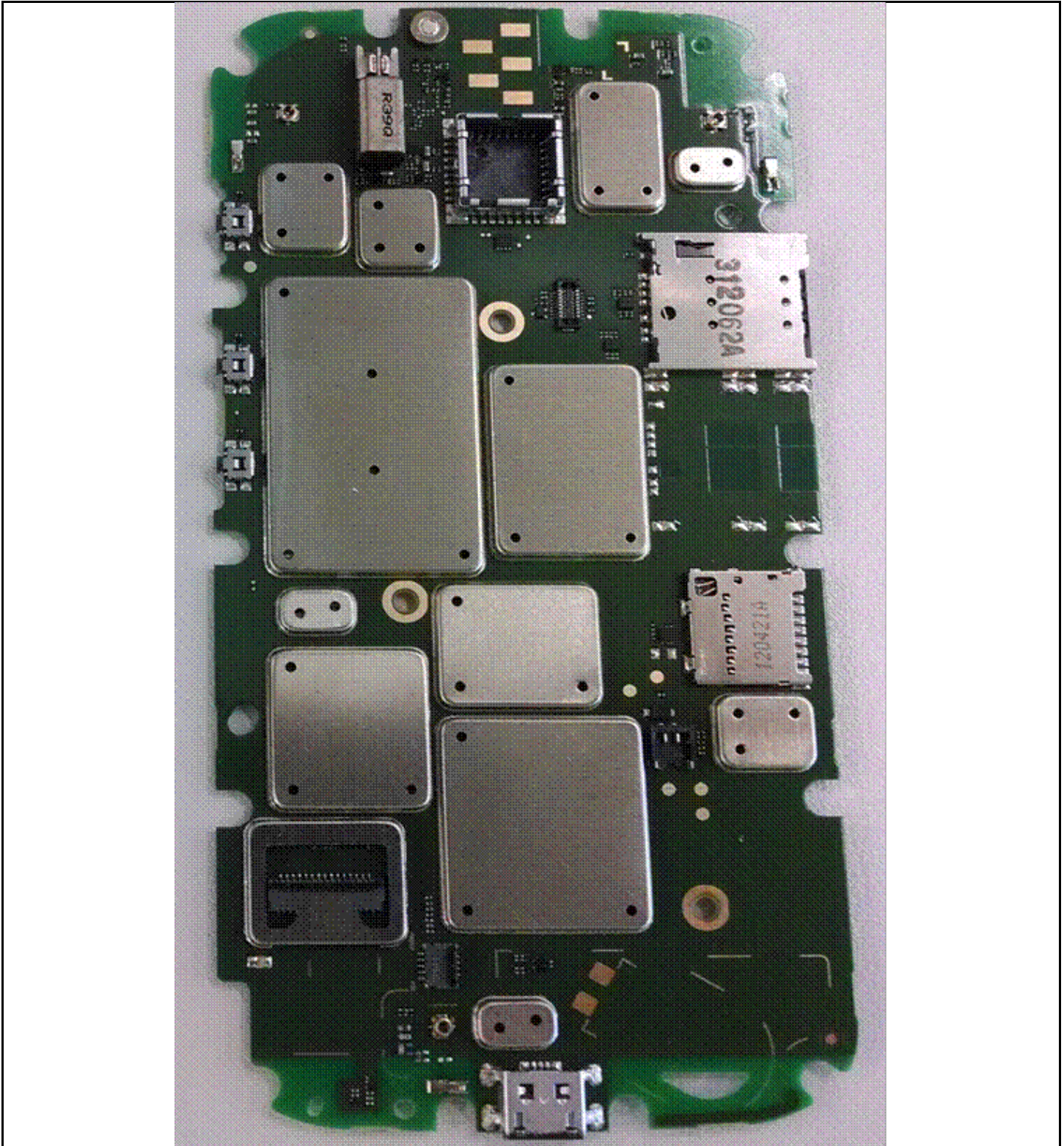
Photograph 9-1: Component Side view of the device's PC Board, Shields in place.