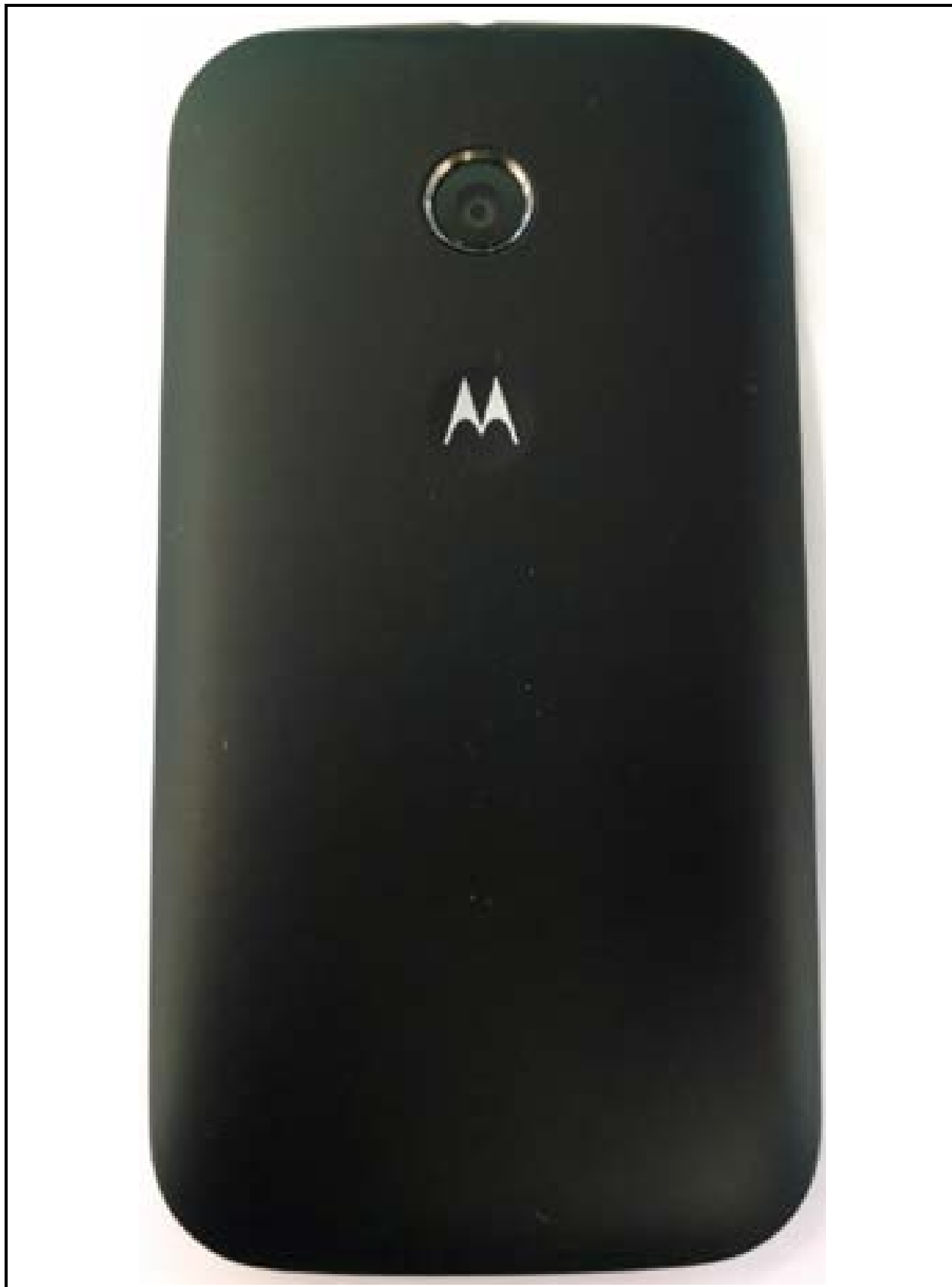
Figure 3-2. Back of device