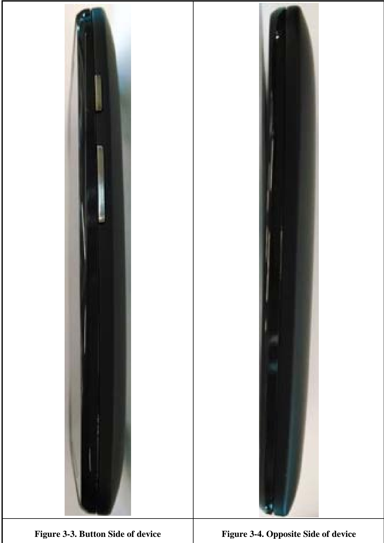
Figure 3-3. Button Side of device