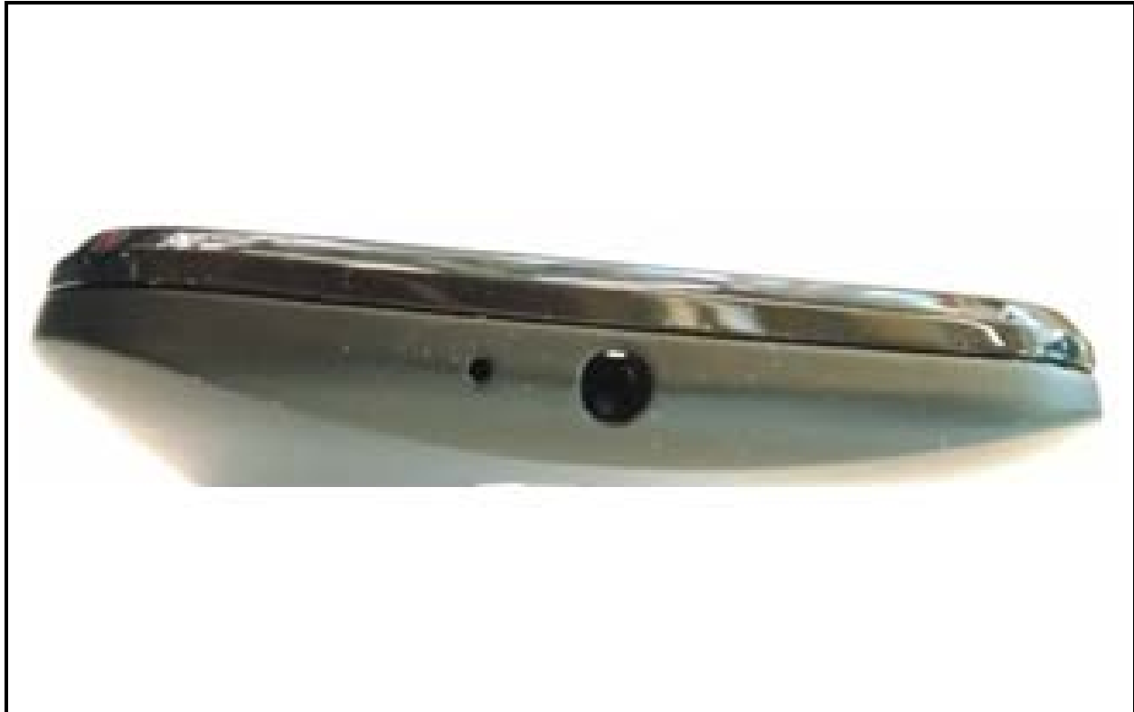
Figure 3-5. Top of radio