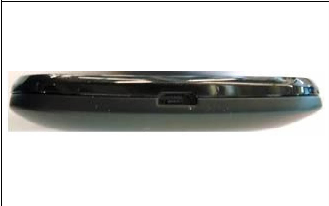
Figure 3-6. Bottom of radio