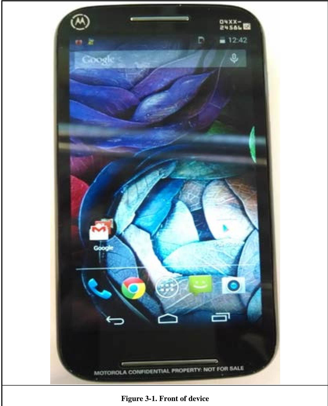
Figure 3-1. Front of device

The radio product colors, housings/bezels may vary, but only consistent with the requirements of FCC Class I Permissive Change rules and guidance (47 CFR 2.1043 and KDB 178919 D01).