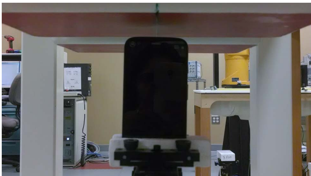
Figure 9: Mobile Hotspot Position, Short Edge of Phone facing Phantom (10 mm separation)