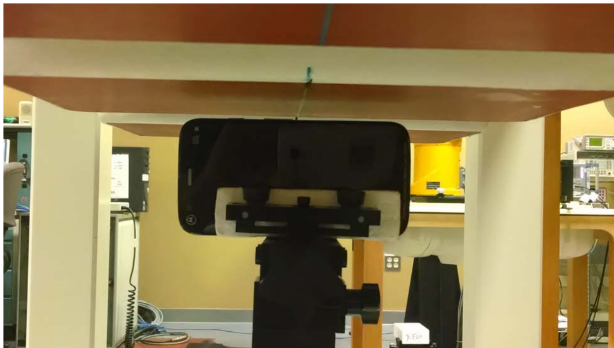
Figure 8: Mobile Hotspot Position, Long Edge of Phone facing Phantom (10 mm separation)