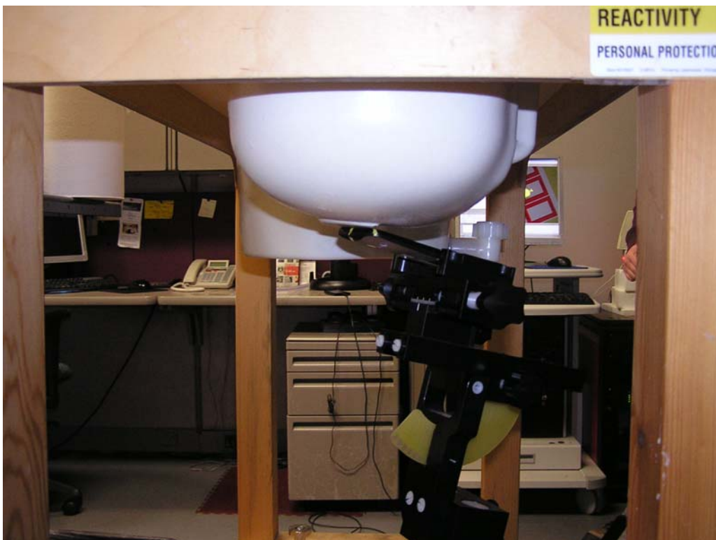
Figure 5: Tilt Position, Top of Head of Phantom