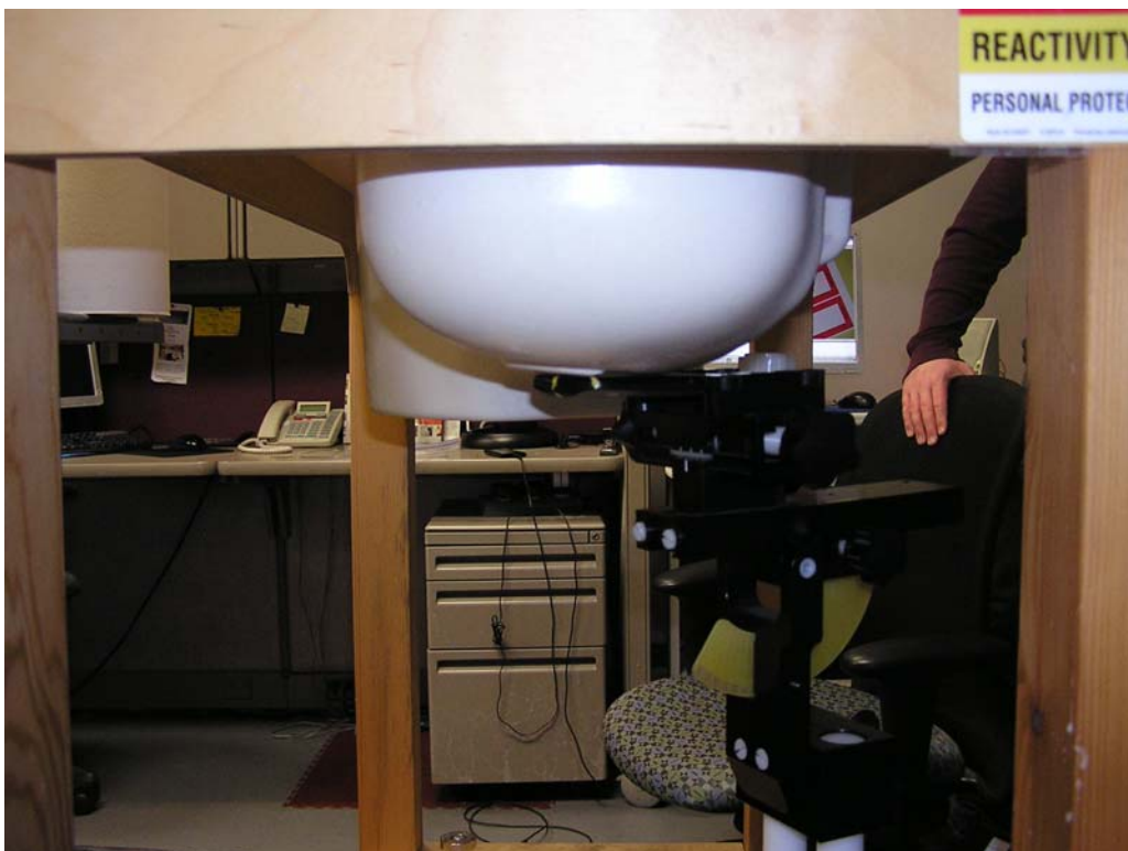
Figure 3: Cheek Position, Top of Head of Phantom