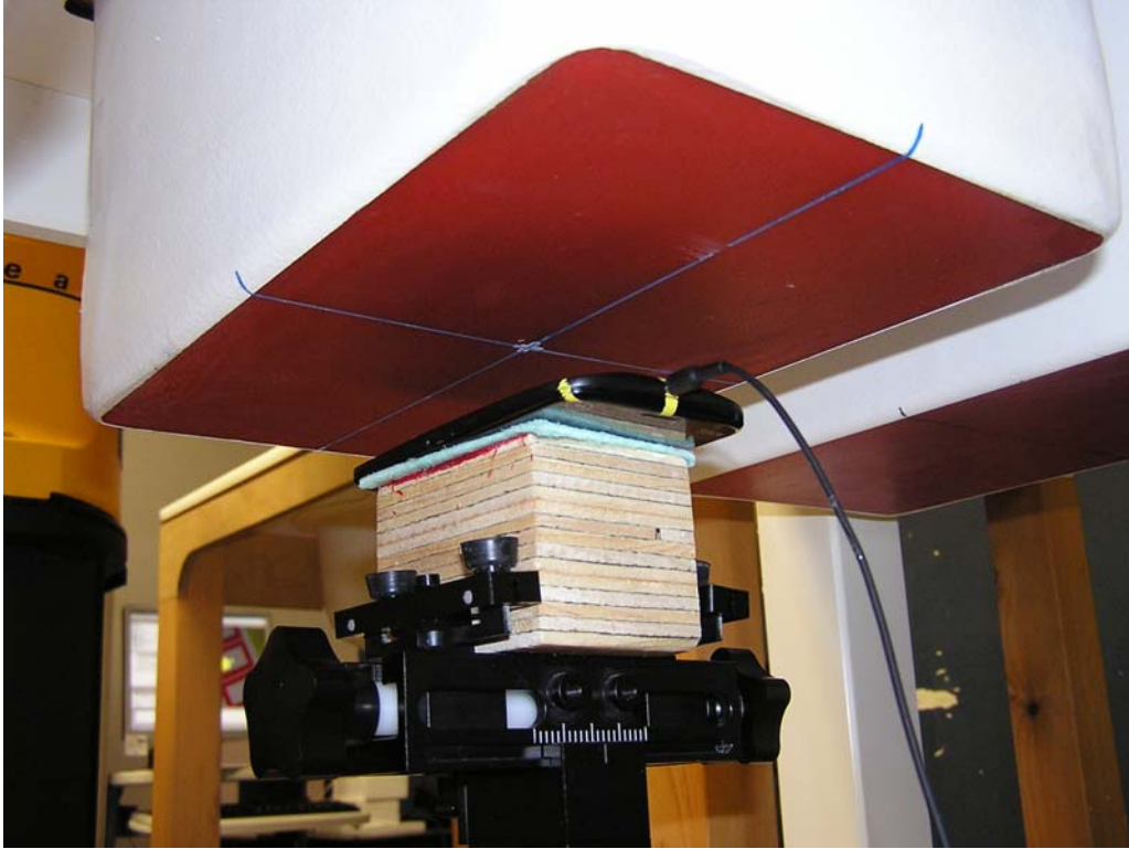
Figure 7: Body Position (25 mm separation, with audio cable shown)