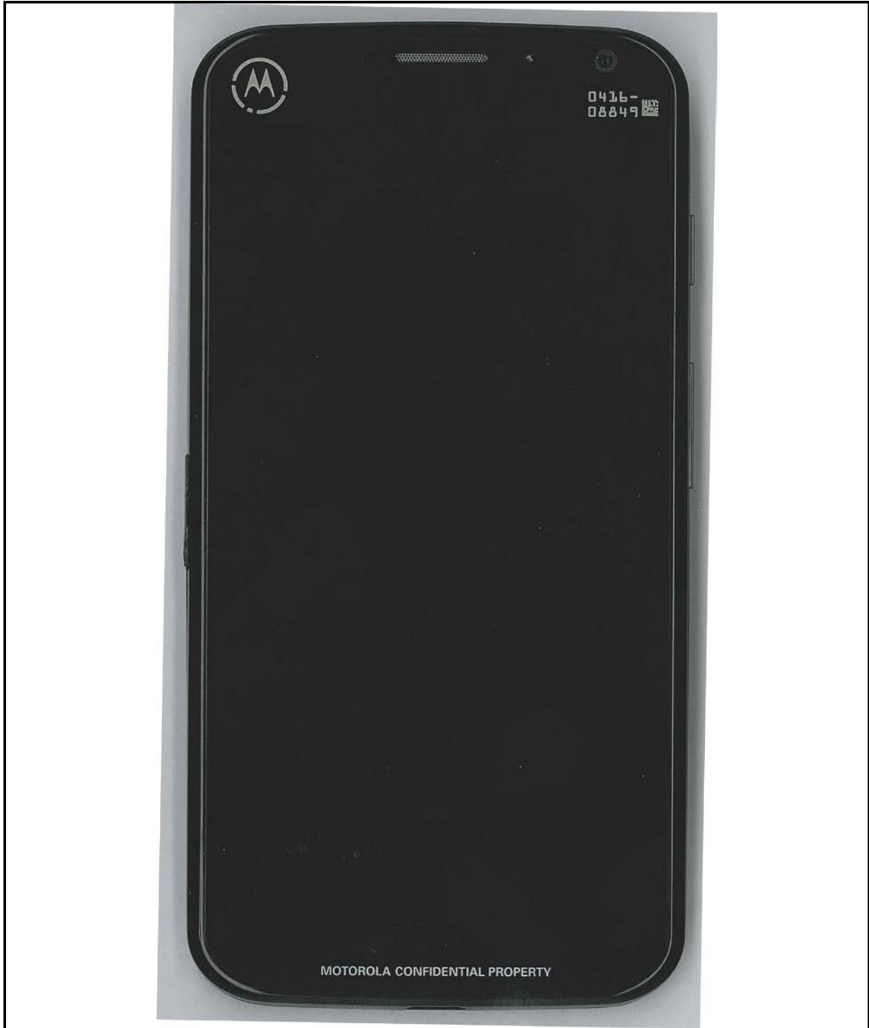
Figure 3-1. Front of device

The radio product colors, housings/bezels may vary, but only consistent with the requirements of FCC Class I Permissive Change rules and guidance (47 CFR 2.1043 and KDB 178919 D01).