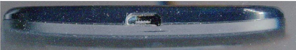
Figure 3-6. Bottom of radio