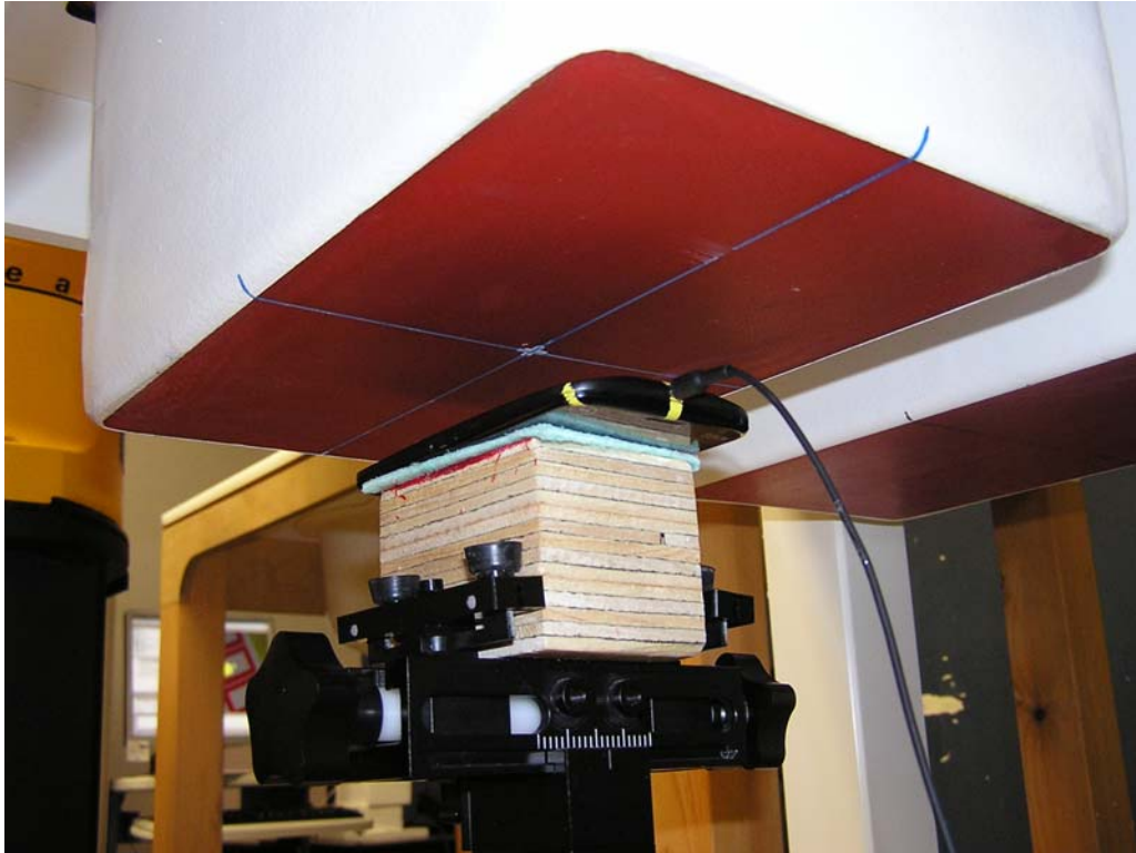
Figure 7: Body Position (25 mm separation, with audio cable shown)