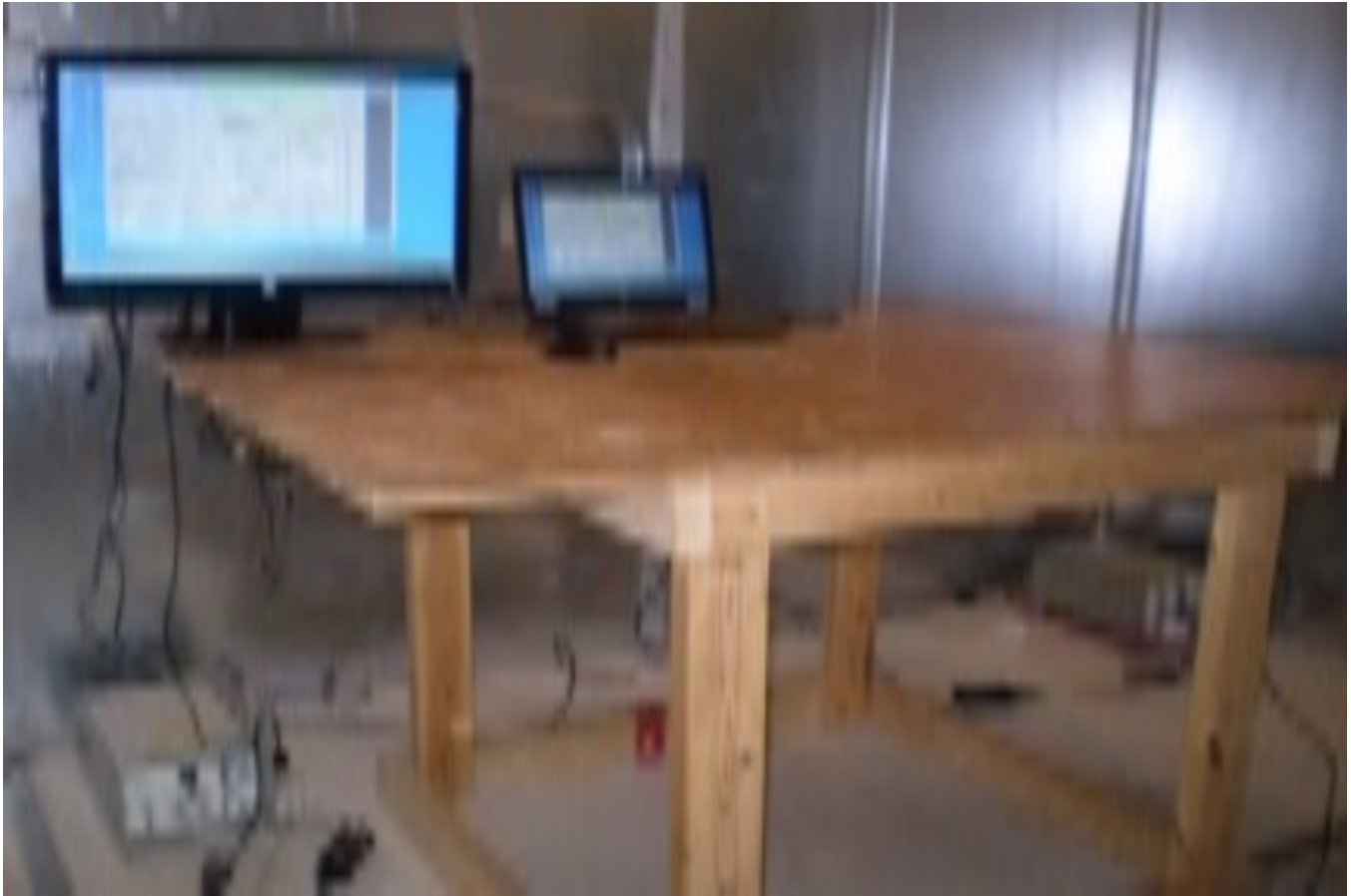
Figure 7c3-1: Test Configuration – AC Line (Part 15 Computing Device).