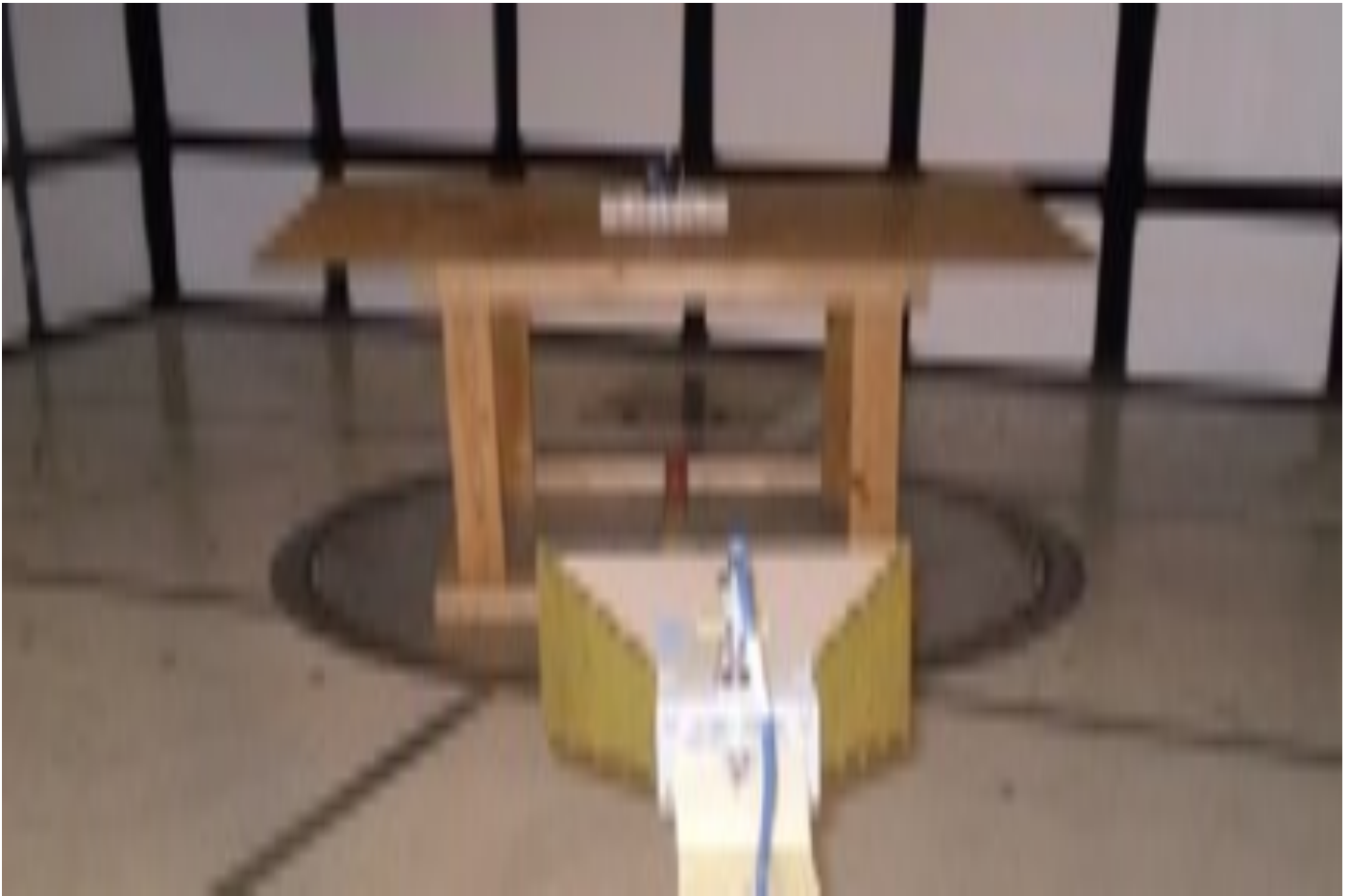
Figure 7c1-1: TX Radiated Emissions Configuration.