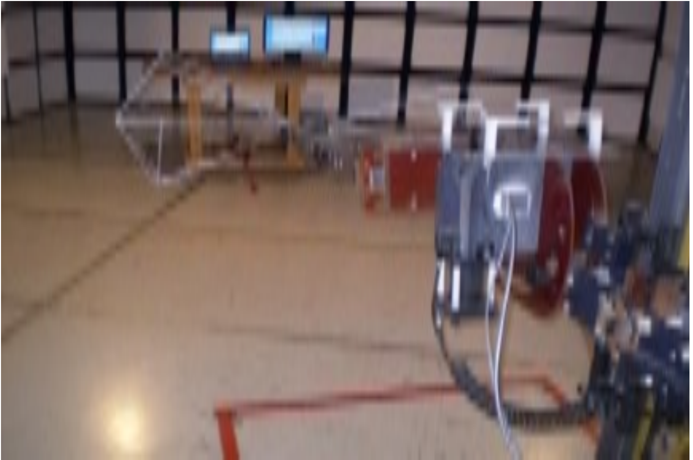
Figure 7c2-1: Spurious Radiations (Part 15 Computing Device).