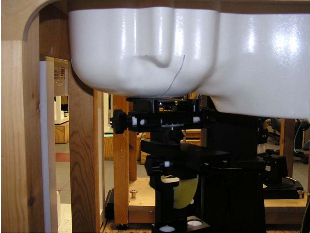
Figure 3: Cheek Position, Front of Head of Phantom