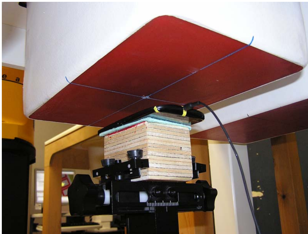
Figure 7: Body Position (25 mm separation, with audio cable shown)