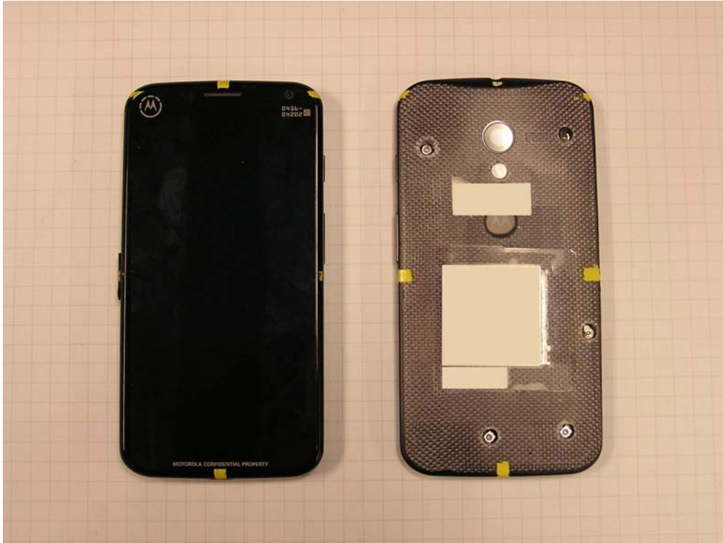
Figure 1: Phone Front and Back