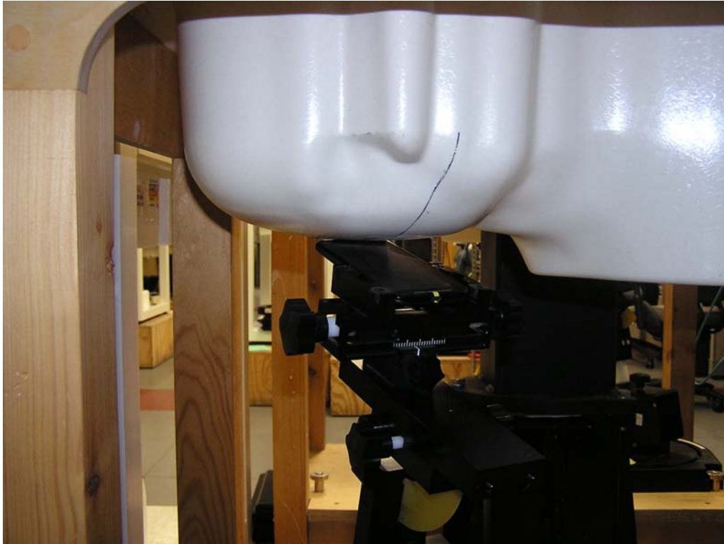
Figure 5: Tilt Position, Front of Head of Phantom