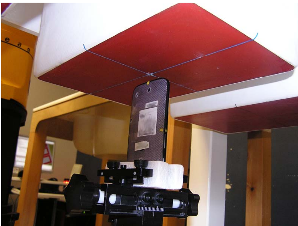
Figure 10: Mobile Hotspot Position, Bottom Edge of Phone facing Phantom (10 mm separation)