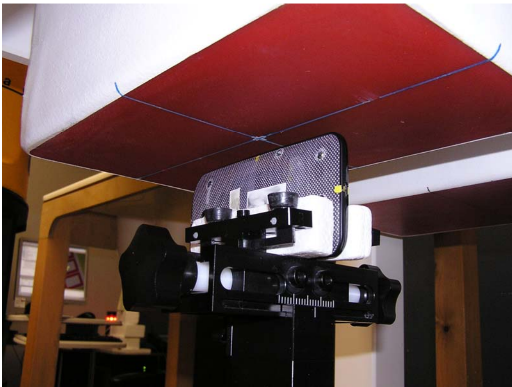
Figure 9: Mobile Hotspot Position, Right Edge of Phone facing Phantom (10 mm separation)