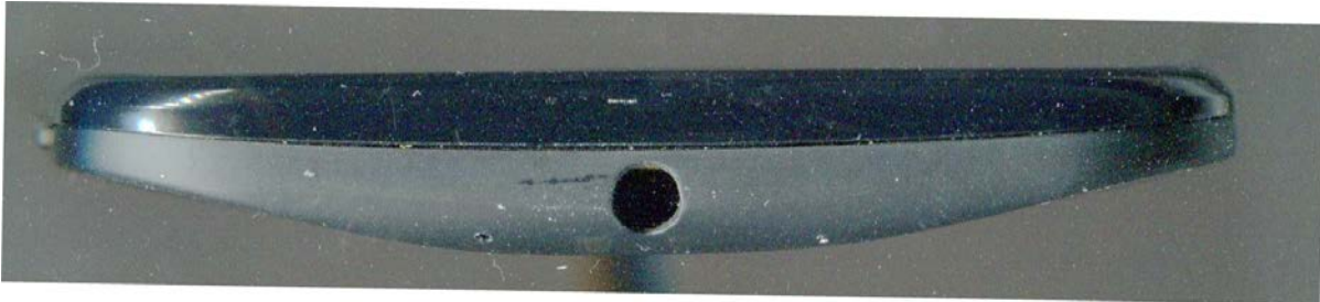
Figure 3-5. Top of radio