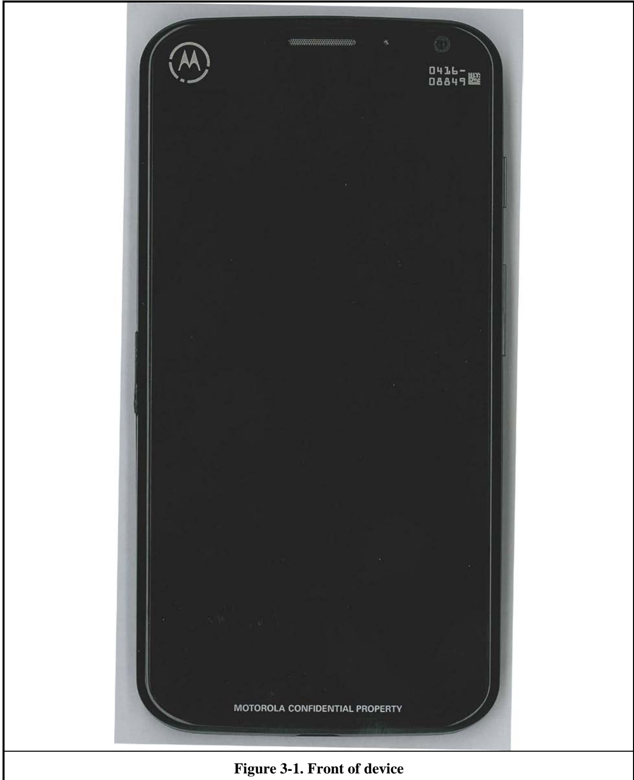
Figure 3-1. Front of device

The radio product colors, housings/bezels may vary, but only consistent with the requirements of FCC Class I Permissive Change rules and guidance (47 CFR 2.1043 and KDB 178919 D01).