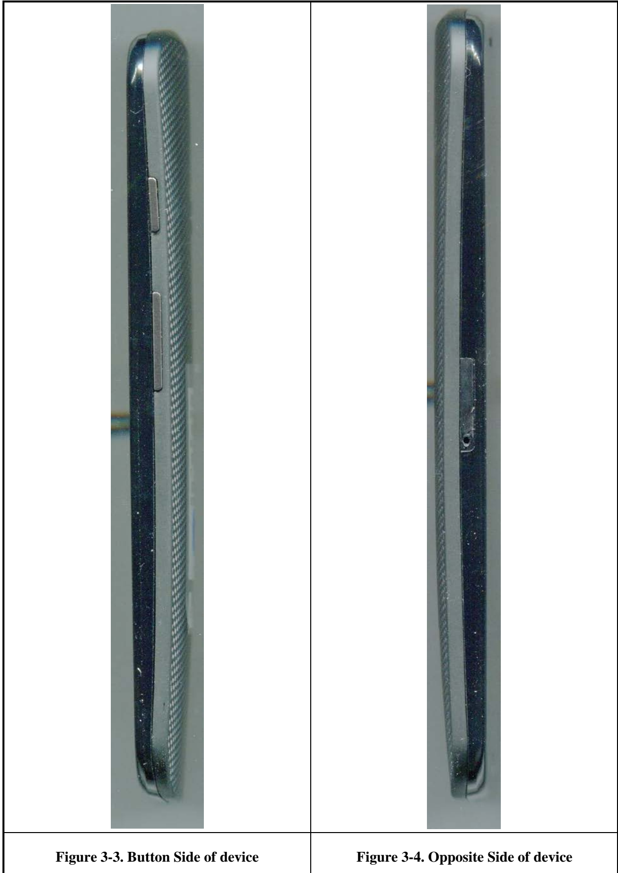
Figure 3-3. Button Side of device