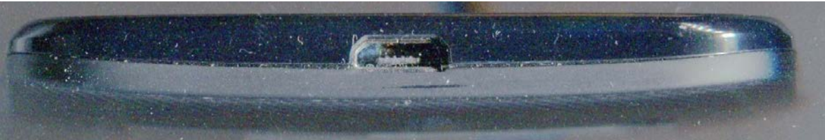
Figure 3-6. Bottom of radio