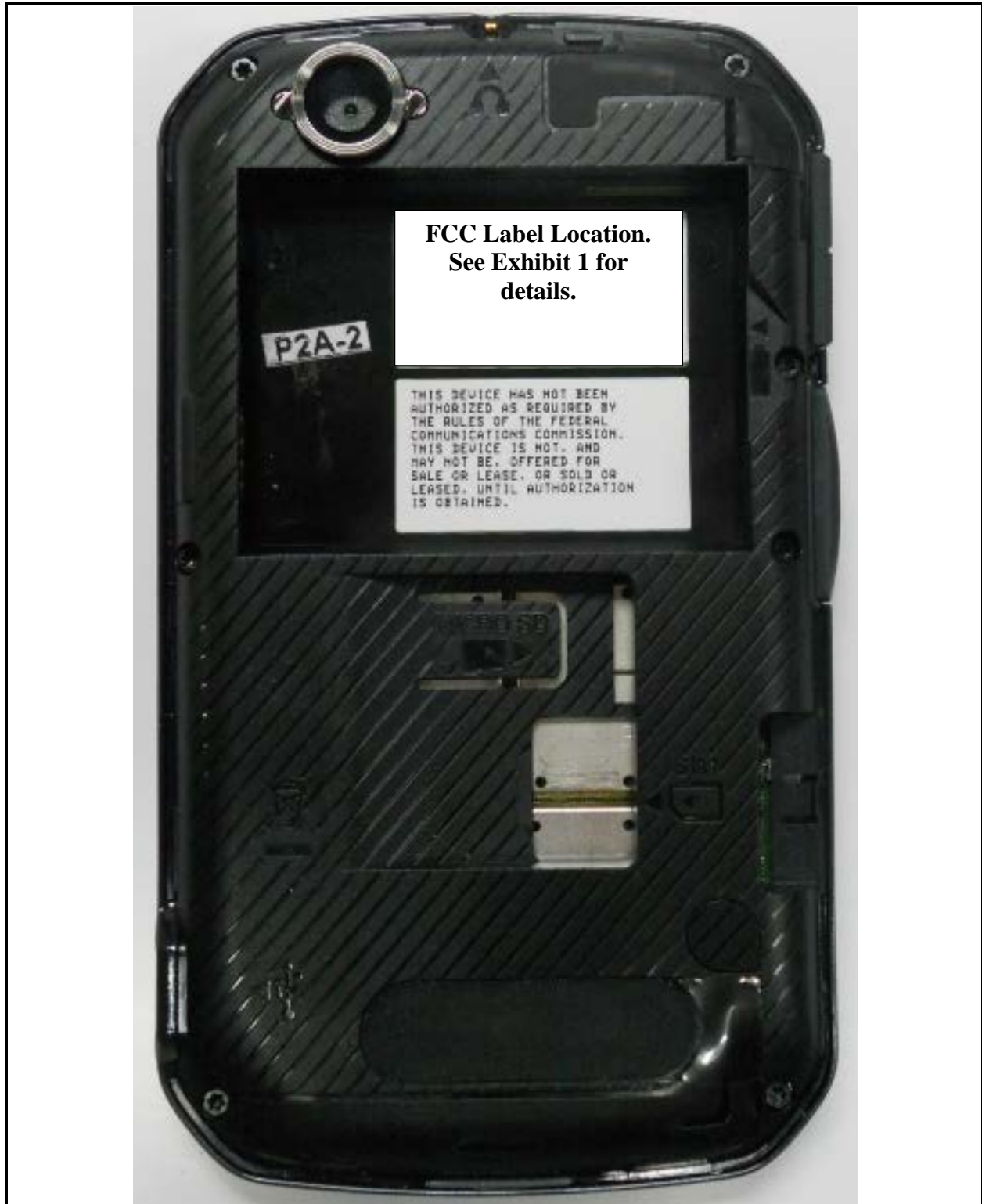
Figure 3-7. Interior Compartment of radio