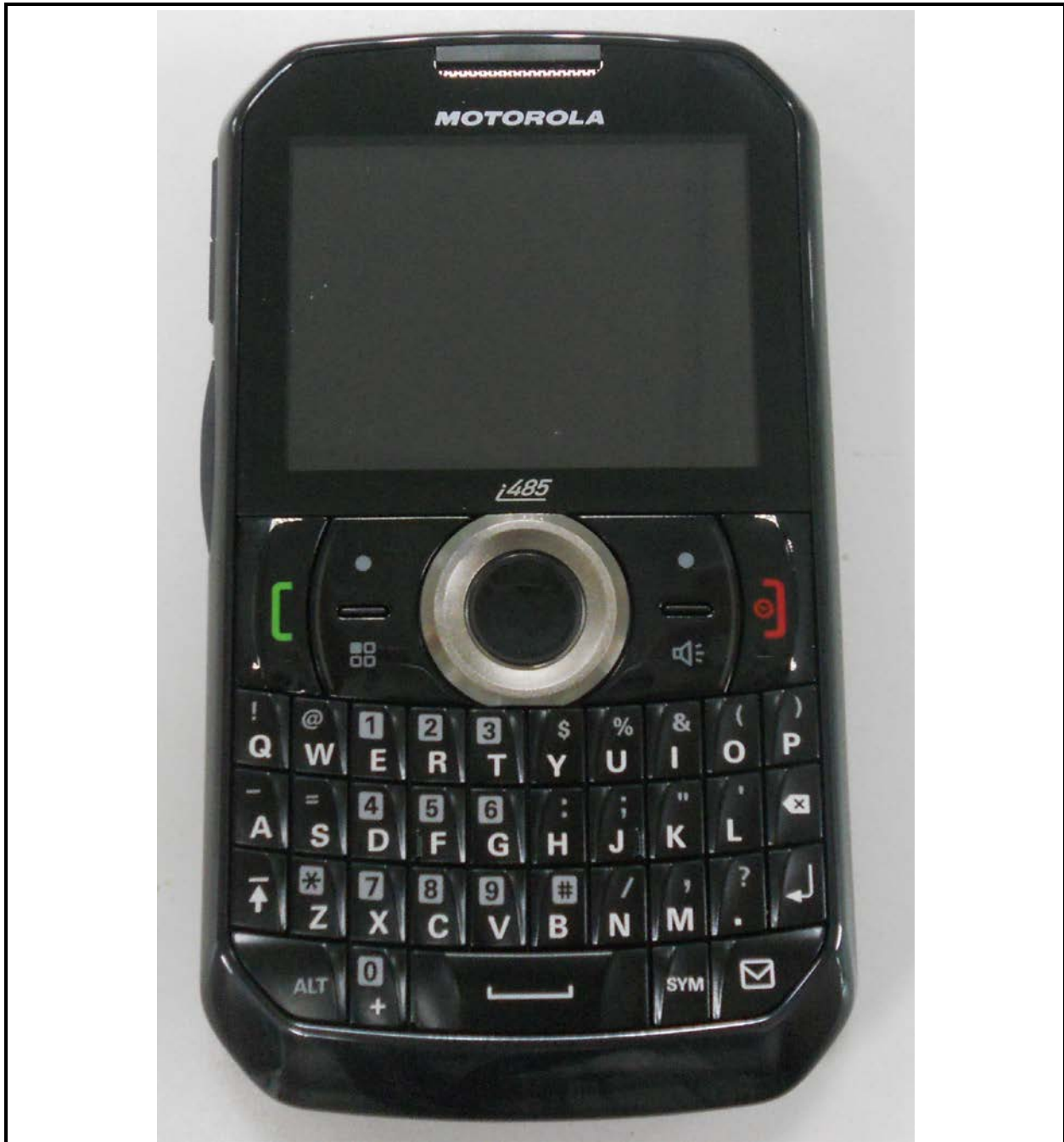
Figure 3-1. Front of device

The radio product colors, housings/bezels may vary, but only consistent with the requirements of FCC Class I Permissive Change rules and guidance (47 CFR 2.1043 and KDB 178919 D01).