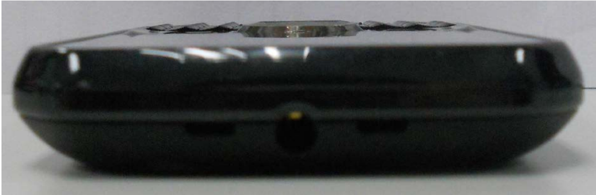
Figure 3-5. Top of radio