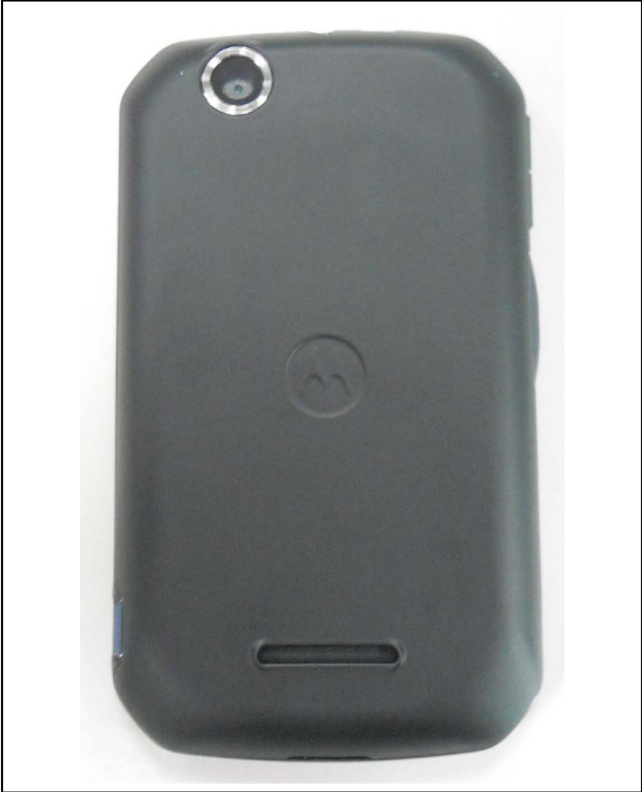
Figure 3-2. Back of device