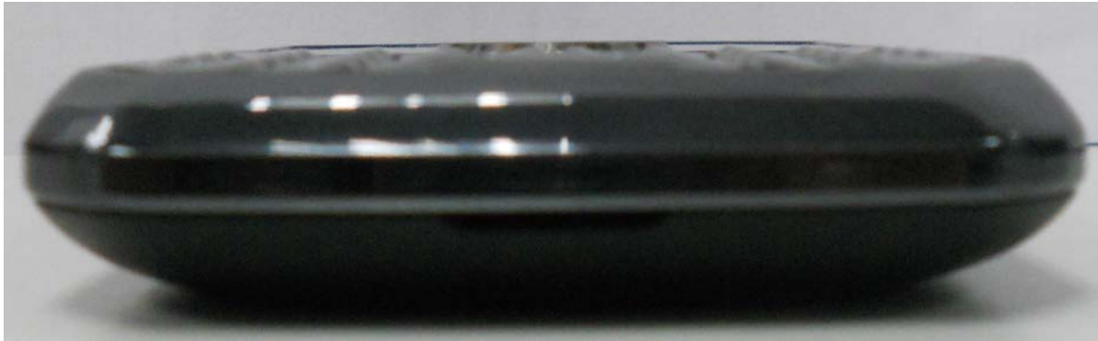
Figure 3-6. Bottom of radio