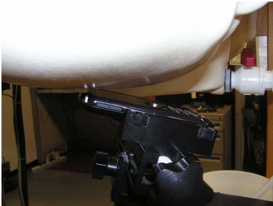
Figure 5: Tilt Position