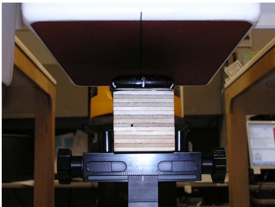
Figure 7: Body Position (25 mm separation)