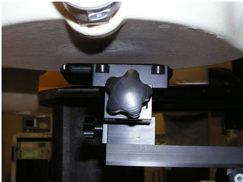
Figure 6: Push to Talk position