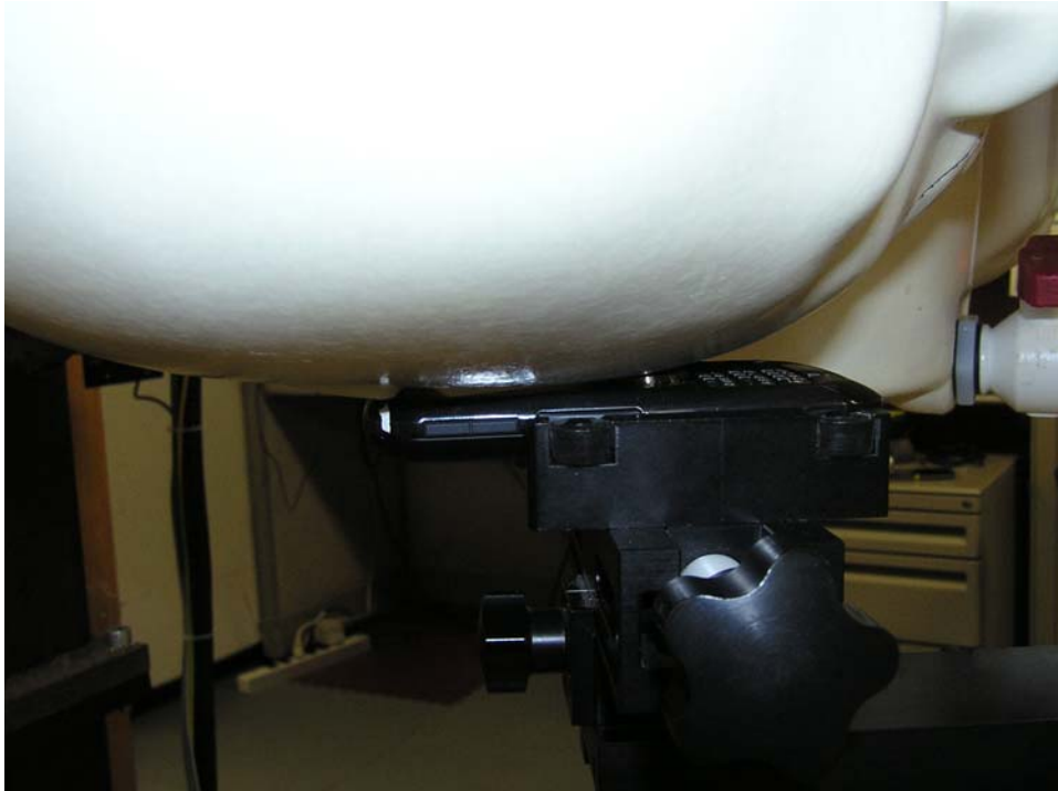
Figure 4: Cheek Position