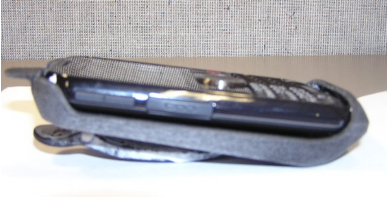
Figure 2: Back of the Phone in the Holster