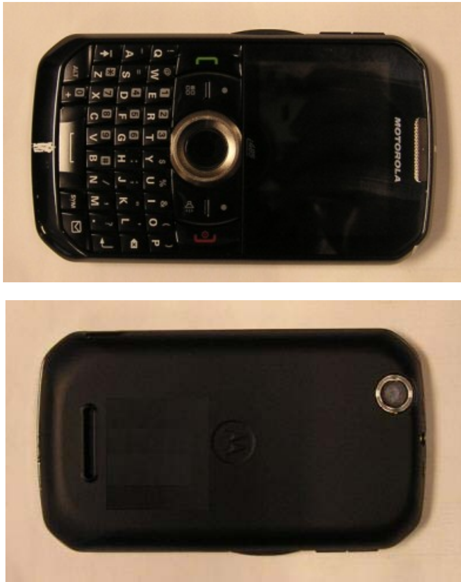
Figure 1: Phone Front and Back