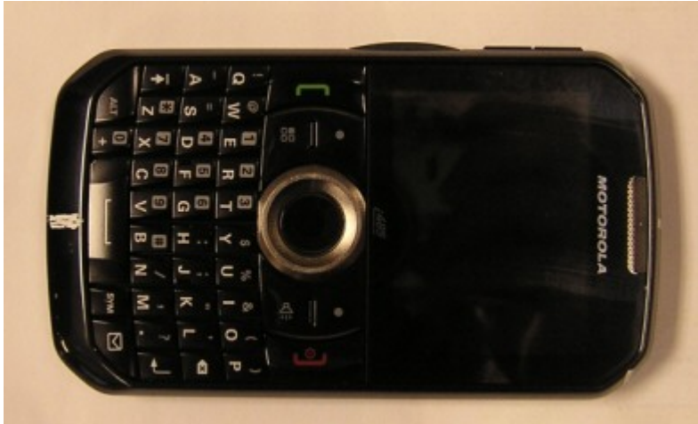
Figure 1. Phone Closed