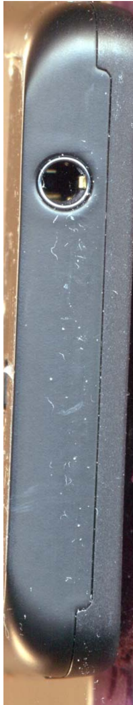
Figure 3-5. Top of radio