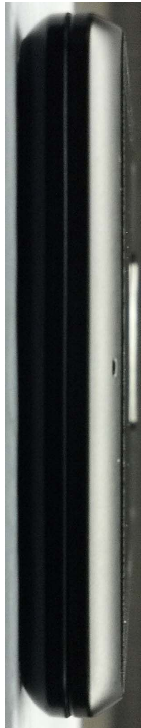
Figure 3-6. Bottom of radio