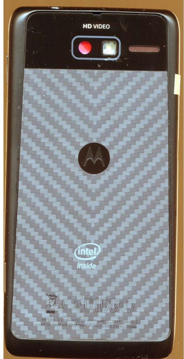
Figure 3-2. Back of device