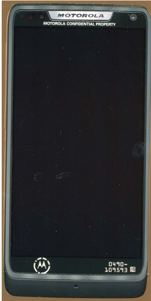
Figure 3-1. Front of device

The radio product colors, housings/bezels may vary, but only consistent with the requirements of FCC Class I Permissive Change rules and guidance (47 CFR 2.1043 and KDB 178919 D01).