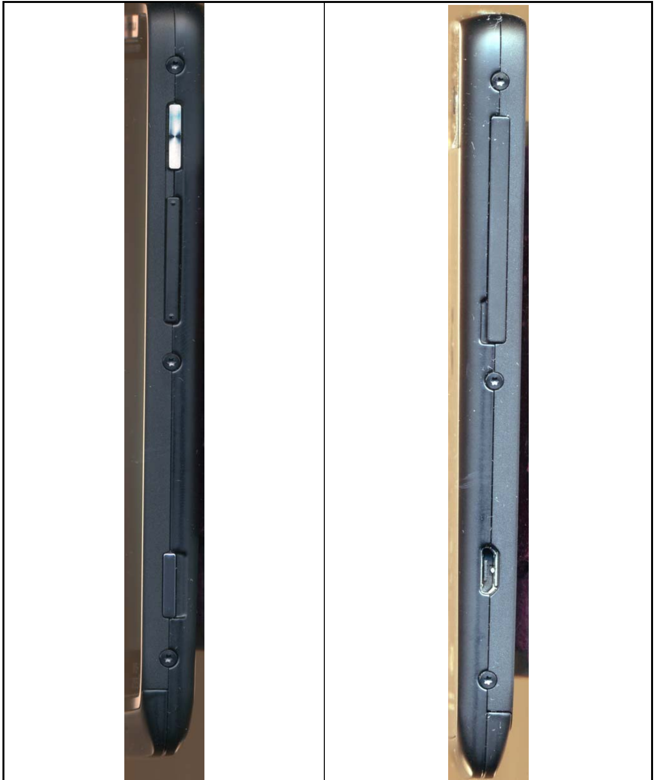
Figure 3-3. Button Side of device