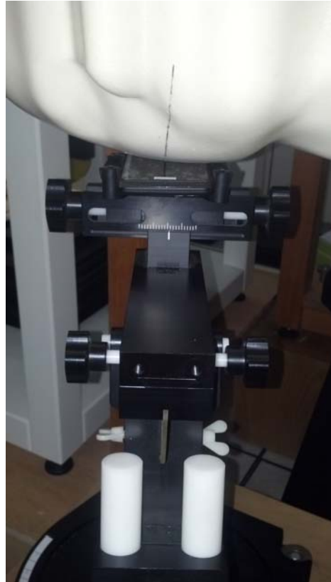
Figure 3: Cheek Position, Front of Head of Phantom