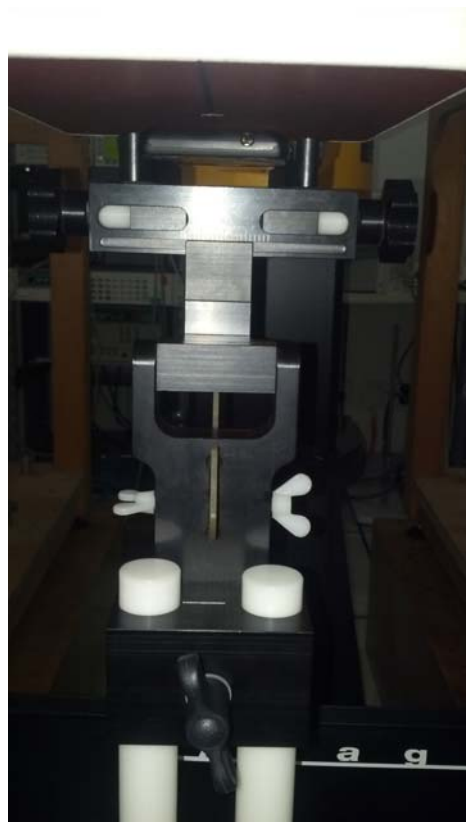
Figure 8: Mobile Hotspot Position, Back of Phone facing Phantom (10 mm separation)