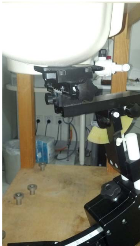
Figure 4: Cheek Position, Top of Head of Phantom