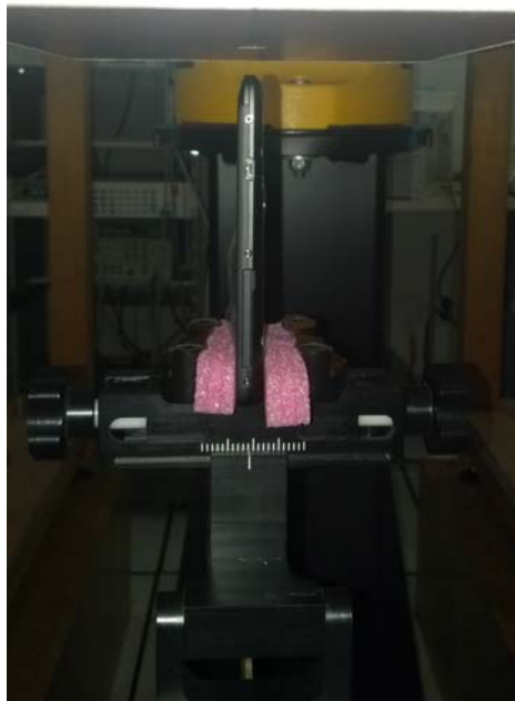
Figure 10: Mobile Hotspot Position, Short Edge of Phone facing Phantom (10 mm separation)