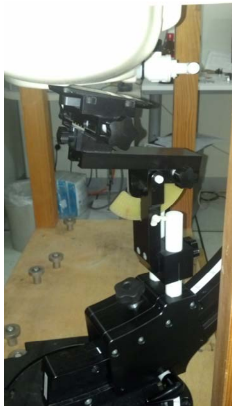
Figure 6: Tilt Position, Top of Head of Phantom