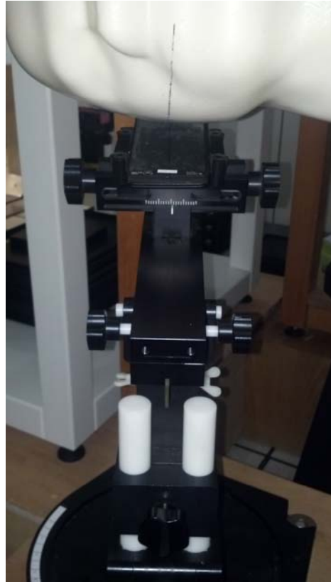
Figure 5: Tilt Position, Front of Head of Phantom