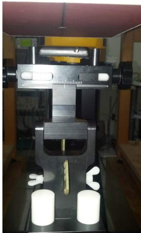
Figure 7: Body Position (25 mm separation)