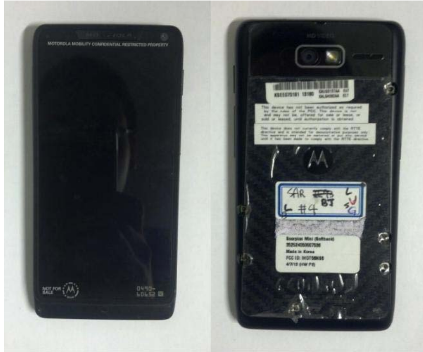
Figure 1: Phone Front and Back