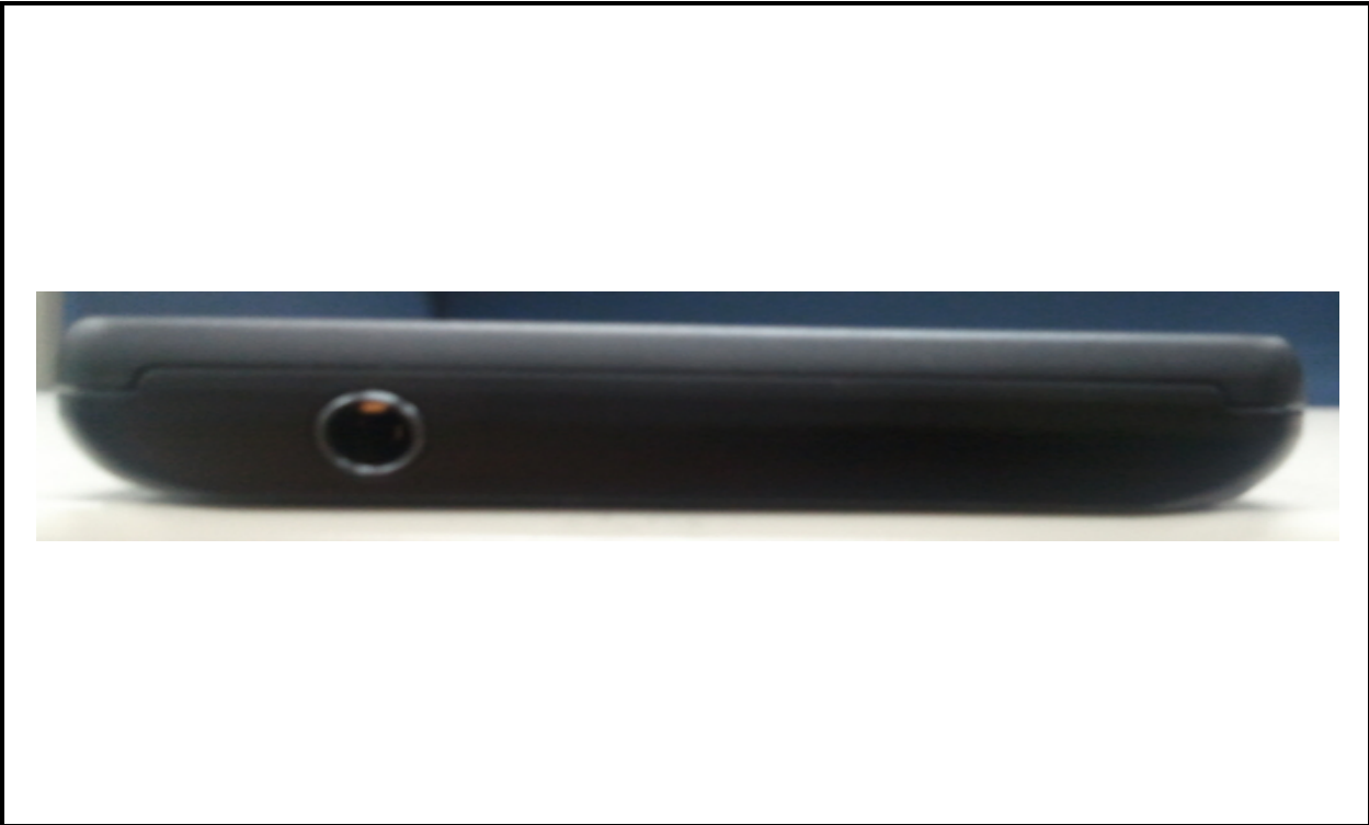
Figure 3-5. Top of radio