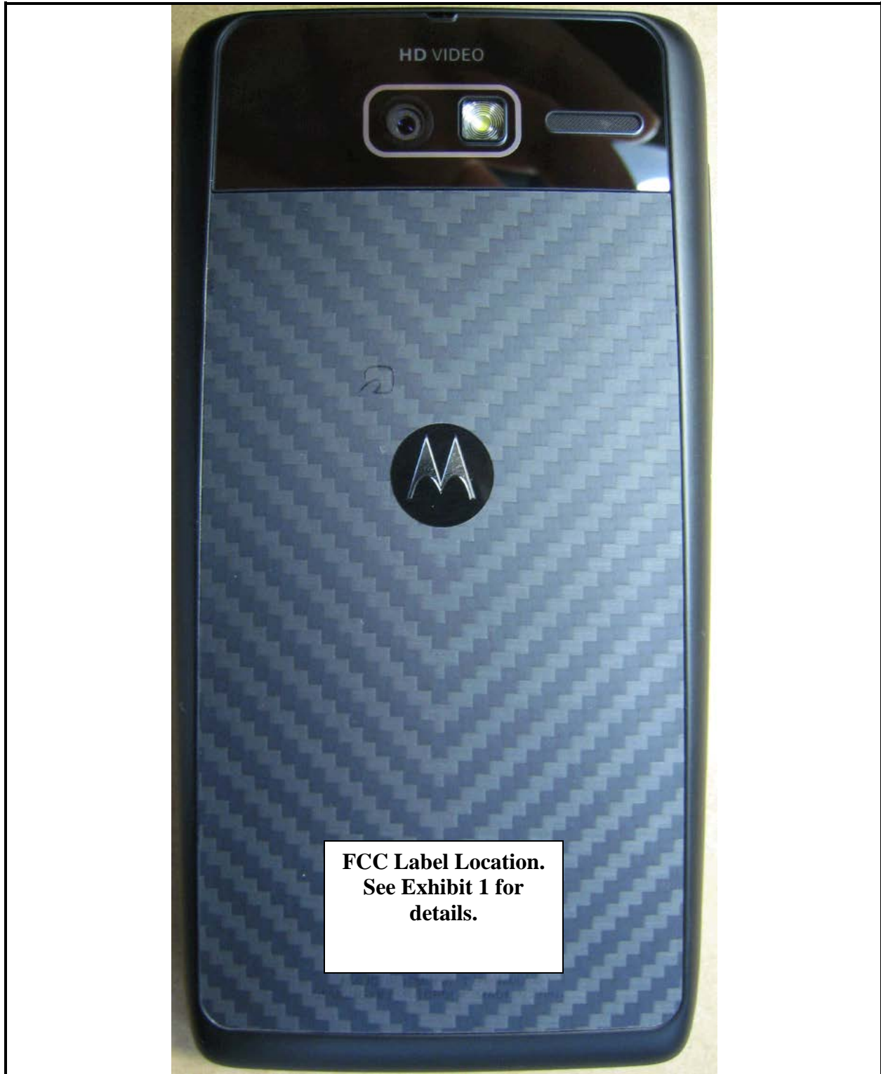
Figure 3-7. Interior Compartment of radio