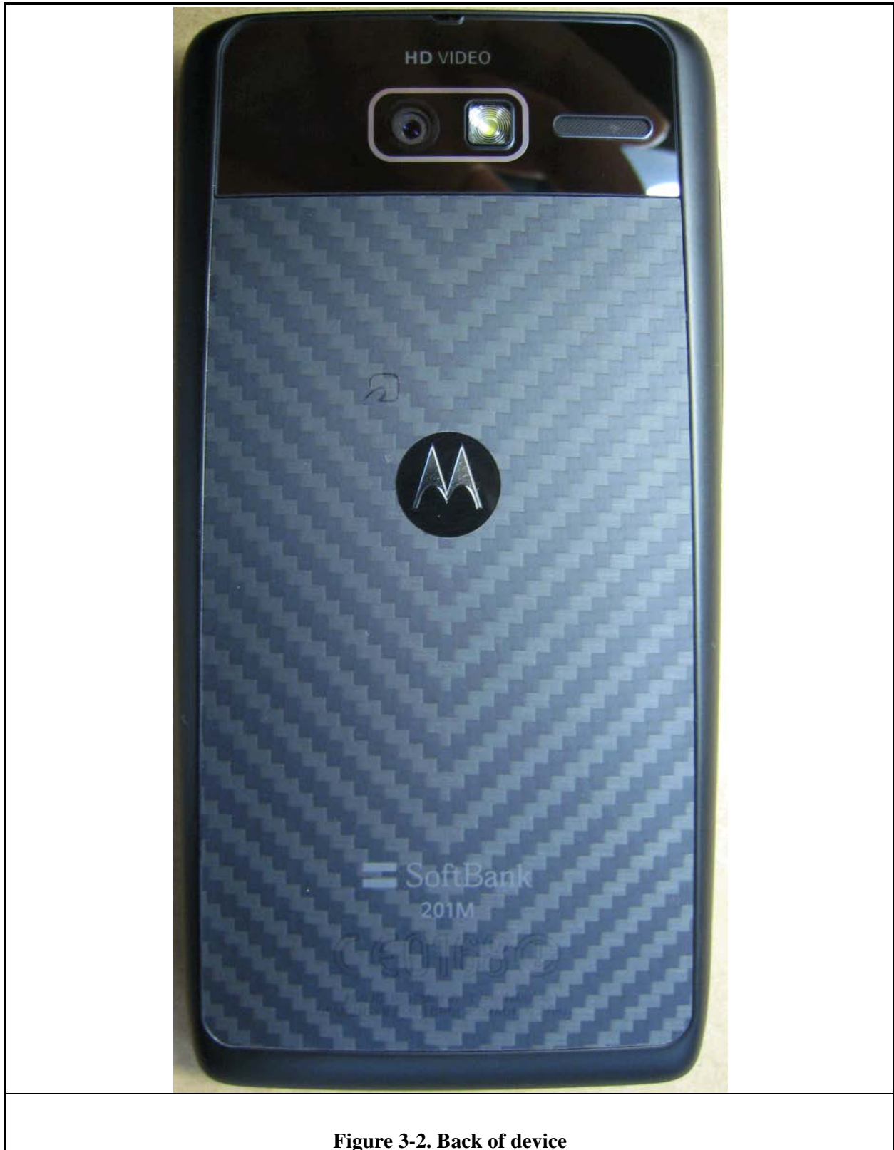
Figure 3-2. Back of device