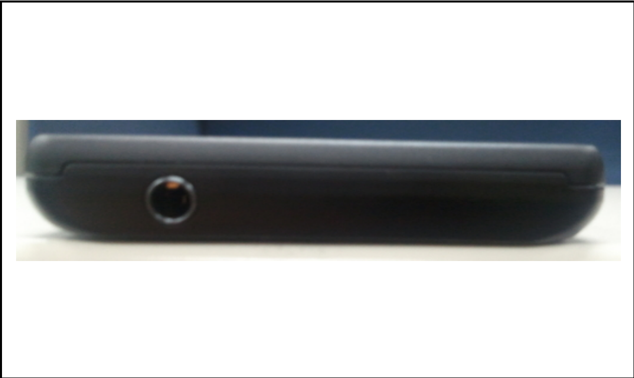
Figure 3-5. Top of radio