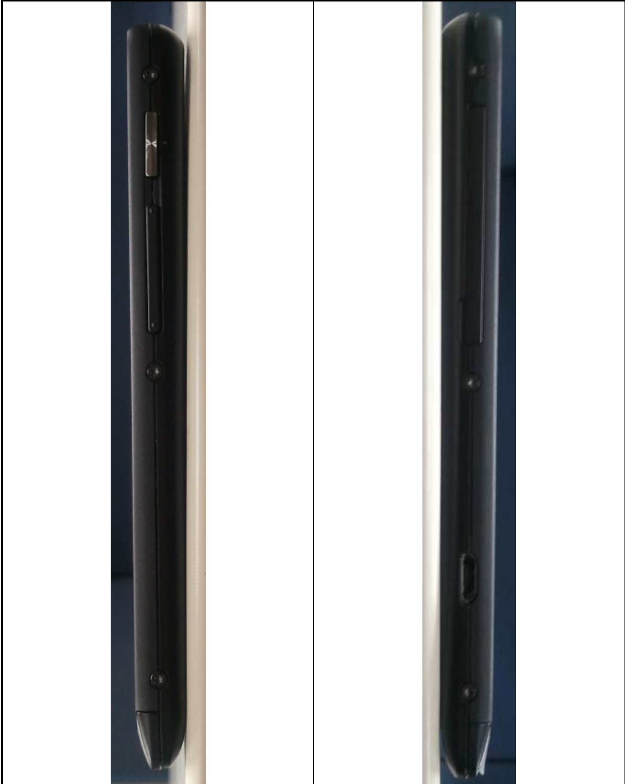
Figure 3-3. Button Side (Right) of device