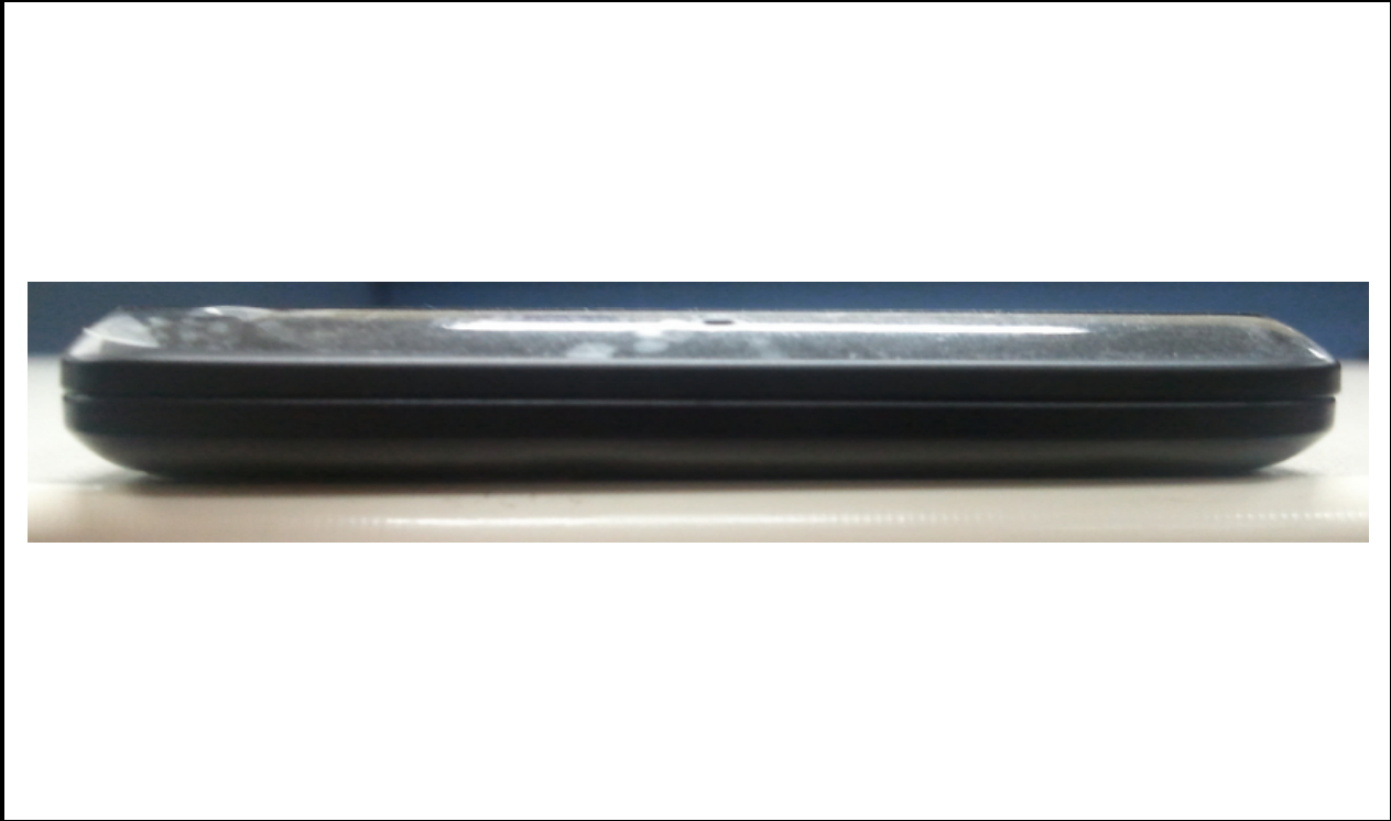
Figure 3-6. Bottom of radio