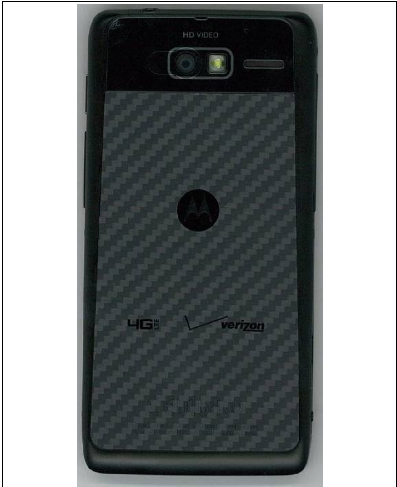
Figure 3-2. Back of device