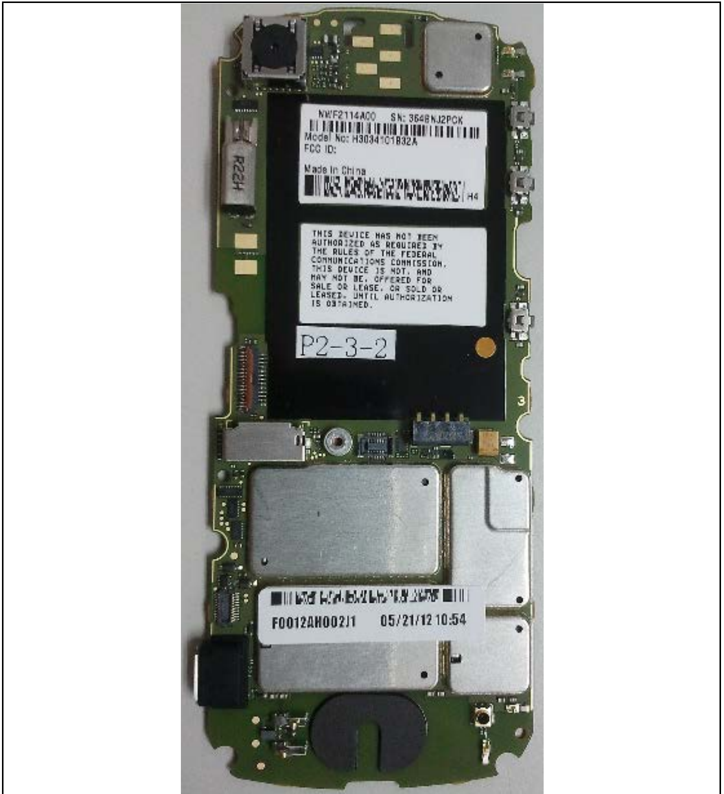
Photograph 9-2: Back side view of the device's PC Board, Shields in place.