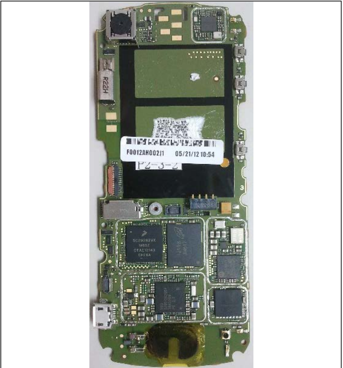
Photograph 9-3: Rear side view of the device’s PC Board, Shields Removed.