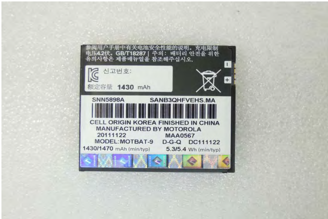
Adapter – (Model No.: FMP5504A, Supplier: Motorola)