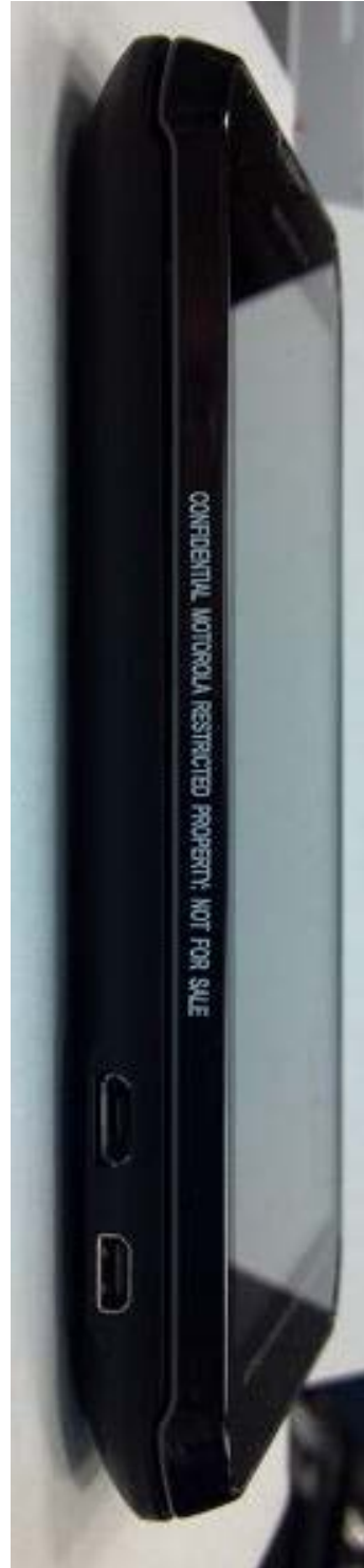
Figure 3-6. Opposite Side of device