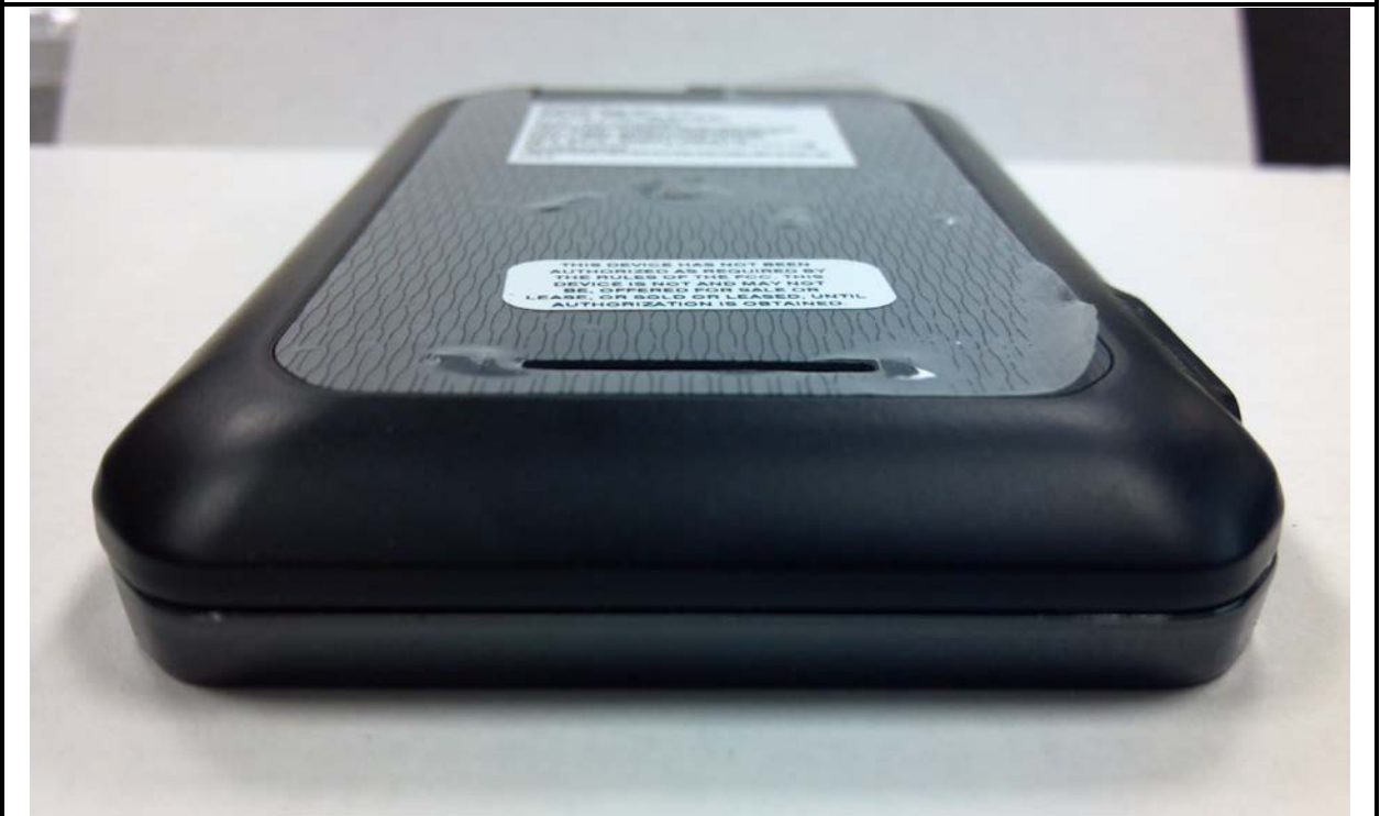
Figure 3-8. Bottom of Radio