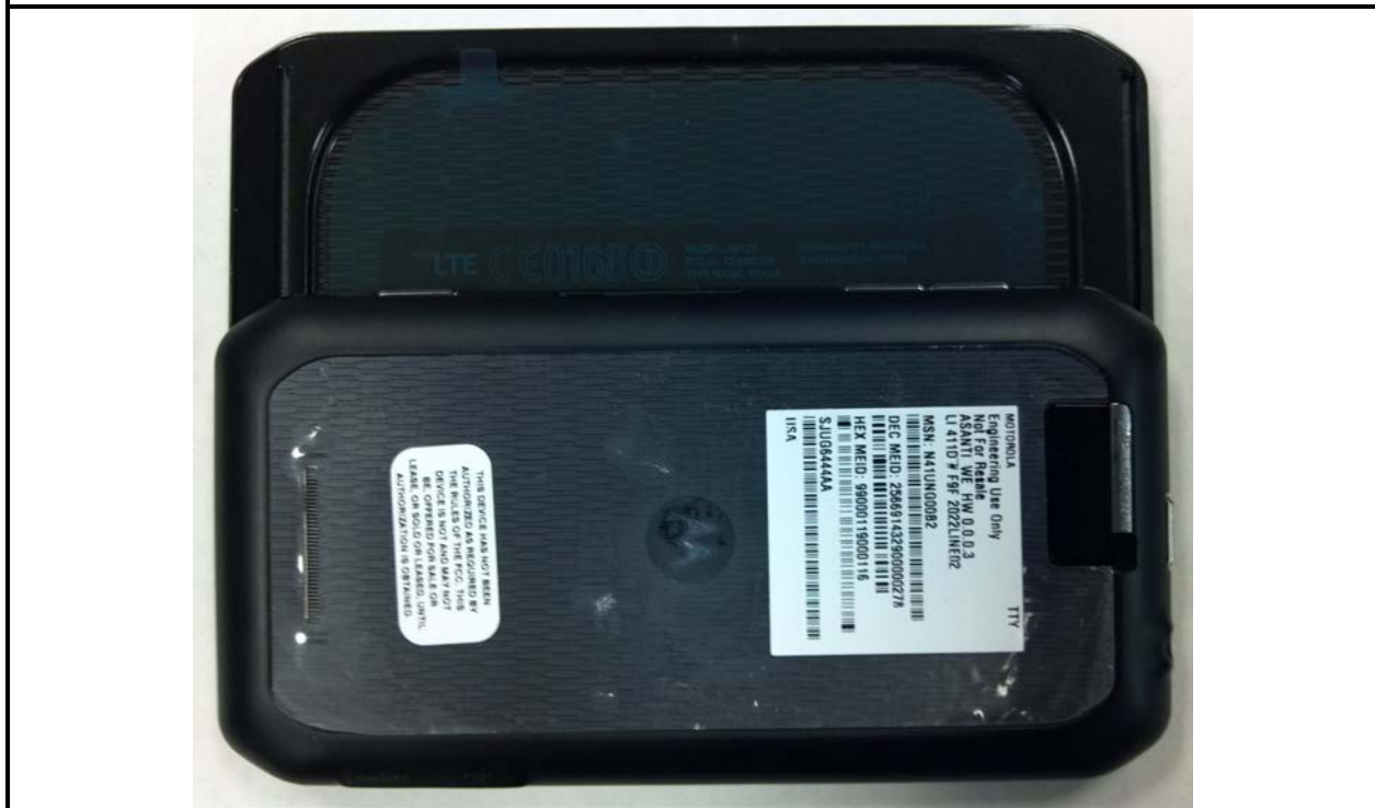
Figure 3-4. Back of device (Open)