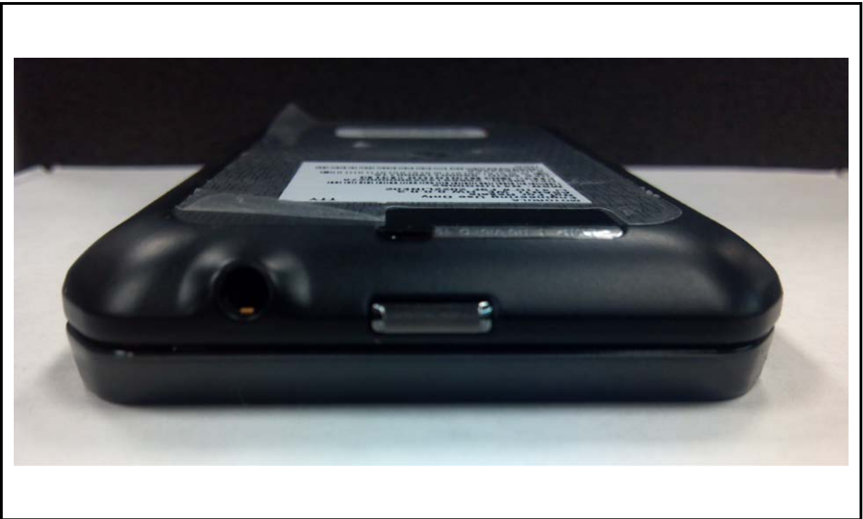
Figure 3-7. Top of Radio