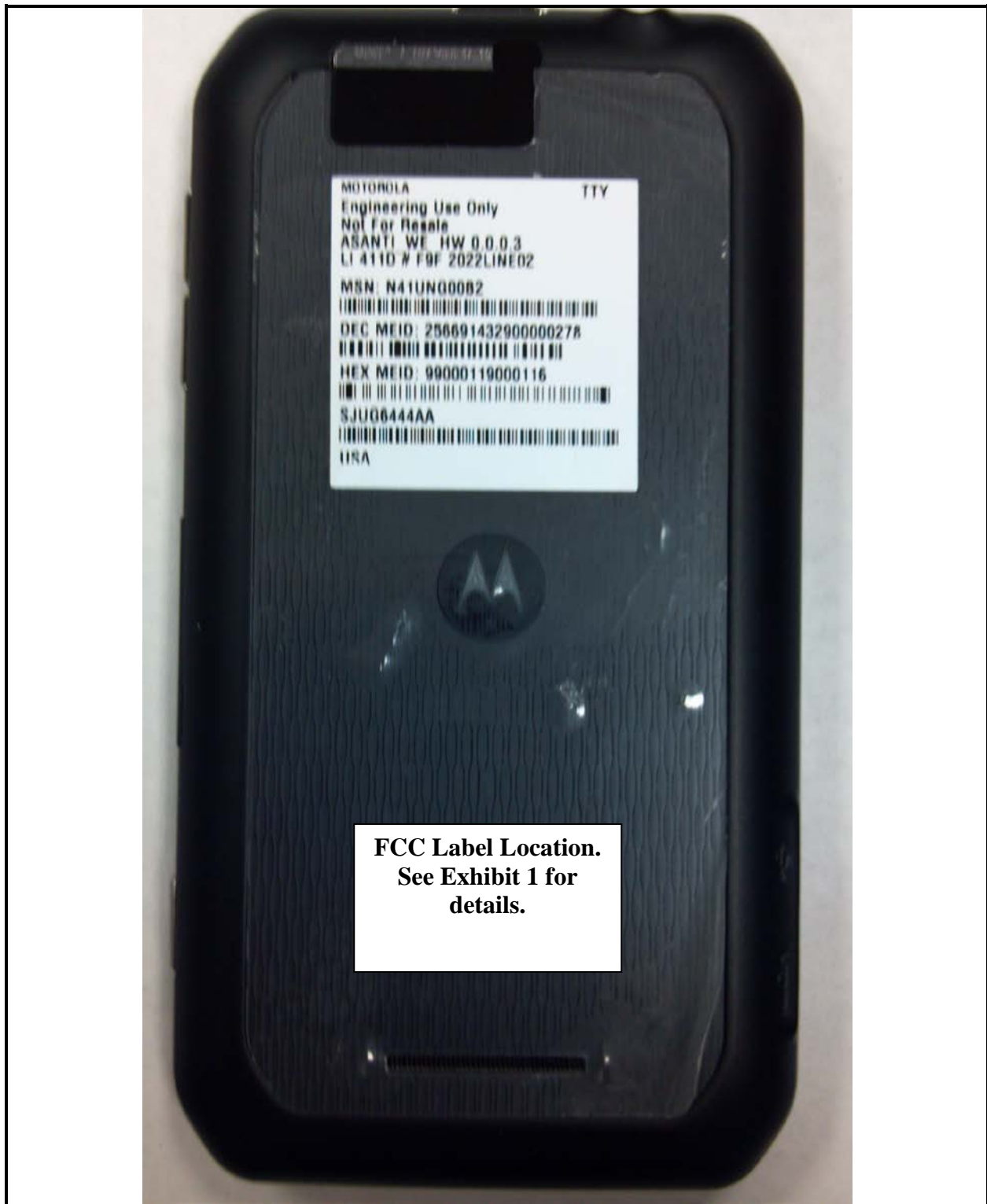
Figure 3-9. Interior Compartment of radio