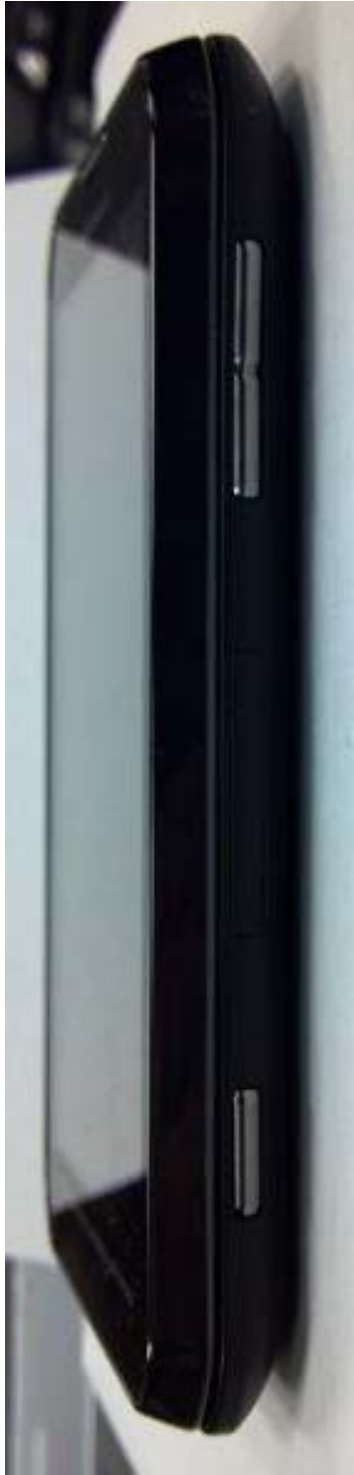
Figure 3-5. Button Side of device