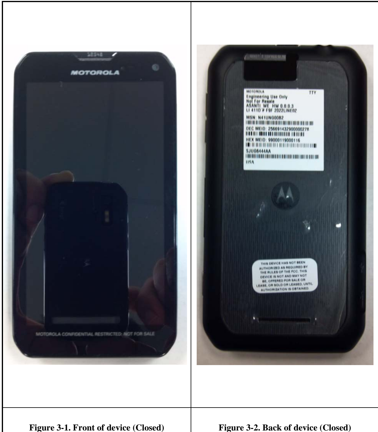
Figure 3-1. Front of device (Closed)

The radio product shapes, colors and housings/bezels may vary.