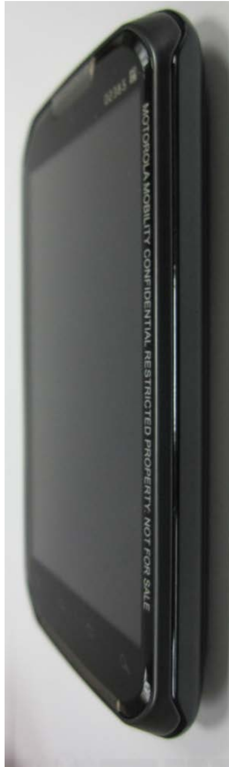
Figure 3-4. Opposite Side of device