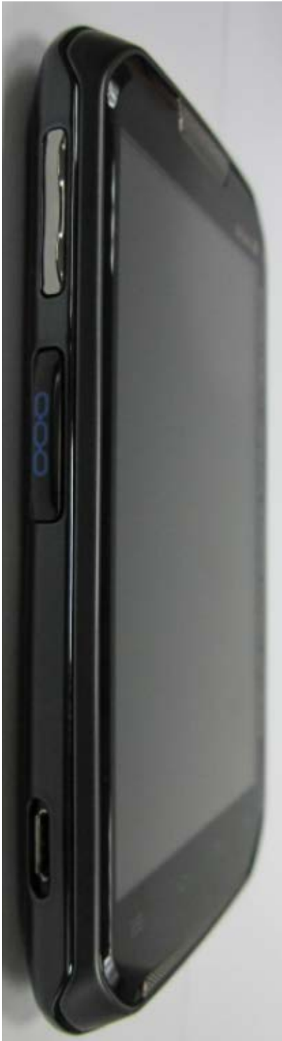
Figure 3-3. Button Side of device