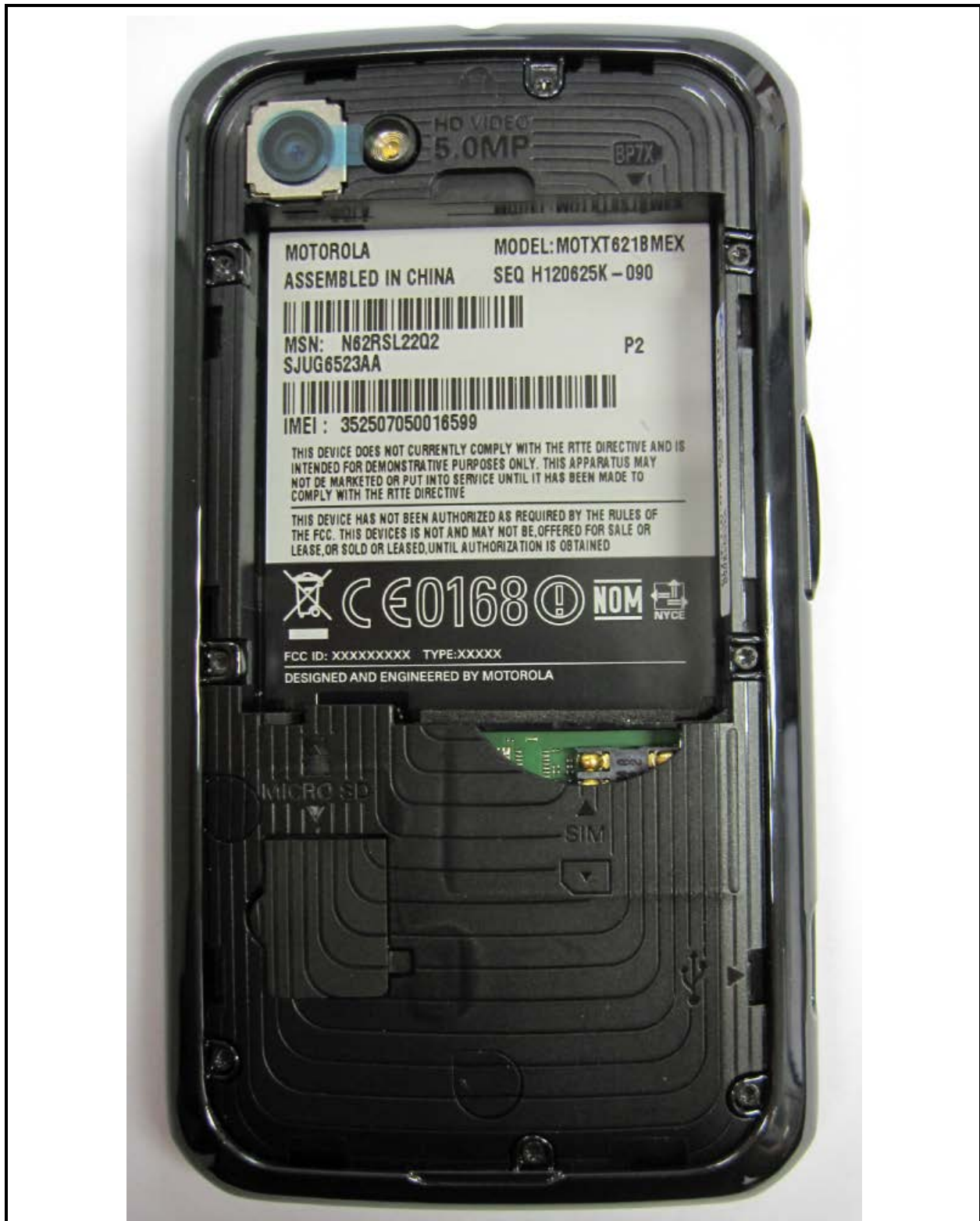
Figure 3-7. Detail of Regulatory Markings