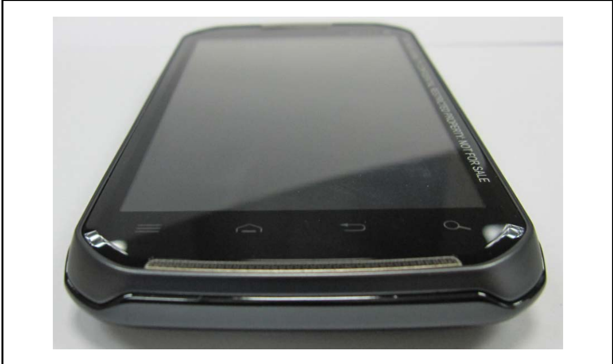
Figure 3-6. Bottom of radio