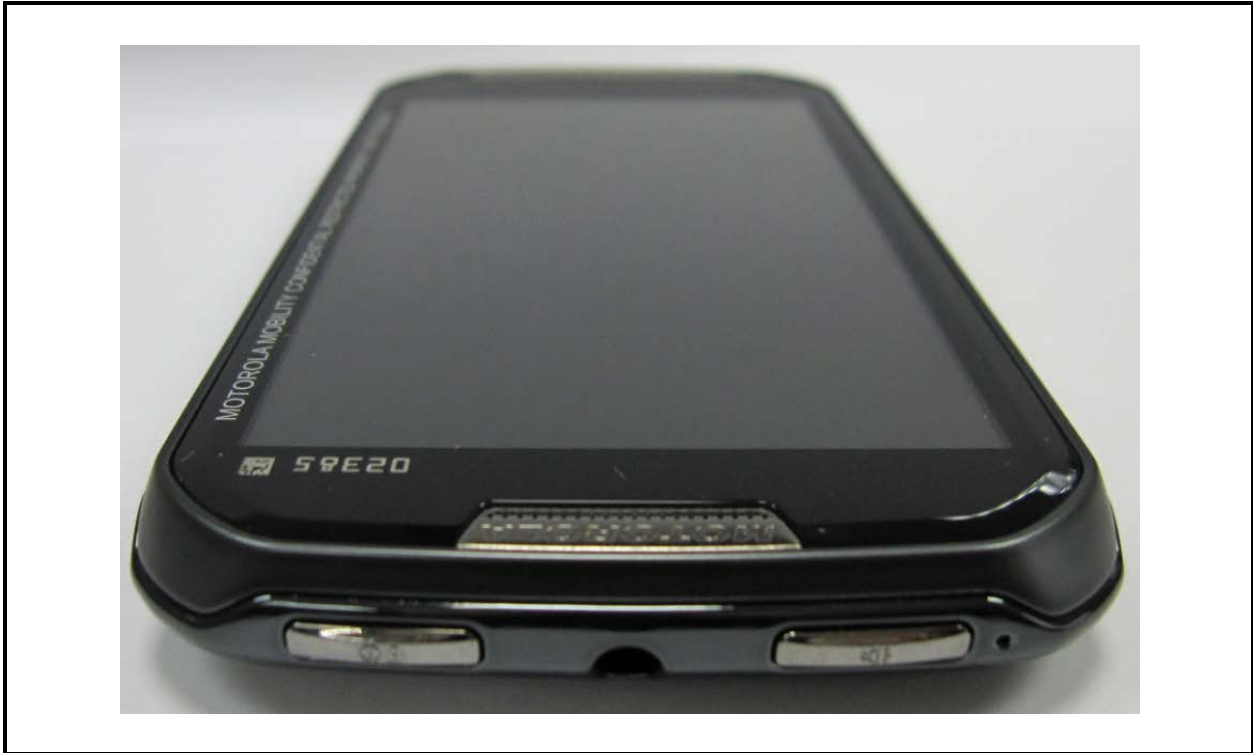
Figure 3-5. Top of radio