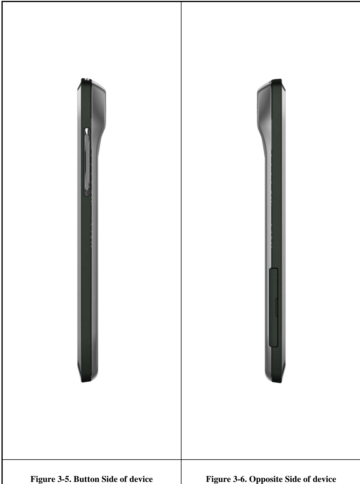
Figure 3-5. Button Side of device