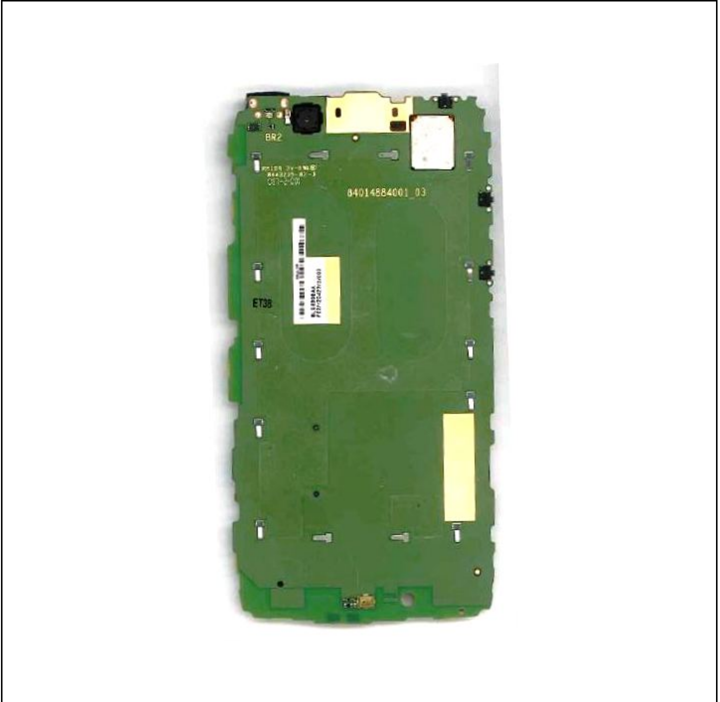
Photograph 9-1: Front side view of the device's PC Board, Shields in place.