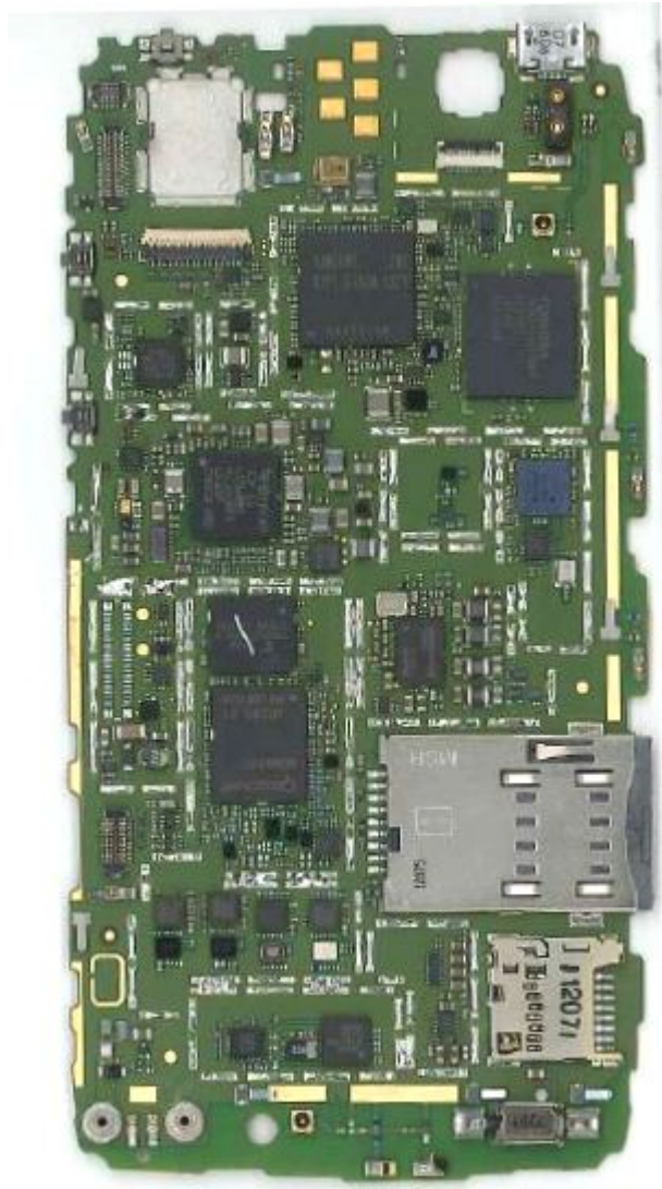
Photograph 9-4: Back side view of the device's PC Board, Shields Removed.