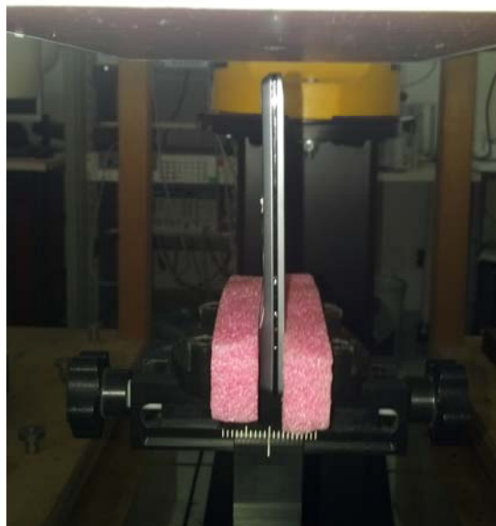
Figure Figure 7: Mobile Hotspot Position, Short Edge (Bottom / Top) of Phone facing Phantom (10 mm separation)