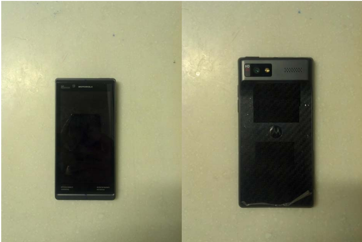
Figure 1: Phone Front and Back