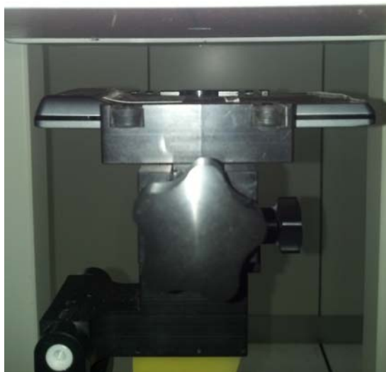
Figure 4: Body Position (25 mm separation)