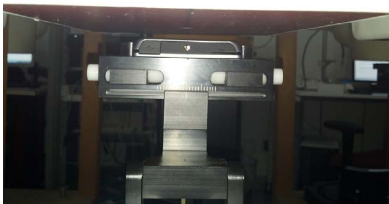
Figure 5: Mobile Hotspot Position, Back of Phone facing Phantom (10 mm separation)