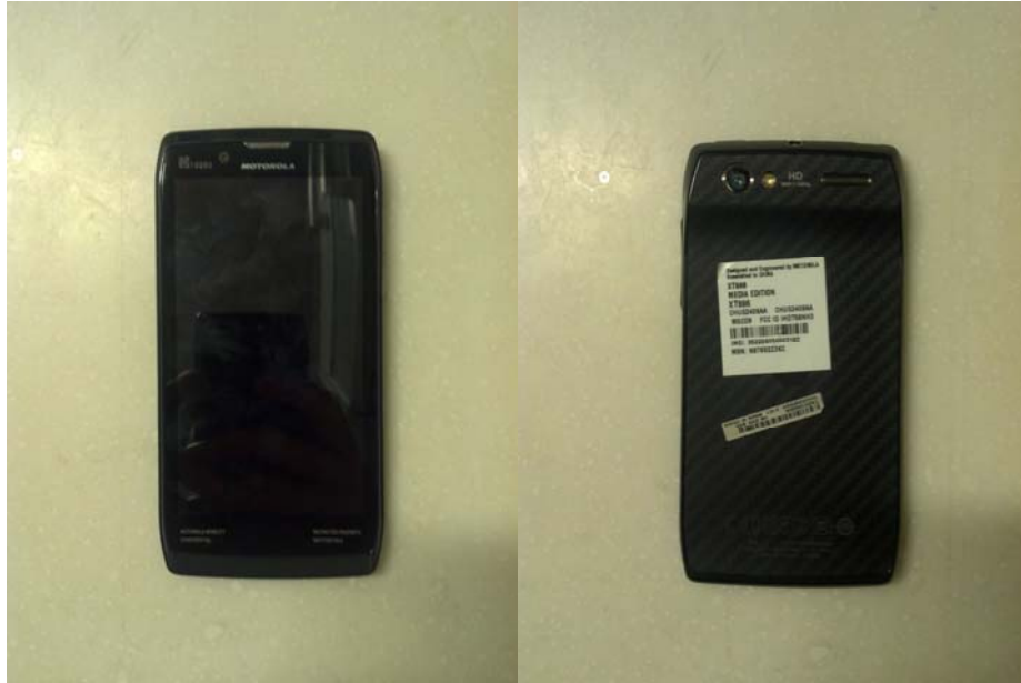
Figure 1: Phone Front and Back