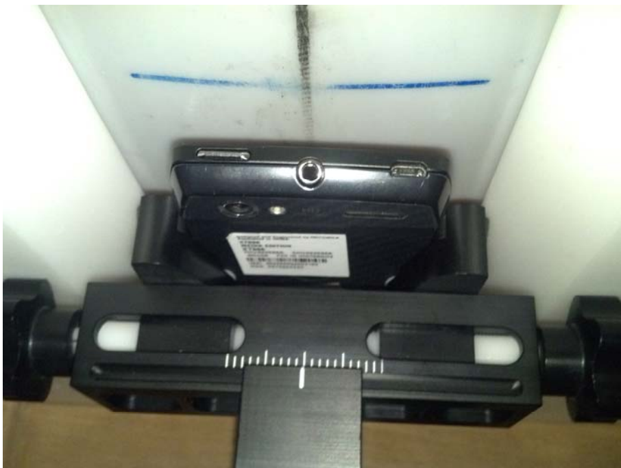
Figure 8: Mobile Hotspot Position, Back of Phone facing Phantom (10 mm separation)