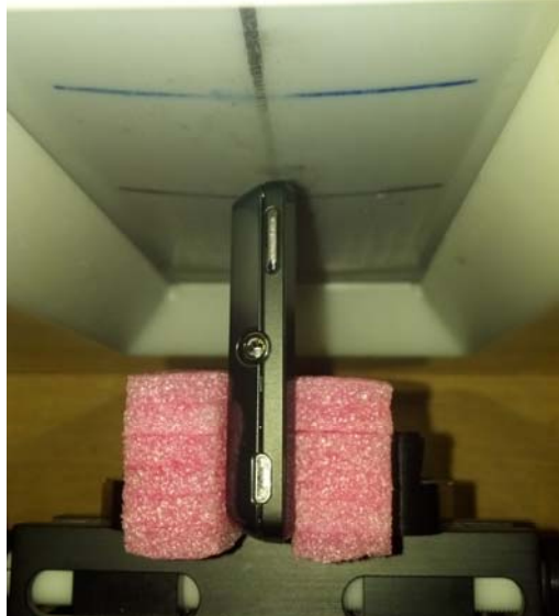
Figure 9: Mobile Hotspot Position, Right Edge of Phone facing Phantom (10 mm separation)