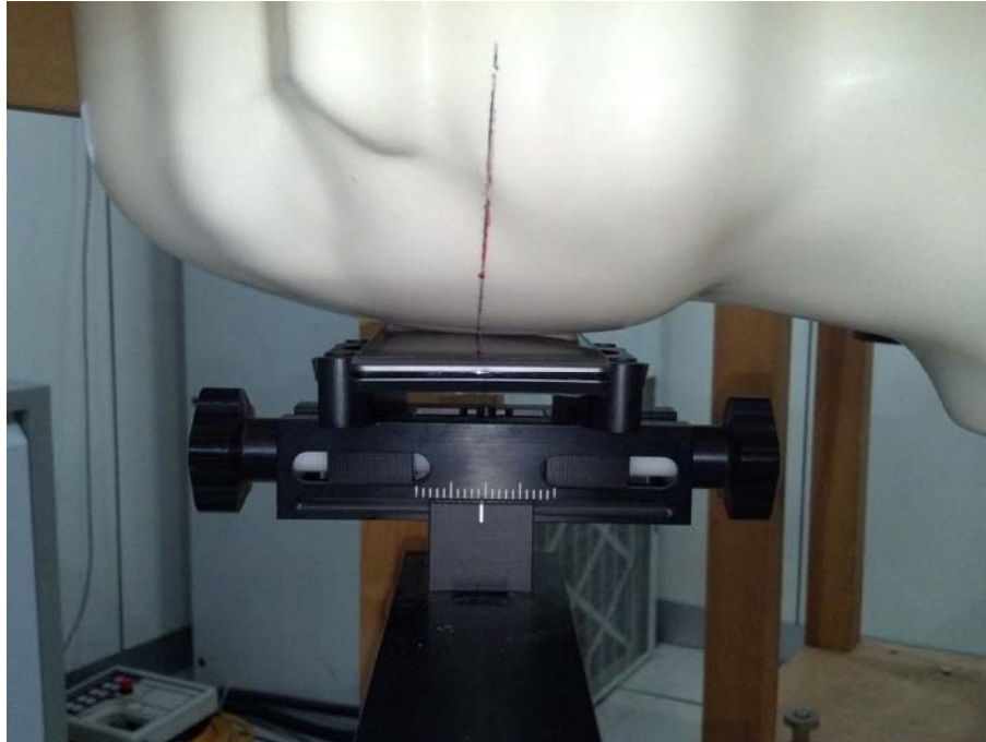
Figure 3: Cheek Position, Front of Head of Phantom