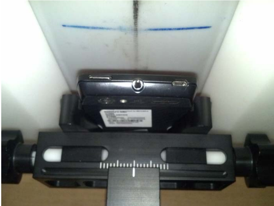
Figure 7: Body Position (25 mm separation)