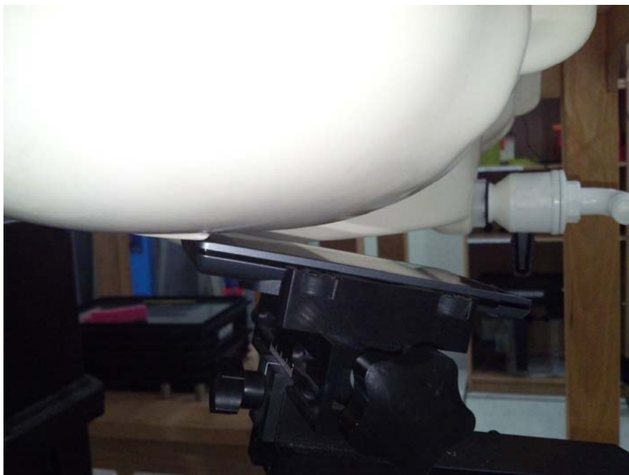
Figure 6: Tilt Position, Top of Head of Phantom