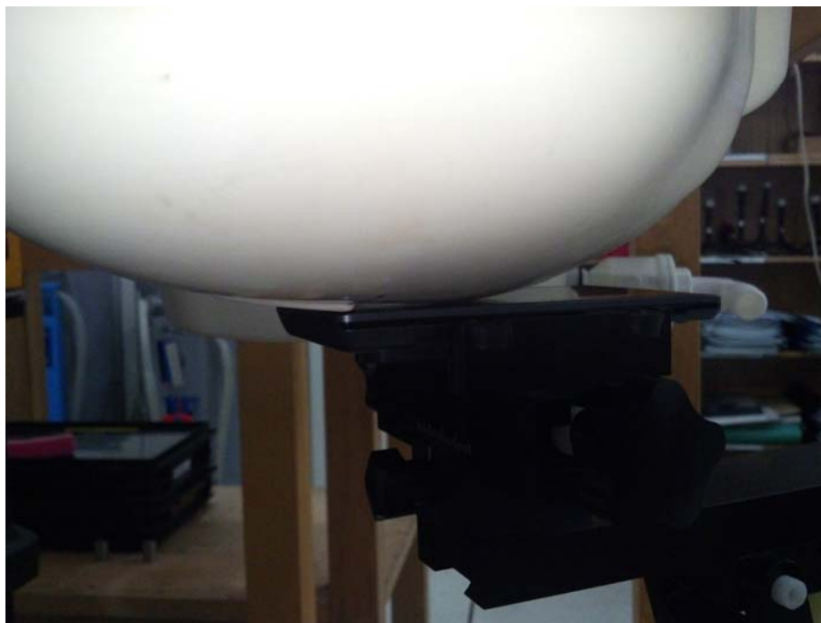
Figure 4: Cheek Position, Top of Head of Phantom