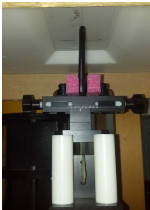
Figure 10: Mobile Hotspot Position, Bottom Edge of Phone facing Phantom (10 mm separation)