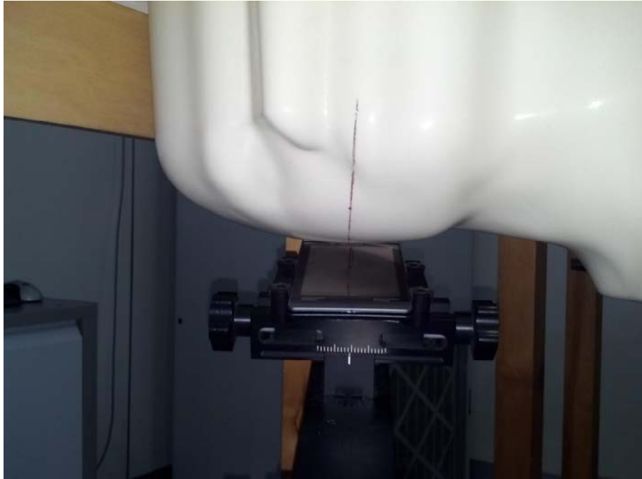
Figure 5: Tilt Position, Front of Head of Phantom